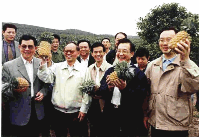
1999年2月11日，温家宝同志在龙滚考察农业生态观光旅游 wen jia bao Observe the ecological pleasure travel of agriculture in longgun in 11th 2,1999