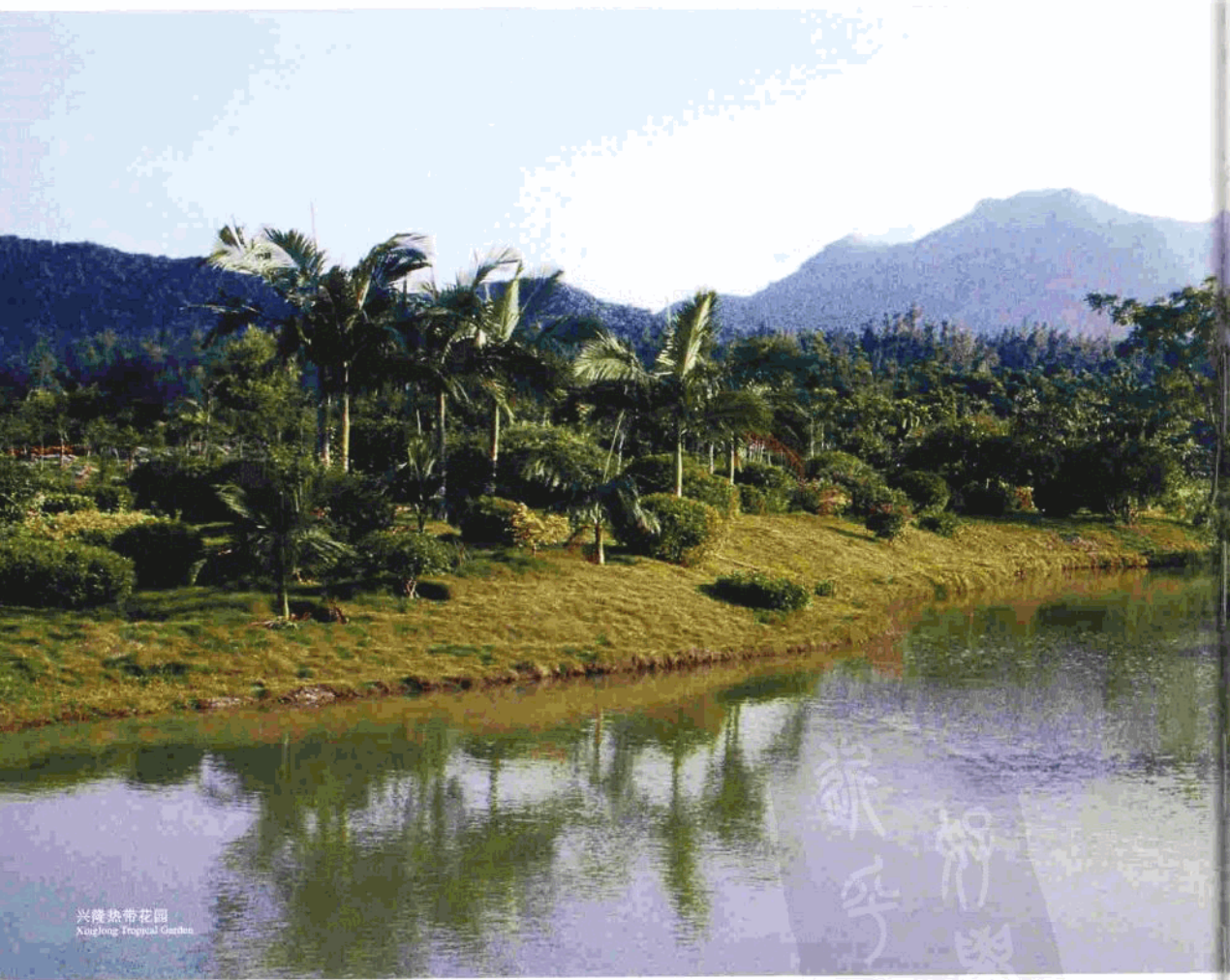
兴隆热带花园 Xinglong Tropical Garden