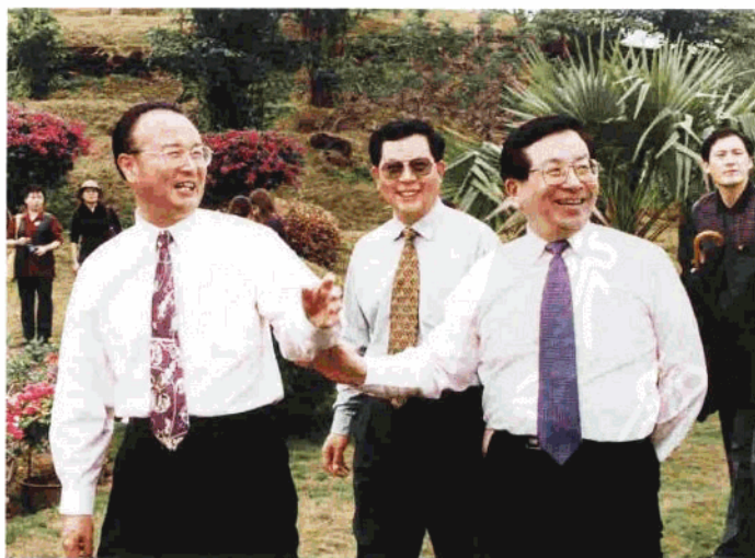
2001年2月25日，曾庆红同志在兴隆热带花园考察工作 February 25, 2001, Mr Zeng Qinhong inspected Xinglong Tropical Garden