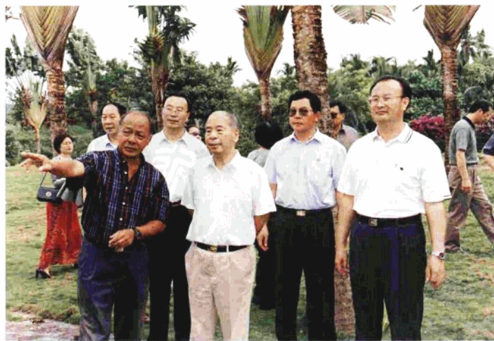
2001年3月25日，尉健行同志在万宁考察工作 March 25, 2001, Mr. Wei Jianxing inspected Wanning