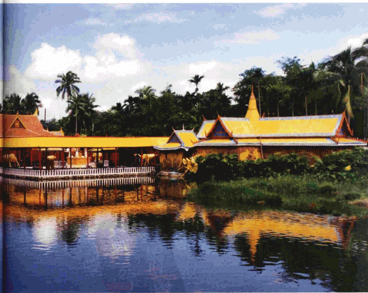
兴隆亚洲风情园 Xinglong Garden of Asian Customs