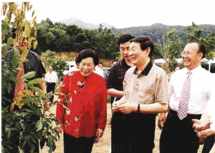
2002年4月22日，朱镕基同志在兴隆热带花园考察生态旅游资源 April 22, 2002, Mr. Zhu Rongji inspected resources about ecotourism in Xinglong Tropical Garden