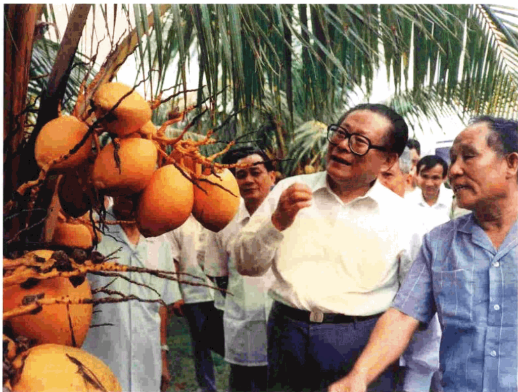
1993年4月17日，江泽民同志视察万宁兴隆华侨农场椰子园，详细了解红椰子的生长情况 April 17, 1993, Mr. Jiang Zemin inspected Wanning Xinglong Huaqiao Farm Coconut plantation to make an comprehensive enquiry about the growth of red coconut