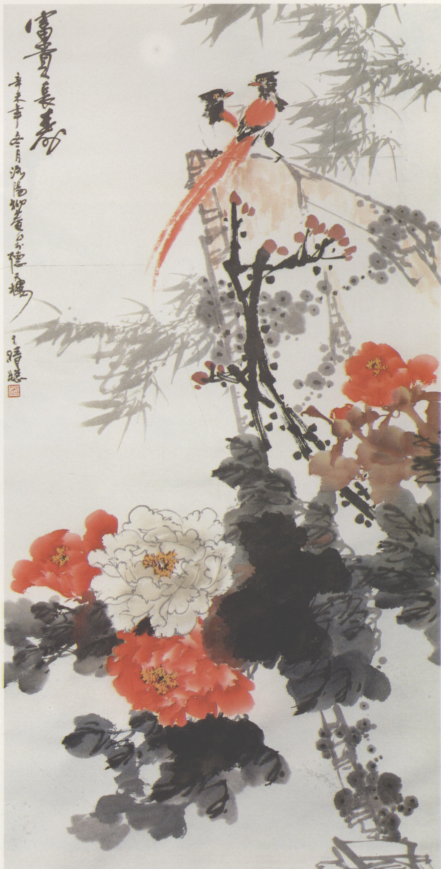
相依長壽 Long Life.