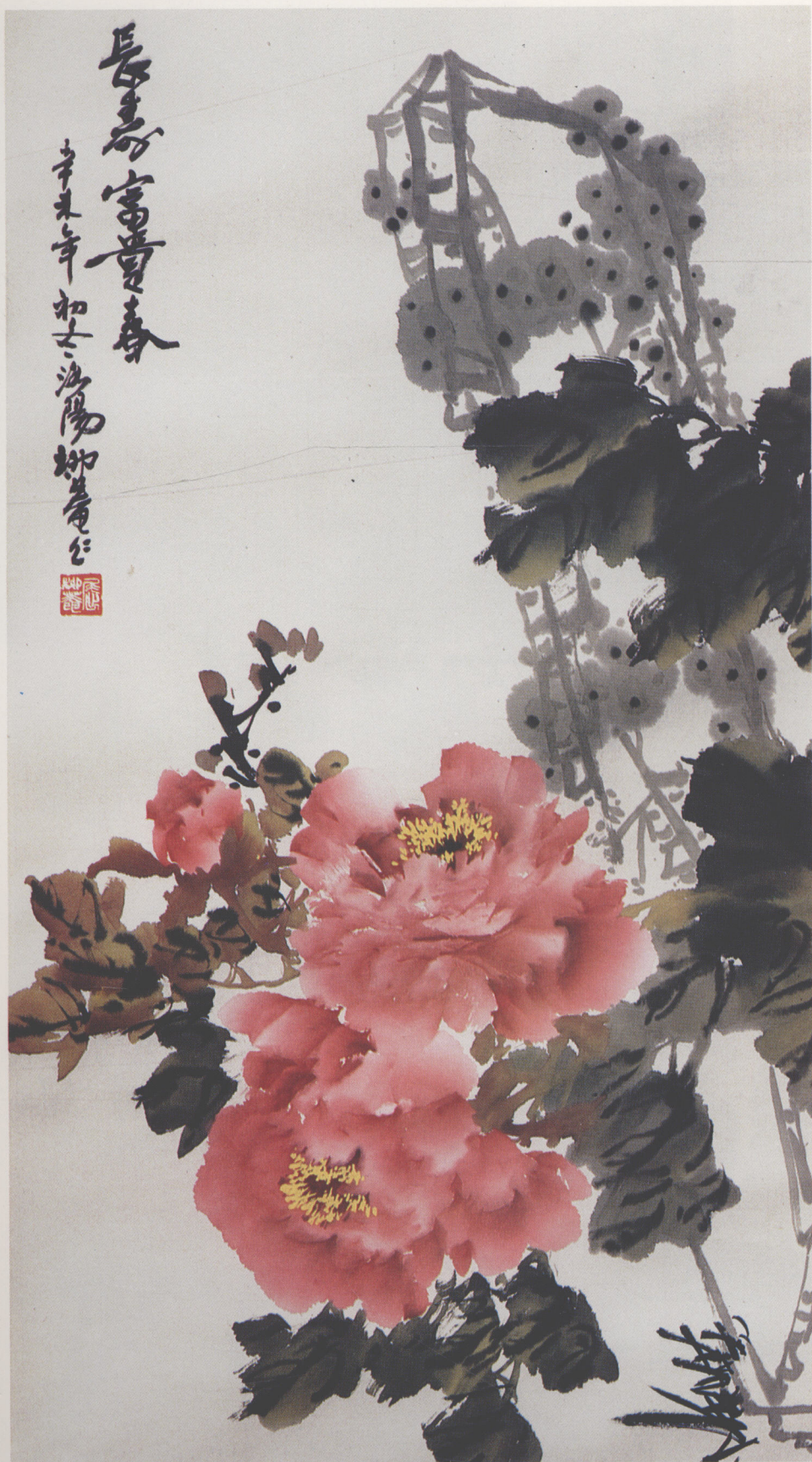
富貴長春 Long Spring.