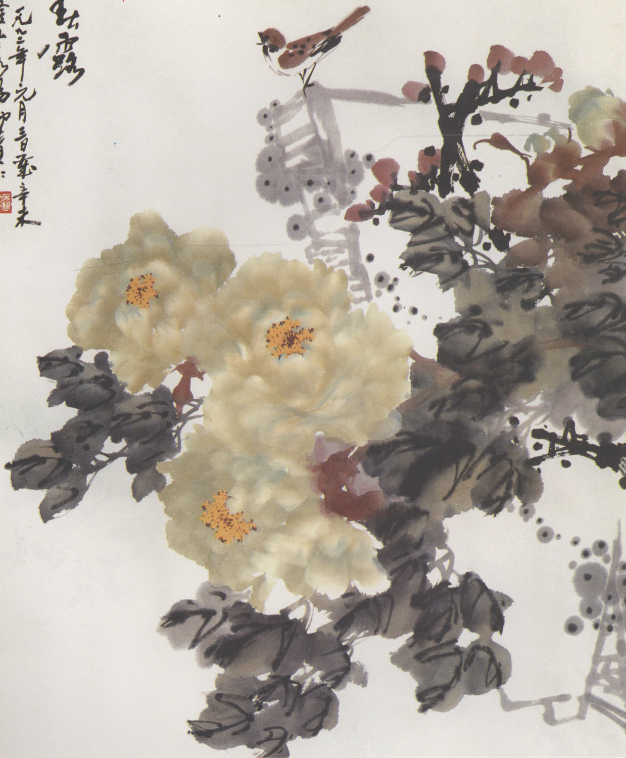
春霞 Rosy Down of Spring.