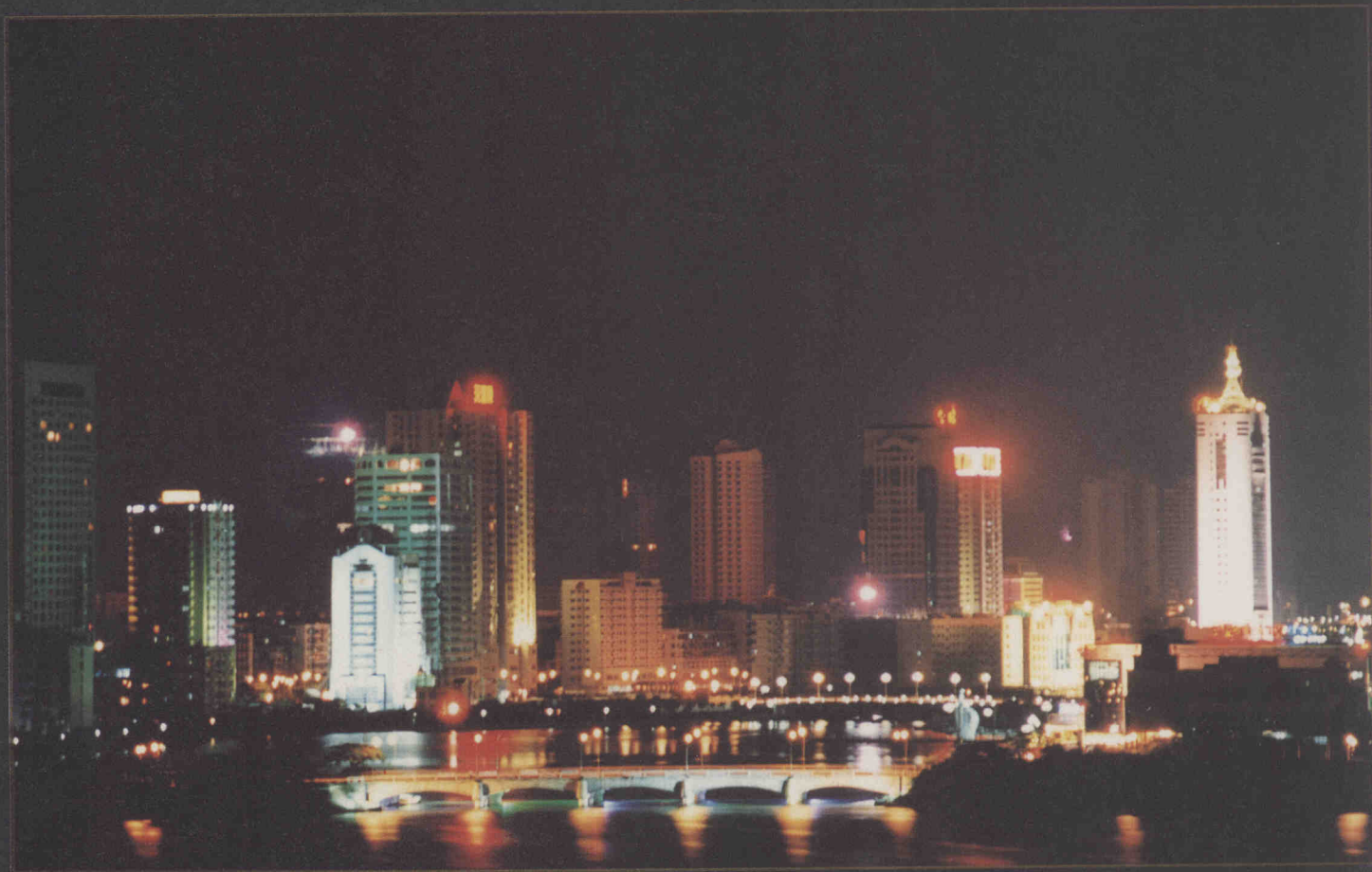
特区交响曲 SEZ symphony