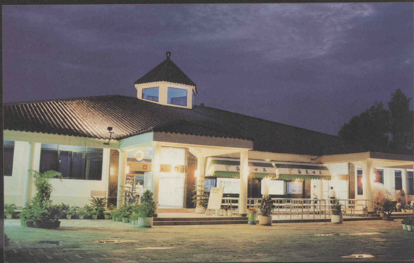
“海底世界”外景 Front View of "Submarine World"