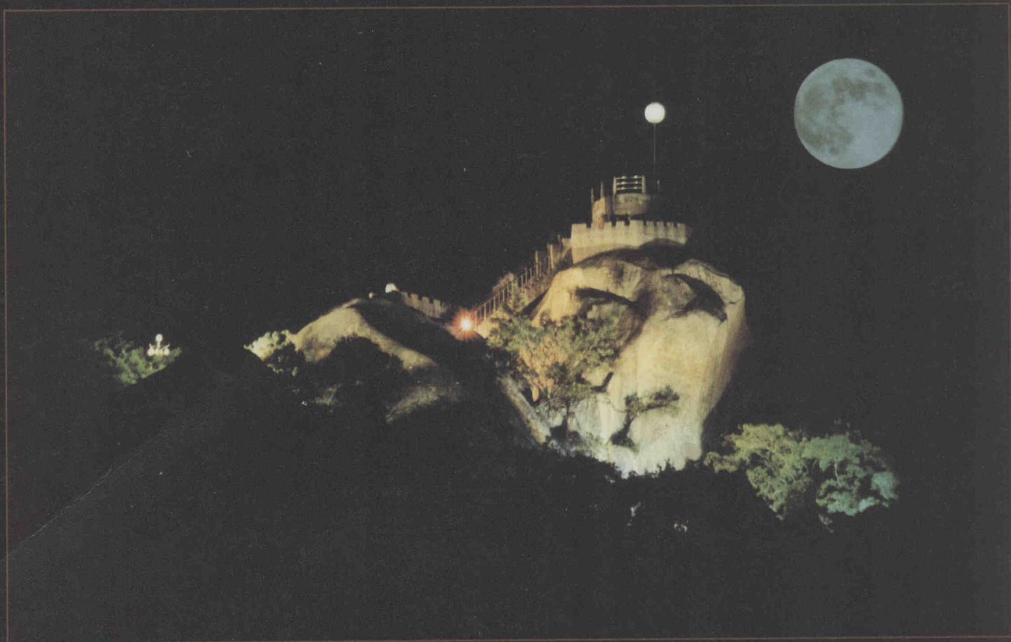
日光岩 Sunlight Rock