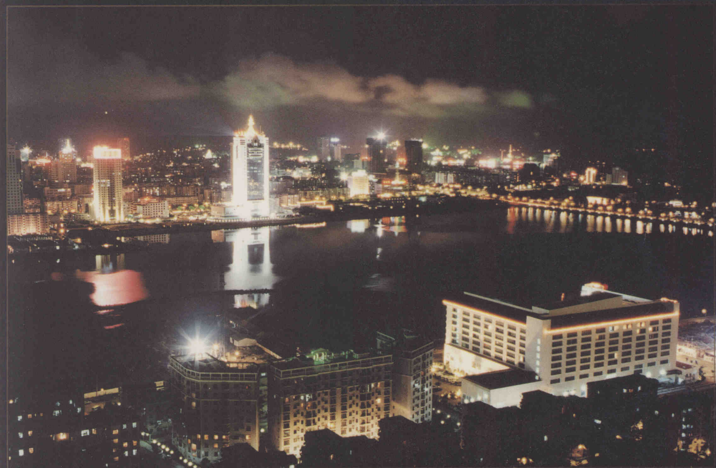
湖在城中 The lake in the city