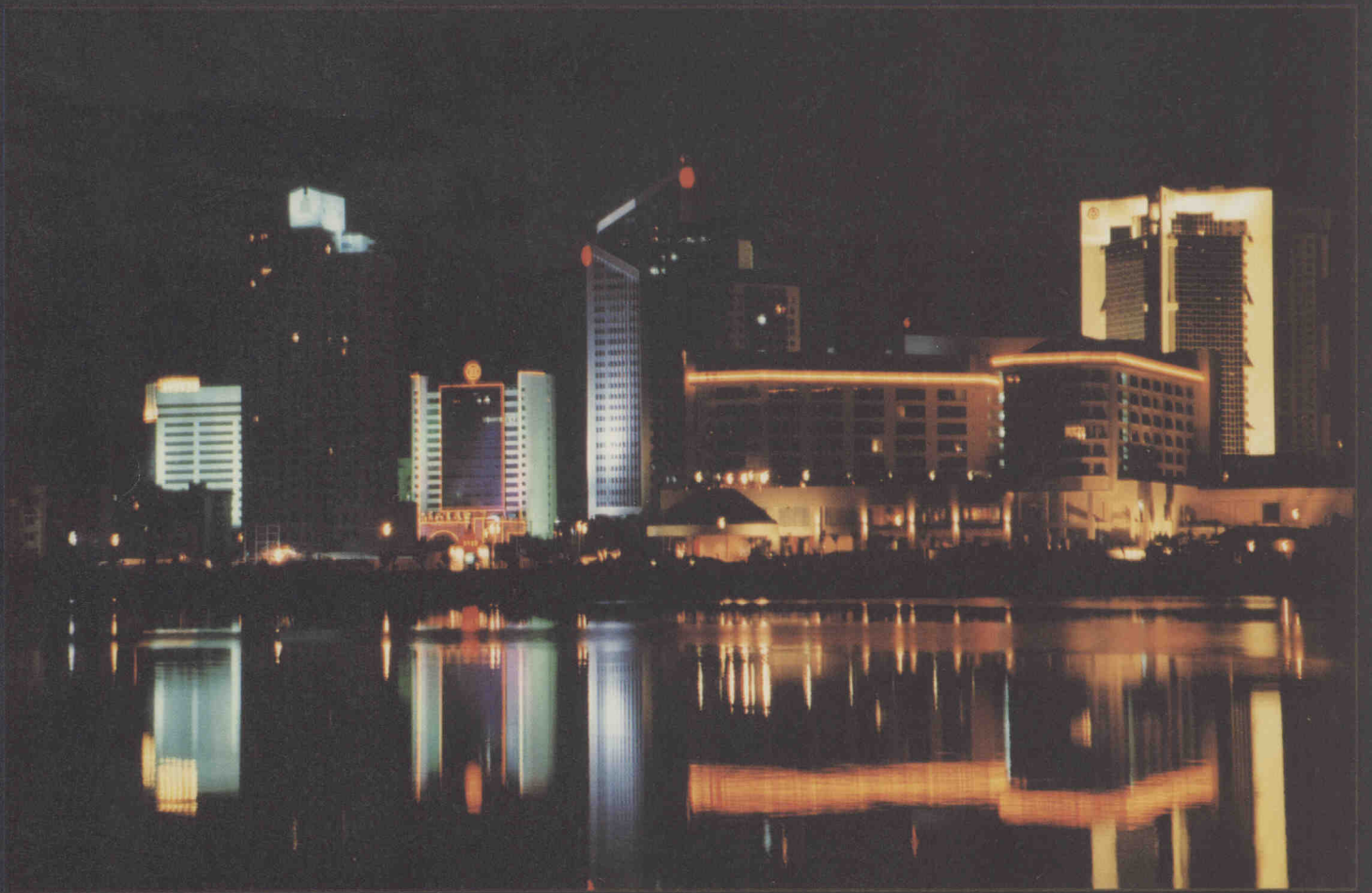
城在湖中 The city in the lake