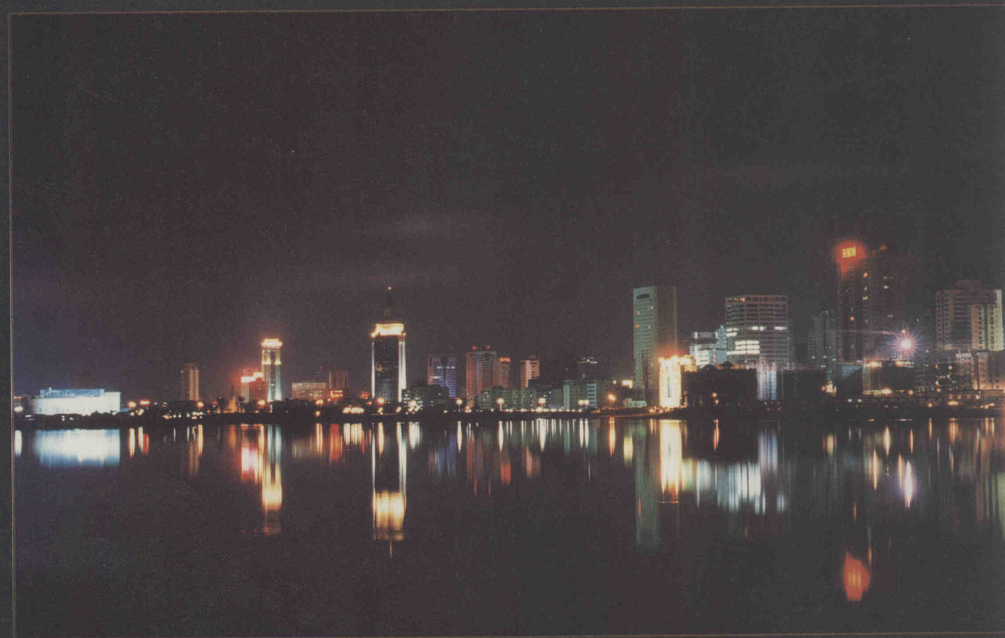
筲箕湖南岸 South Bank of Yuandang lake