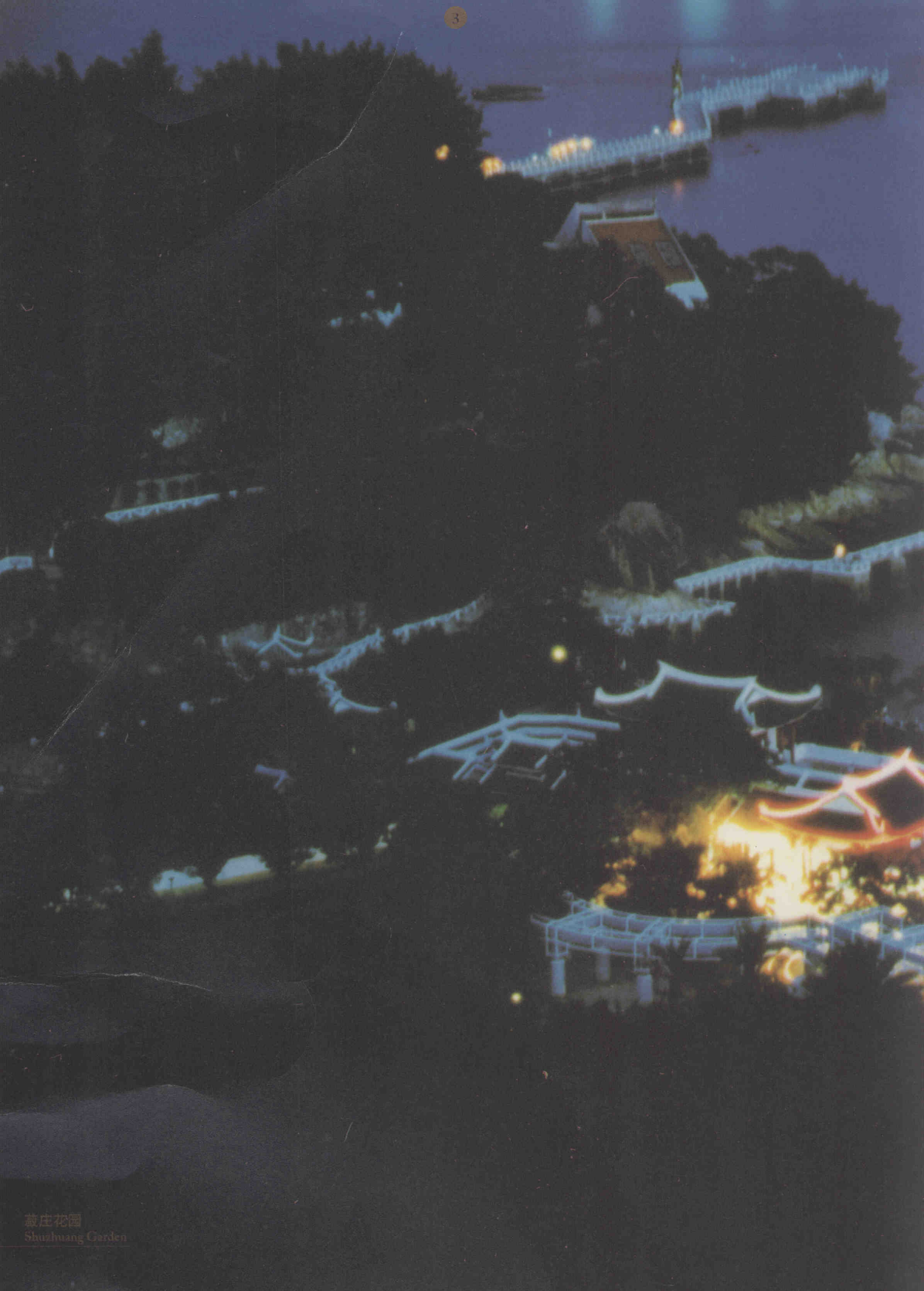
菰庄花园 Shuzhuang Garden