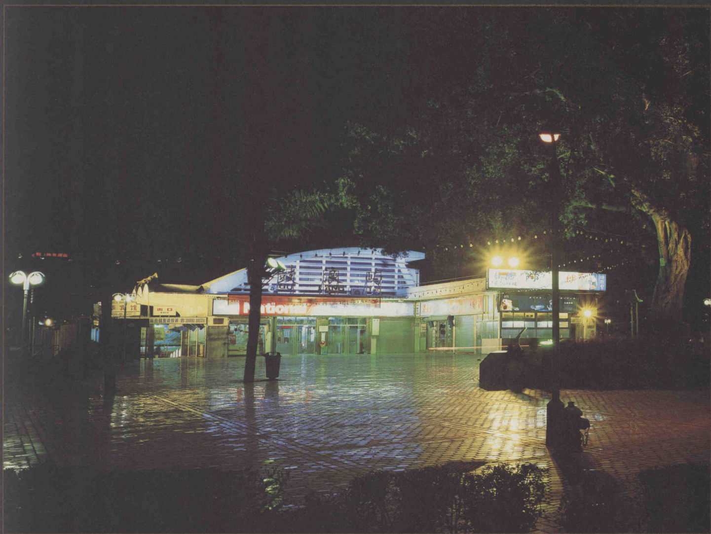
鼓浪屿轮渡码头广场 Gulangyu Ferry Wharf Square