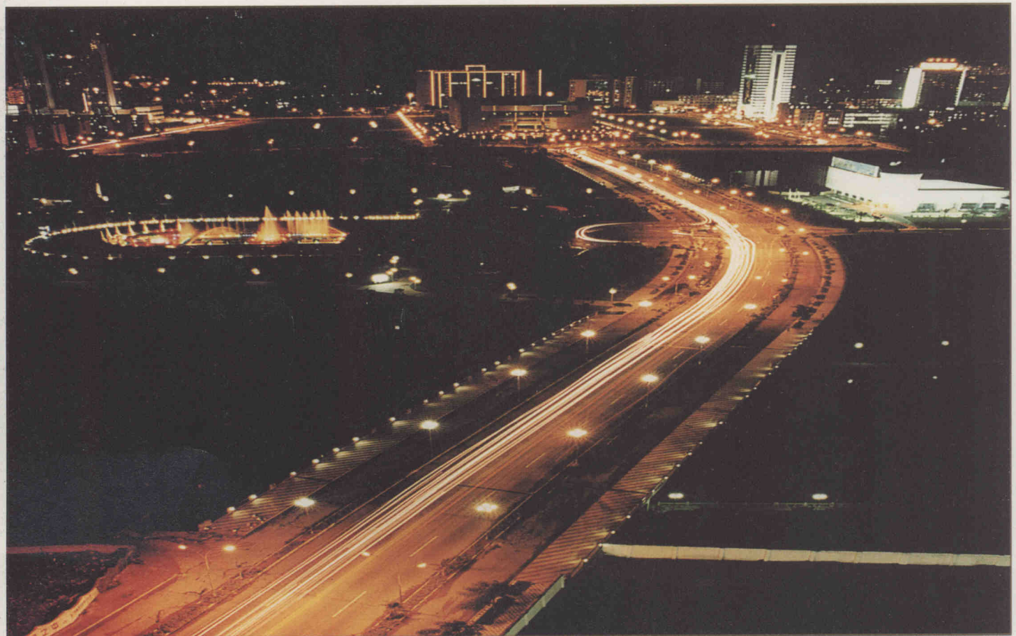
市府大道 City Hall Avenue