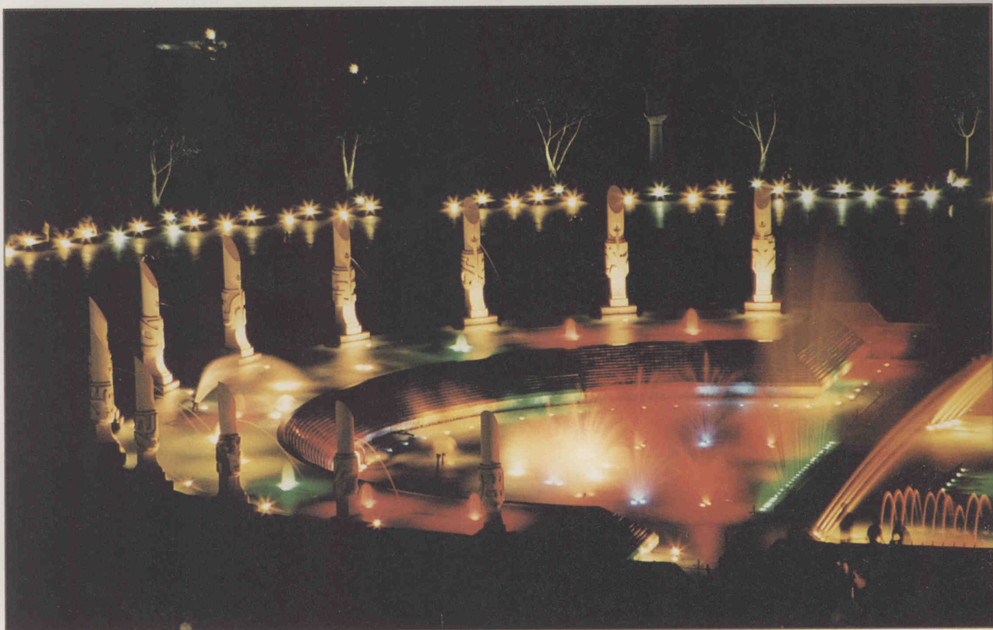
缤纷夜色 A colorful night