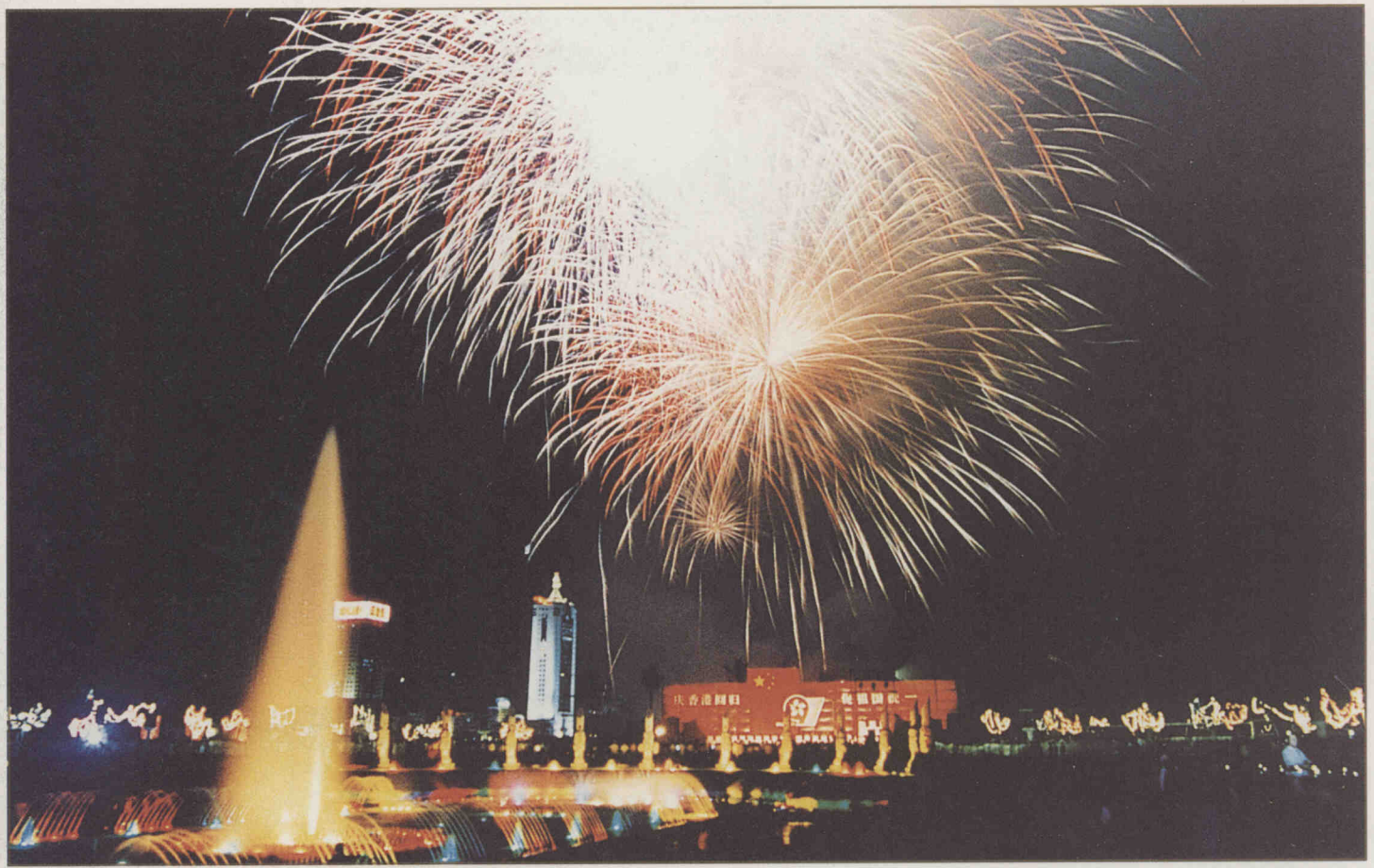
白鹭洲音乐喷泉 Bailuzhou Spring entertaining with music