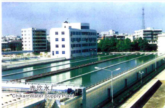
赤坎水厂 Chikan Water Supply Plant