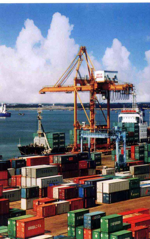
离赤坎9公里——湛江港集装箱码头 Zhanjiang Port Container Wharf——9 km off Chikan

Aviation: Zhanjiang Air Port is 4D level airport that can be used for Boe-737 and 747 passenger' plane. It has over 20 aviation lines to HongKong, Beijing, Shanghai, Guangzhou, Kunming, Chengdu, Guiyang.