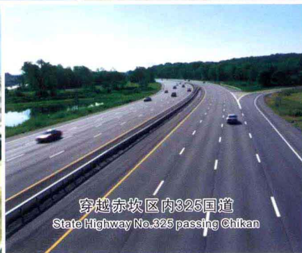
穿越赤坎区内325国道 State Highway No. 325 passing Chikan