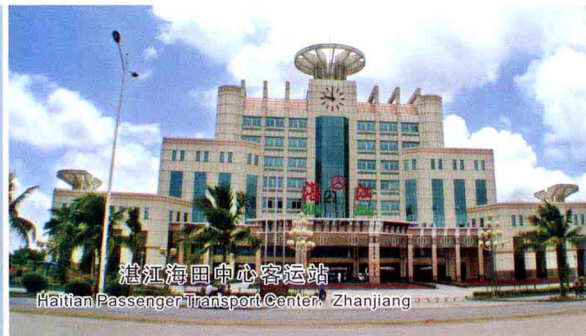
湛江海田中心客运站 Haitian Passenger Transport Center, Zhanjiang