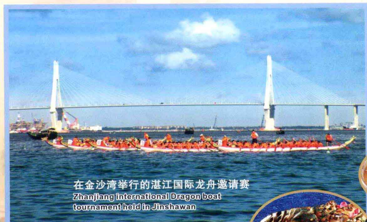
在金沙湾举行的湛江国际龙舟邀请赛 Zhanjiang International Dragon boat tournament held in Jinshawan