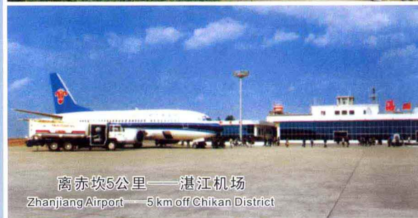
离赤坎5公里——湛江机场 Zhanjiang Airport — 5 km off Chikan District