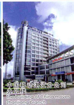
中国移动湛江分公司 办公楼 The building of China moves zhanjiang branch