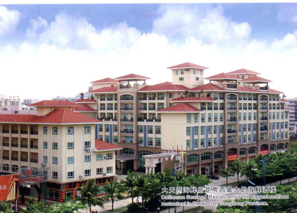
大天然海鲜居是粤西最大的海鲜酒楼 Datianran Seafood Restaurant is the biggest seafood restaurant in the west of Guangdong Province.

Zhanjiang has a rich and unique seafood resources. There are the Datianran Seafood Restaurant, Jinhai Holiday Inn, Haoyuan Restaurant, Ocean International Restaurant, Chikan Hotel, etc. The food festival will be held in Chikan every year. Chikan has gained the reputation of "Eating in Chikan".