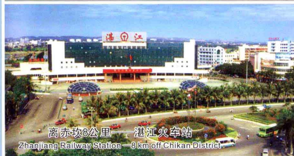
离赤坎8公里——湛江火车站 Zhanjiang Railway Station — 8 km off Chikan District