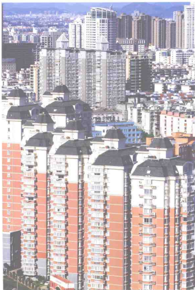
锦地水岸 Jindi River Bank