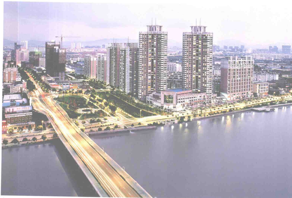
流光溢彩 Flowing colour