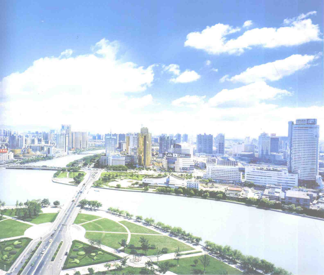
远眺江东 Bird view