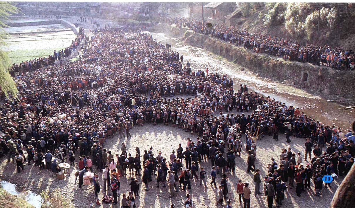
芦笙会 Lusheng-pipe Festival

gathering for the festival can be as many as fifty or sixty thousand. People of different nationalities sing and dance; the place will become bustling and boisterous. The folk songs and dances here are characteristic. They are ancient Miao songs, flying songs, polyphonal songs, wine songs, love songs, ballads, Miao's lusheng dance, wood drum dance, stool dance, bronze drum dance, etc. When the Spring Festival or holidays come, the Miao girls, dressing up carefully and wearing their best costumes, sing sweet flying songs to young fellows, play love tune of the lusheng-pipe and dance in simple and pleasing lusheng dance, bronze drum dance and stool dance. During the festival, there are also exciting popular activities like bull fighting, bird fighting, rooster fighting, horse racing and so on. Numerous participants constitute a great multitude of crowds and a scene of great joy.