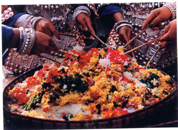
姊妹饭 Sisters' Rice