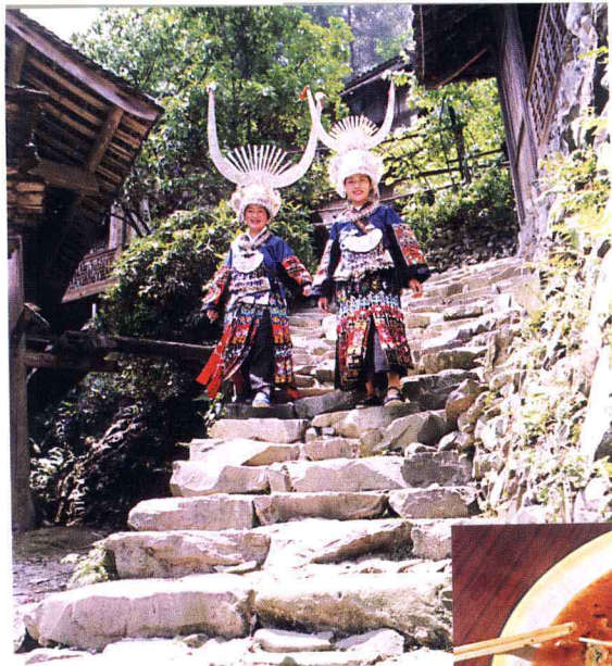
姊妹情 Sisters' Passion