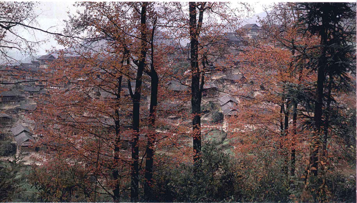
苗寨风光 Scene of a Miao Village