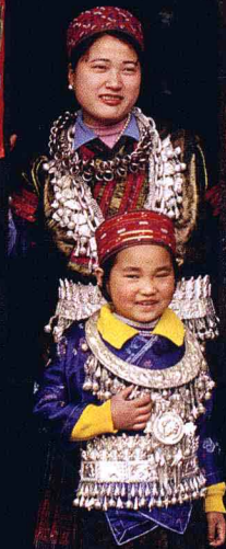
迎春 Greeting Festival