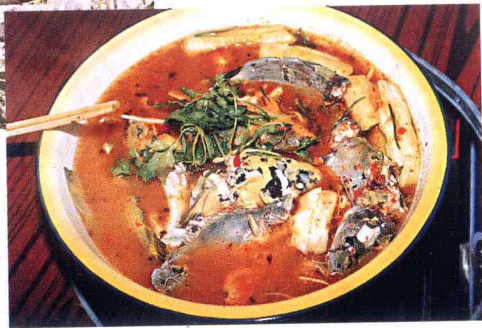
酸汤鱼 Fish in Sour Soup