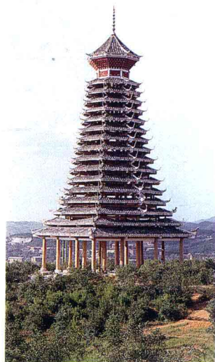
侗寨鼓楼 The Dong Drum Tower