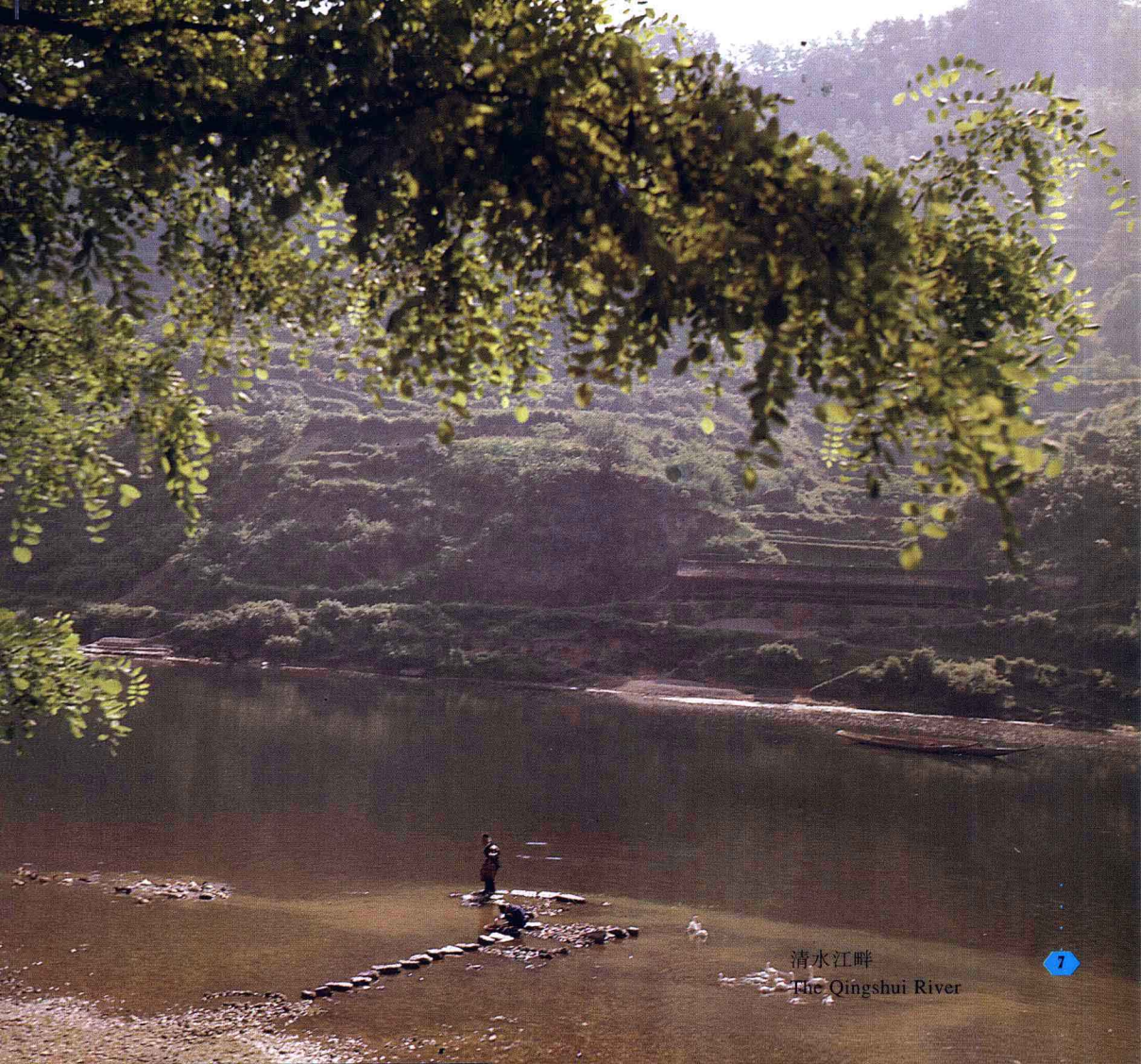
清水江畔 The Qingshui River