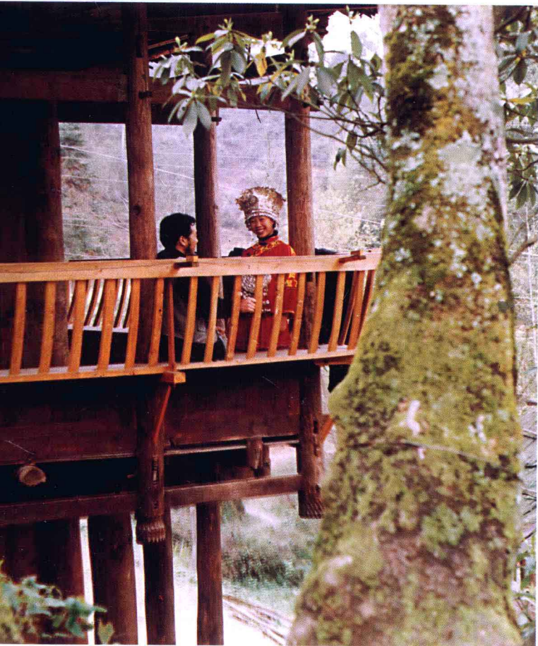
苗寨吊脚楼 The Miao's Pole-supported House