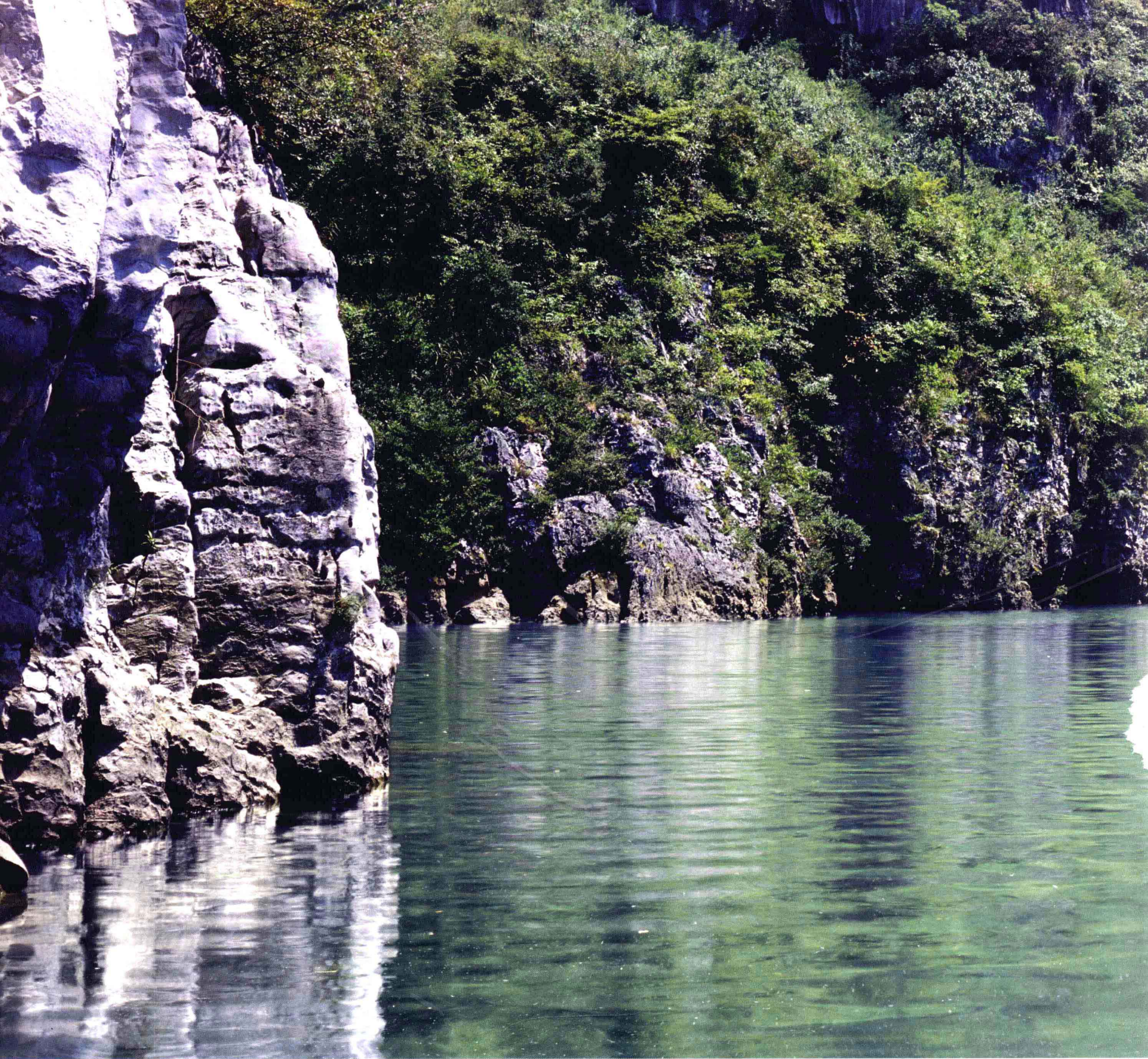
奇山秀水洛北河 Luobei River with wonderful mountains and beautiful rivers