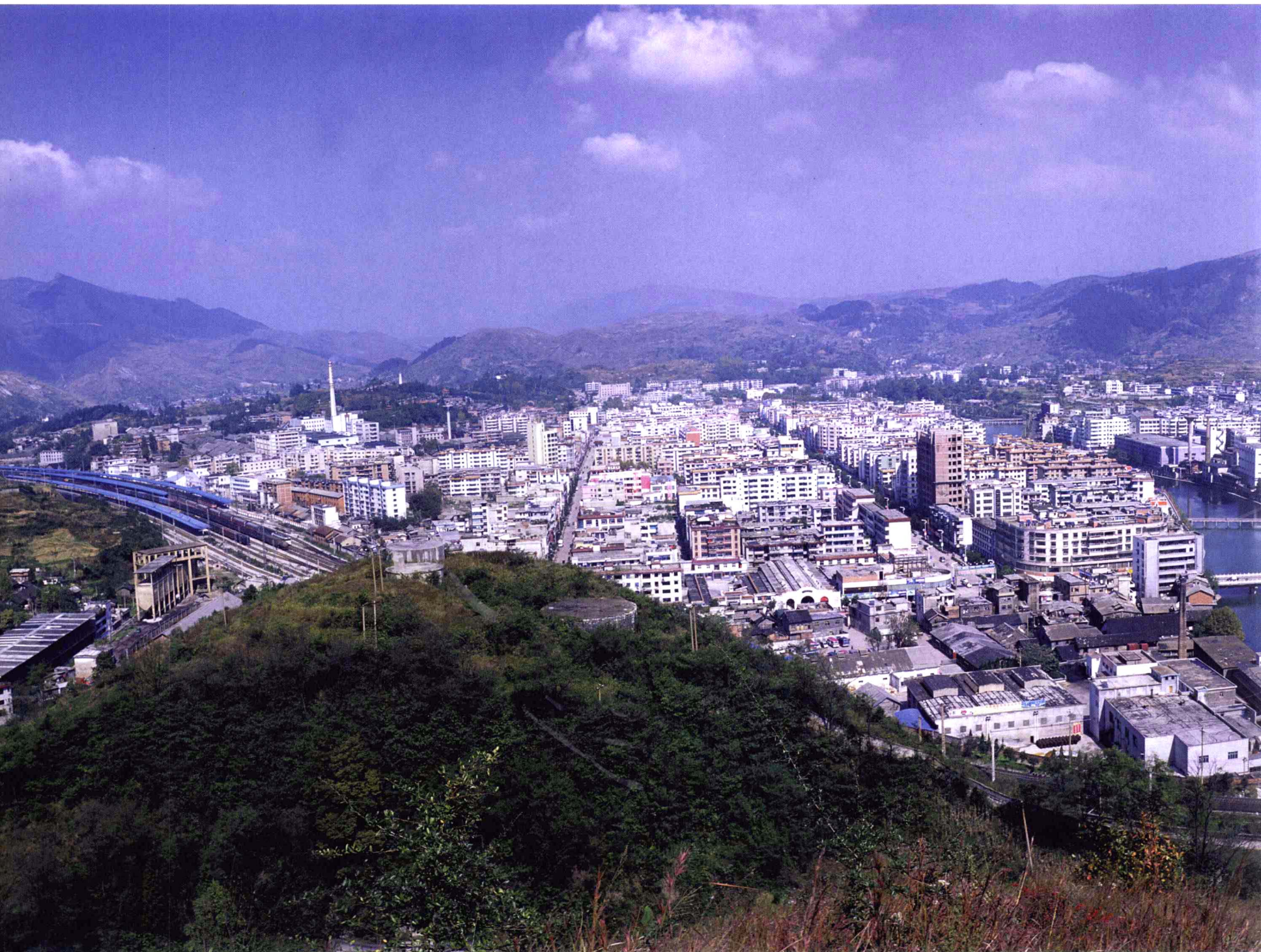
欣欣向荣的贵定县城 Flourishing Guiding County