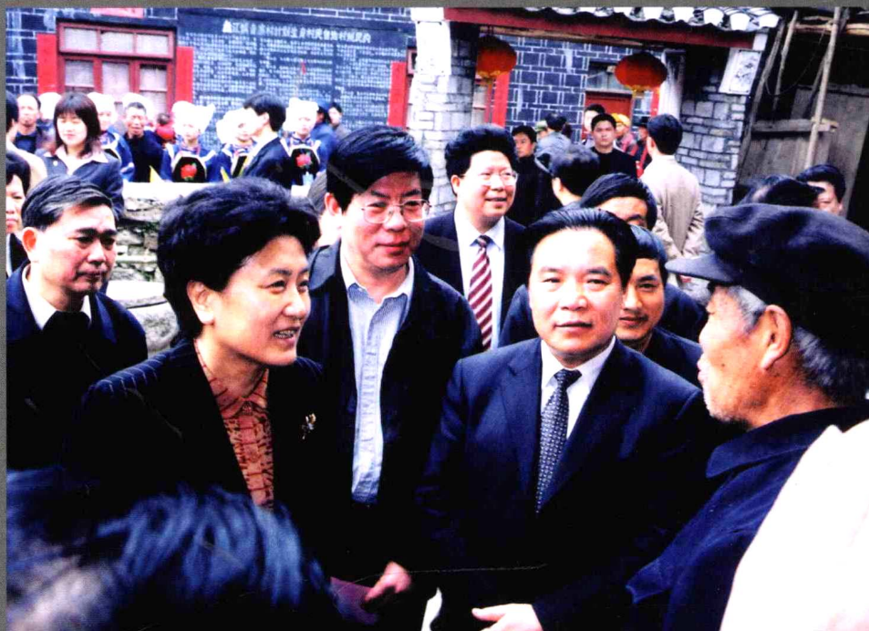
刘延东副主席深入农家与村民亲切交谈 Liu Yandong, the vice chairman talked with villagers