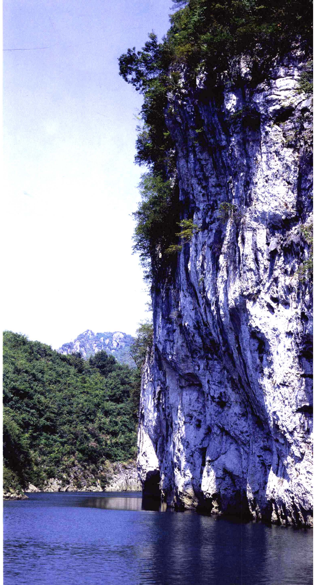
峻峭的山峡 Sheer mountains