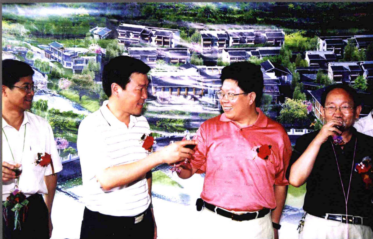
共庆贵定旅游招商引资签约成功 Celebrated successful signing for Guiding travel