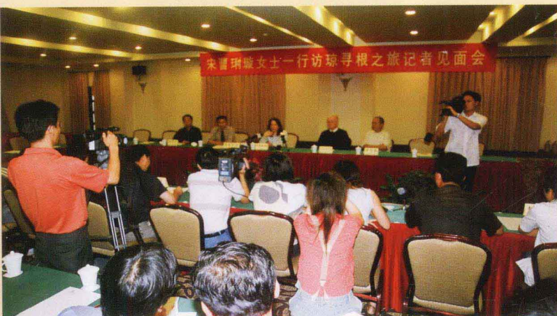
记者见面会 Press Conference