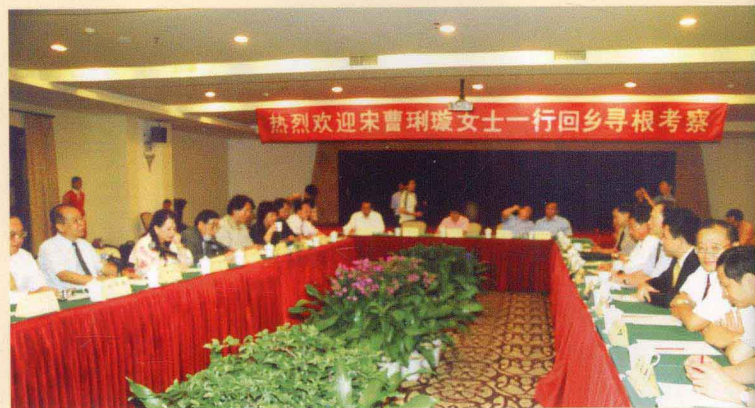
文昌市人民政府举行欢迎座谈会 The Municipal Government of Wenchang City held welcome colloquia.