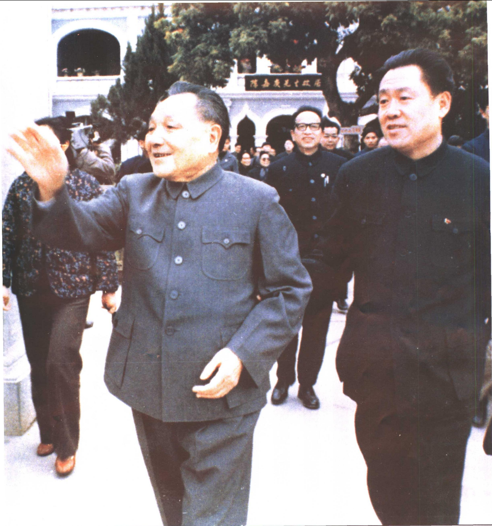
鄧小平同志視察集美學村 Comrade Deng Xiaoping inspecting Jimei Schools Village