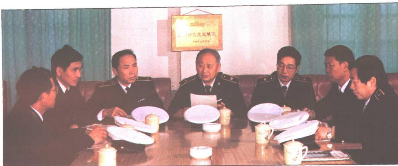
學院領導班子 The leading group of the institute

港，為教學和科研提供了優越的條件。校園佔地近300畝。全院有實驗室20多個，設備先進。其中雷達模擬器、衛星導航裝置、雷達自動標繪儀、電子計算機系統都稱得上目前世界上較先進的設備。學院擁有13,000噸級的遠洋實習船一艘，400噸級的近海實習船2艘，還有實習工廠和海上訓練中心。學校的體育運動場寬闊，設備完善。新建的學院圖書館藏書數十萬冊，有中外期刊逾千種。這一切都為學生在德、智、體等方面的發展創造了良好條件。