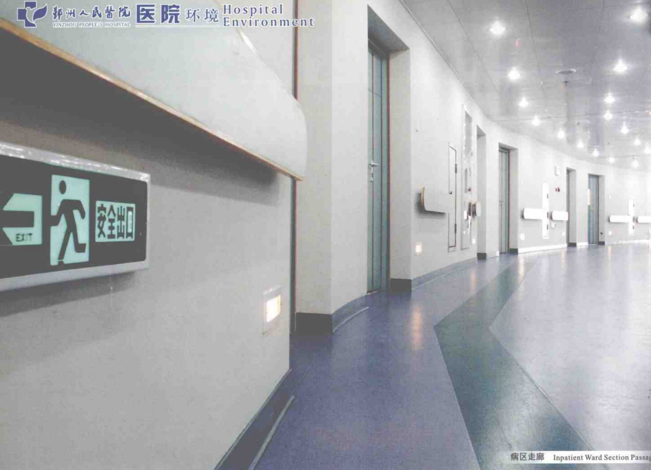
病区走廊 Inpatient Ward Section Passage