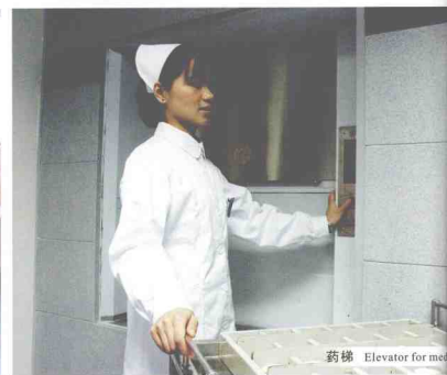
药梯 Elevator for medicine