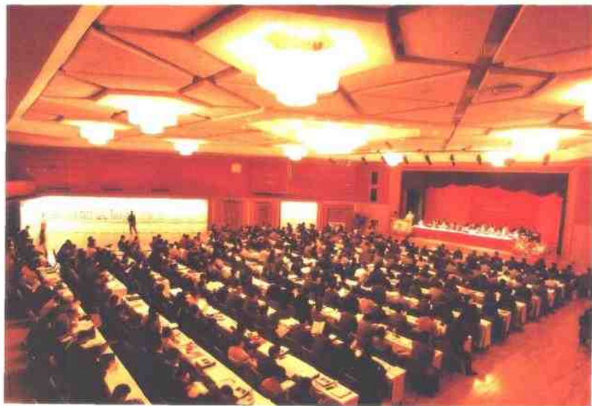
中国皮革工业协会三届四次理事扩大会议会场 1998 年 11 月 20 日 北京

The 4th session of the third board meeting of China Leather Industry Association Held on Nov. 20, 1998 Beijing