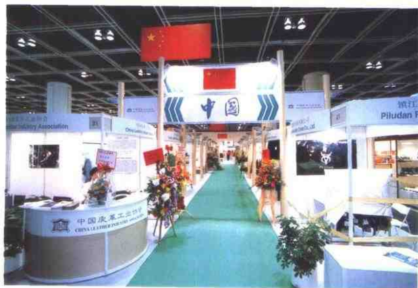
1998年香港亚太皮革展中国馆 The Chinese Pavilion at '98 Asia Pacific Leather Fair