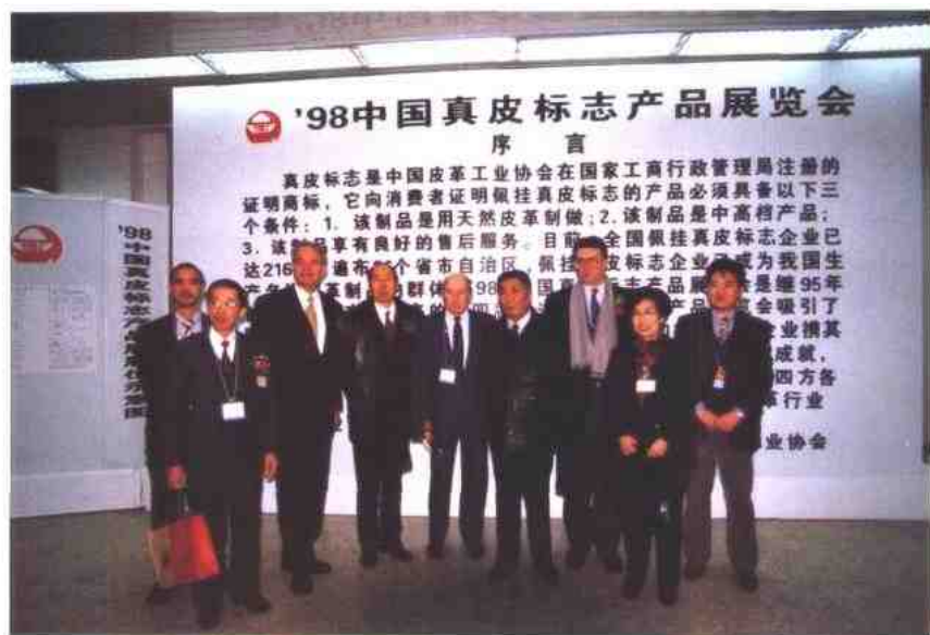
'98中国真皮标志产品展览会 1998年11月23日 北京

'98 Genuine Leather Mark Products Exhibition Held on Nov 23, 1998 Beijing