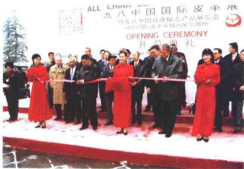
1998年中国国际皮革展开幕典礼 1998年11月23日 北京 The Opening Ceremony to '98 All China Leather Exhibition on Nov.23, 1998 Beijing