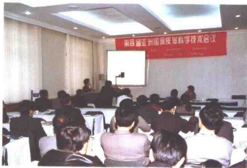
第四届亚洲国际皮革科学技术会议 1998 年 11 月 20 日 北京

The 4th session of the third board meeting of China Leather Industry Association Held on Nov. 20, 1998 Beijing