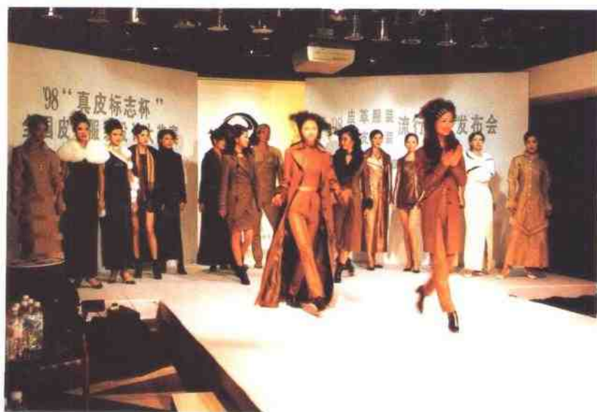
'98“真皮标志杯”全国皮革服装设计大奖赛 1998年10月7日 浙江海宁

'98 Genuine Leather Mark Products Exhibition Held on Nov 23, 1998 Beijing