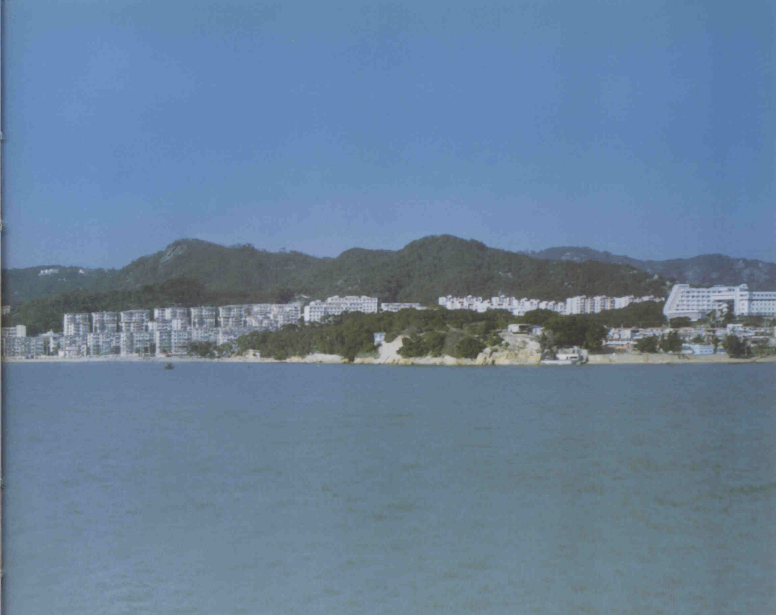
■ A Bird's-Eye View of Xiamen University

academicians of the Chinese Academy of Sciences, 9 members seated on the State Council Academic Degree Appraisal Committee, and 132 Ph.D supervisors. The university has distinguished professorships listed in the Ministry of Education "Yangtze Scholar Award Program" available in 7 specific subjects, such as Chemistry, and Fujian province "Minjiang Scholar Award Program" available in 4 specific subjects, such as accounting.