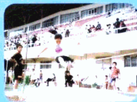
一年一度的校运动会 The school sports meet held once a year