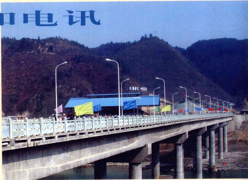
白市大桥 Baishi Bridge

通信、电视实现了传输光纤化、交换数字化、计费微机化，电话实现了村村通，电视覆盖率达 90%。