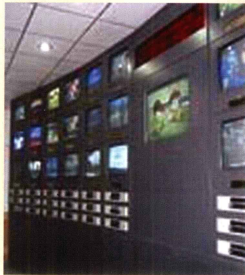
电讯设施 Telecommunication Facilities

The fiber-optical transmission, digital exchange and computerized charging are used in telecommunication and TV services. Telephone services are available in all villages, and the TV coverage rate is 90%.