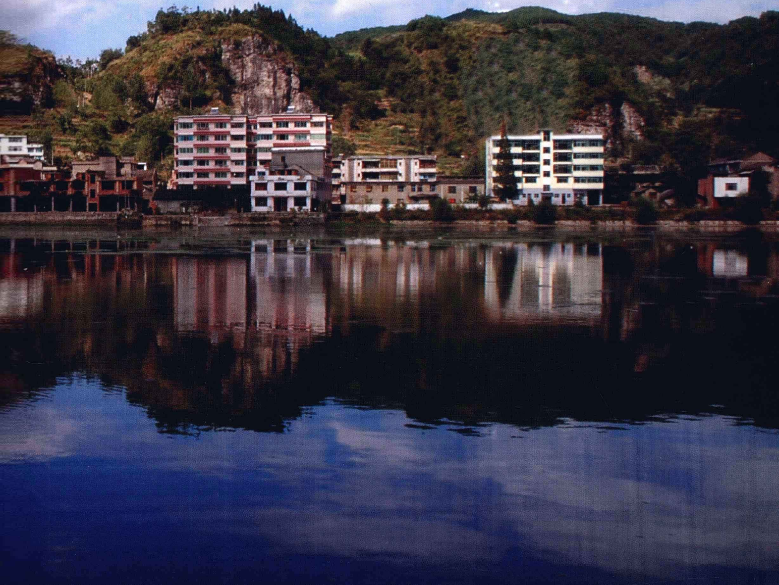
鉴江河风光 Scene of the Jianjiang River

天柱县属喀斯特地貌，溶洞星罗棋布，山石奇丽，生态环境幽雅，名胜古迹神奇，主要有三星岩、金凤山古庙、石柱擎天等八大景观。名岩名洞，奇山奇石，风景独特。素有“草经冬日而不萎，花非春来也常开”的秀丽风光。