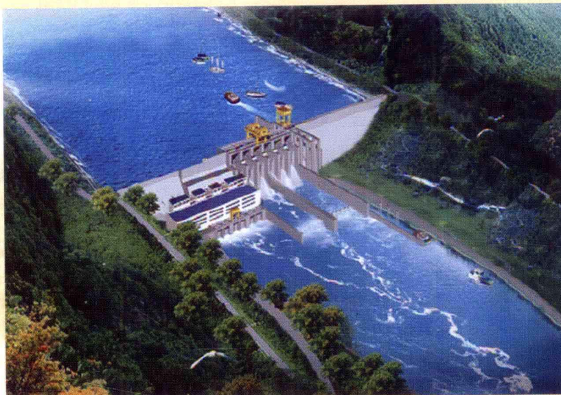
白市水电站 Baishi Hydropower Station