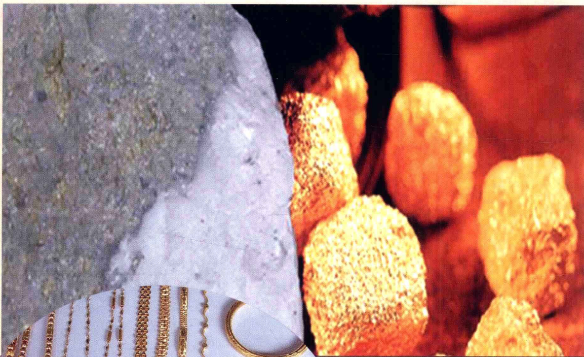
天柱黄金矿 Tianzhu gold ores

天柱已探明的矿产有重晶石、黄金、煤、钾等十多种，其中重晶石储藏量达1.08亿吨，占全国探明总储量60%以上，享有“中国重晶石之乡”的美称。煤炭总储量1696万吨，黄金探明储量62吨。