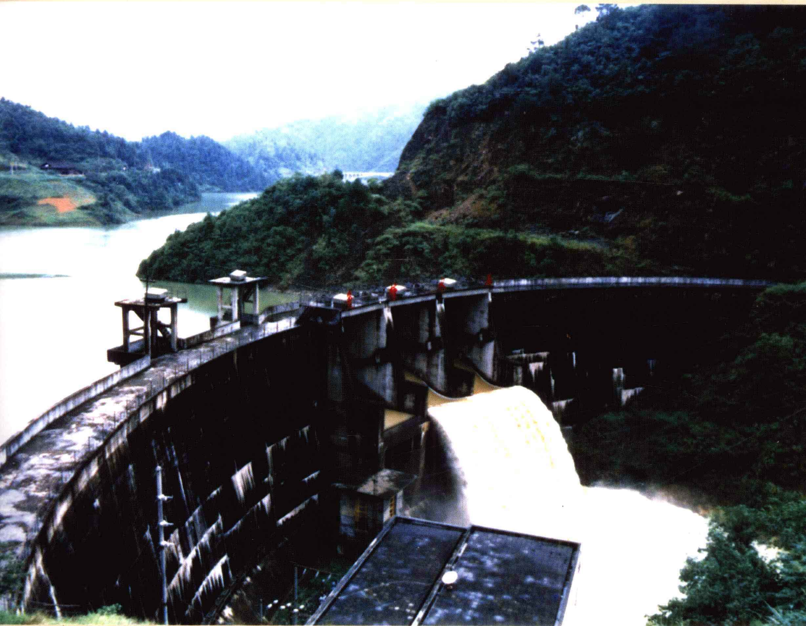
贵州省最大的农田水利灌溉工程—鱼塘水库大坝 The largest farmland irrigation project in Guizhou Province Yutang Reservoir Dam

县内电力充裕，完成地方和国家电网联并。大小河流遍布全县各地，水能资源丰富，可开发量达80万千瓦。投资32.7亿元装机42万千瓦的清水江段白市水电站正在建设中。