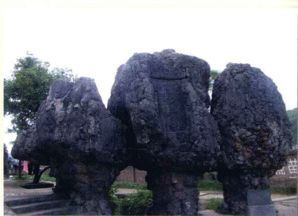
三星岩 Three-Star Rock