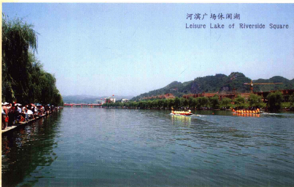
河滨广场休闲湖 Leisure Lake of Riverside Square

天柱以县城建设作为突破口,实施城镇开发带动战略,投入1.5亿元,兴建了专业市场、商业区、休闲广场、人工湖等,将城镇面积扩大为4.8平方公里,城镇化水平提高到23%。