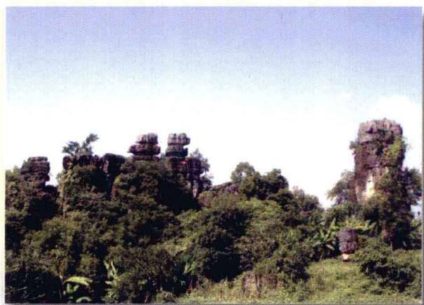
石柱擎天 Propping up the heaven by the stalagnate