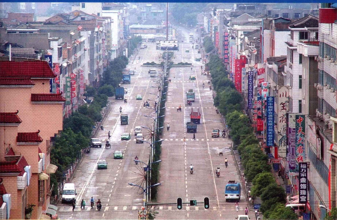
金山大道 Jinshan Road