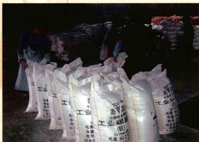
重晶石系列产品 Heavy spar serial products