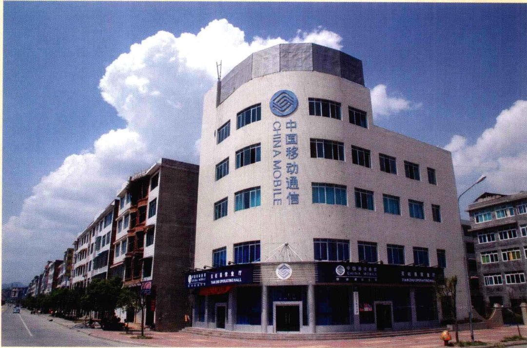
移动通信大楼 Mobile Telecommunication Building