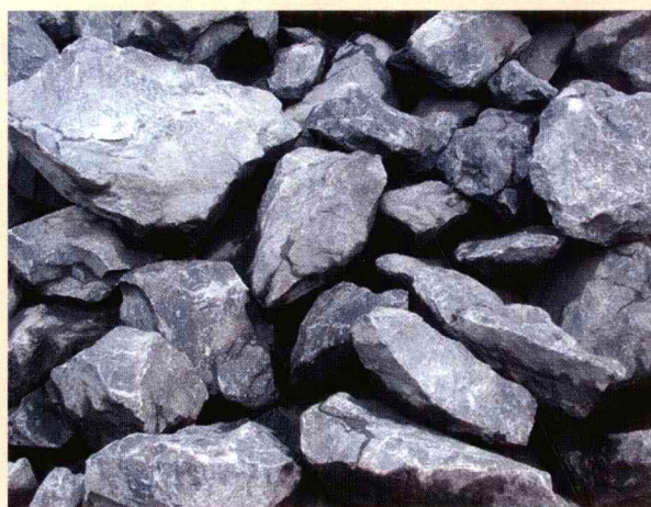
重晶石原矿 Heavy spar raw ores