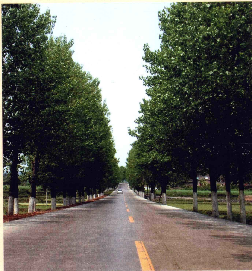
天柱至芷江公路 Tianzhu-Zhijiang Highway