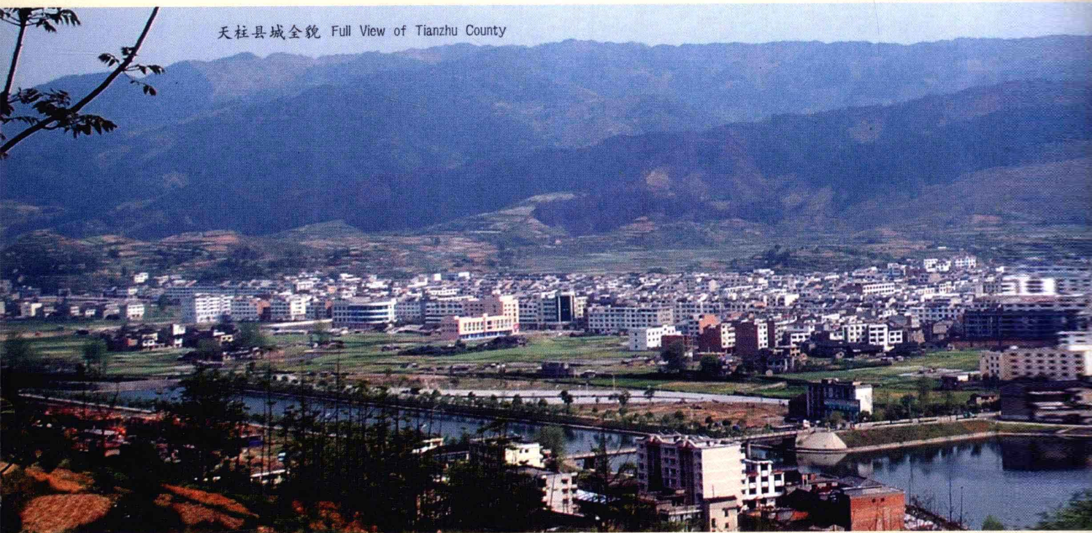
天柱县城全貌 Full View of Tianzhu County

Tianzhu County is located in the east of Guizhou Province and is adjacent to Dong Autonomous County of Xinhuang, Miao-Dong Autonomous County of Jingzhou and other counties of Hunan Province and to Jianhe County, Jinping County, Sansui County and other counties of Guizhou Province. It is an important gateway from Sichuan Province, Chongqing Municipality and Guizhou Province to Guangdong Province, Guangxi Zhuang Autonomous Region, Jiangsu Province and Zhejiang Province. It is always known as the No. 1 pass in the eastern part of Guizhou Province, the Home of Heavy Spar in China and the Town of Gold on Guizhou Plateau.