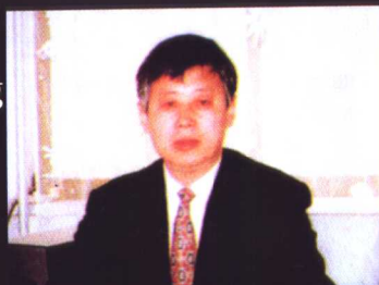
VICE CHAIRMAN OF CHINA FOOTBALL ASSOCIATION, DEPUTY-DIRECTOR OF THE FOOTBALL MANGMENT CENTER OF THE NATIONAL BUREAU OF SPORTS, DIRECTOR OF QING HUANG DAO BASIS OF THE NATIONAL BUREALL OF SPORTS, HEADMASTER OF CHINA FOOTBALL SCHOOL.