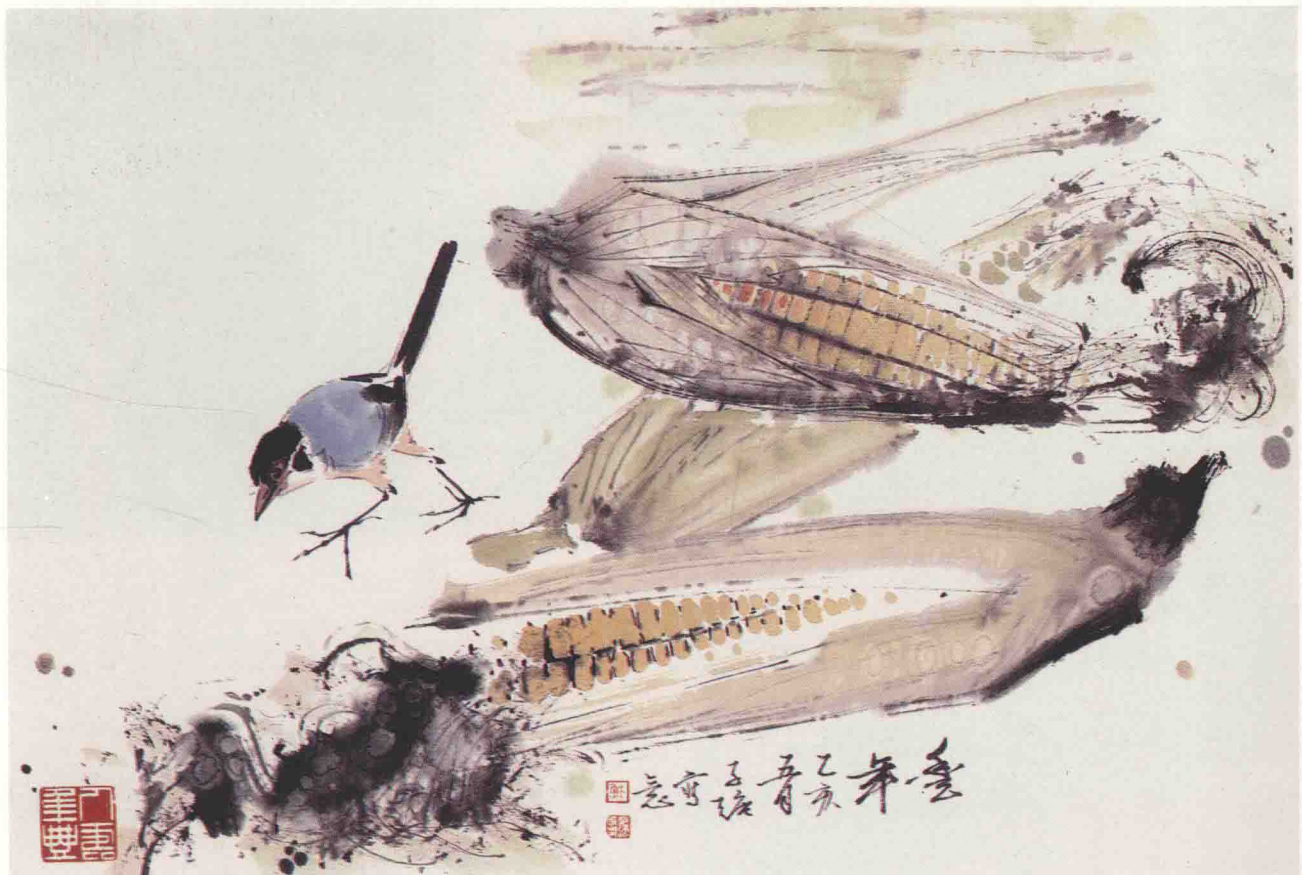
丰年 50 × 34cm