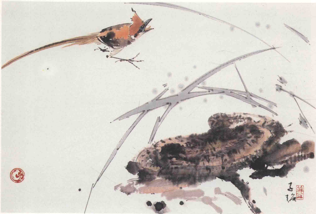
福寿又康宁 50 × 34cm