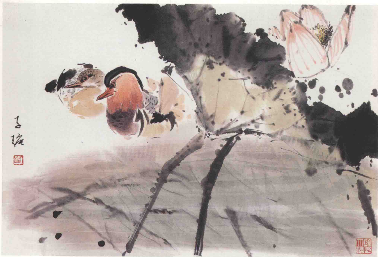
和鸣多好音 50 × 34cm