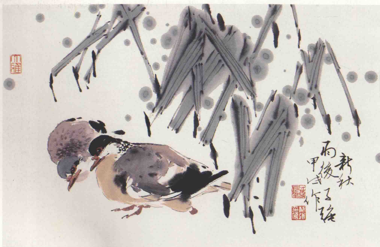
新秋初雨后 50 × 34cm