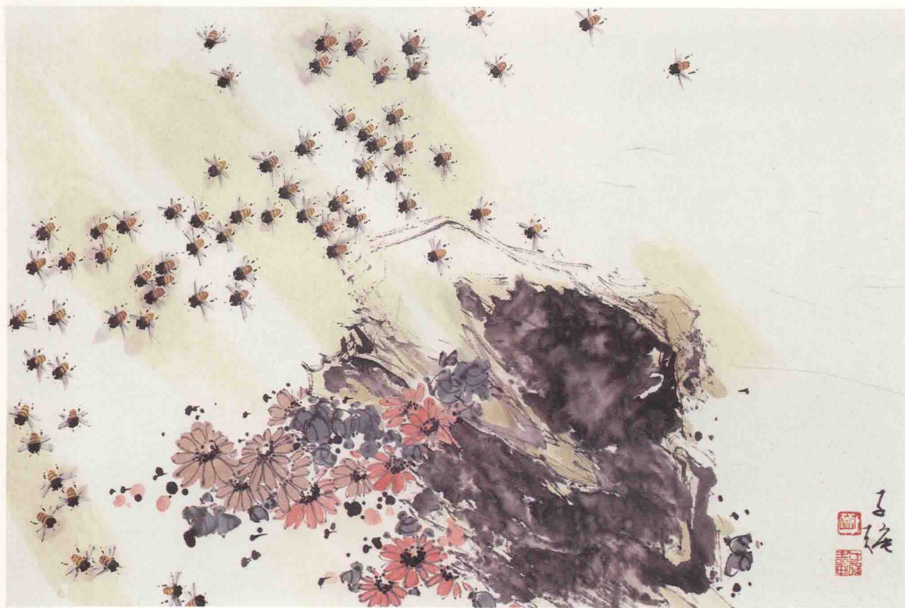
采花勤酿蜜 50 × 34cm