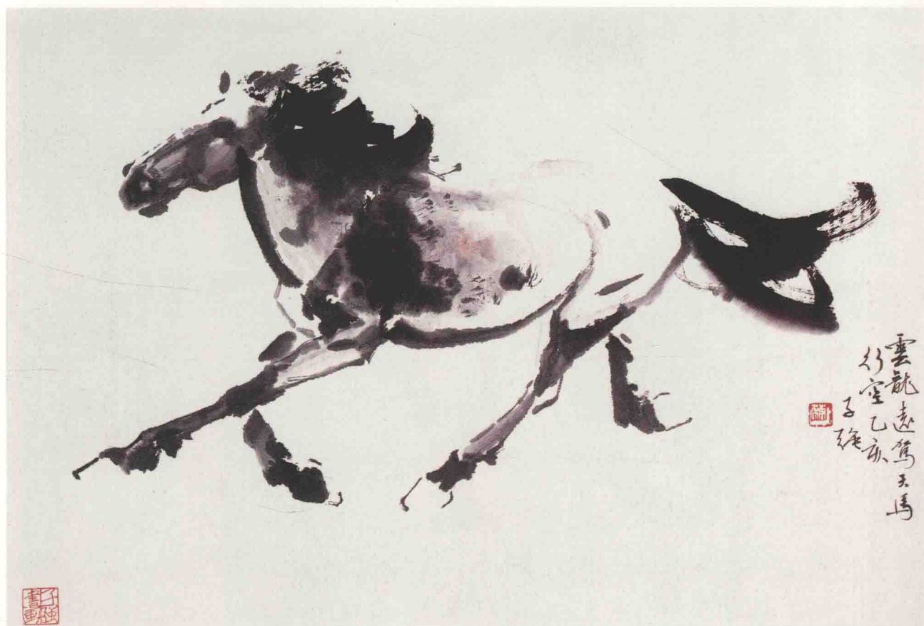
天马自行空 50 × 34cm