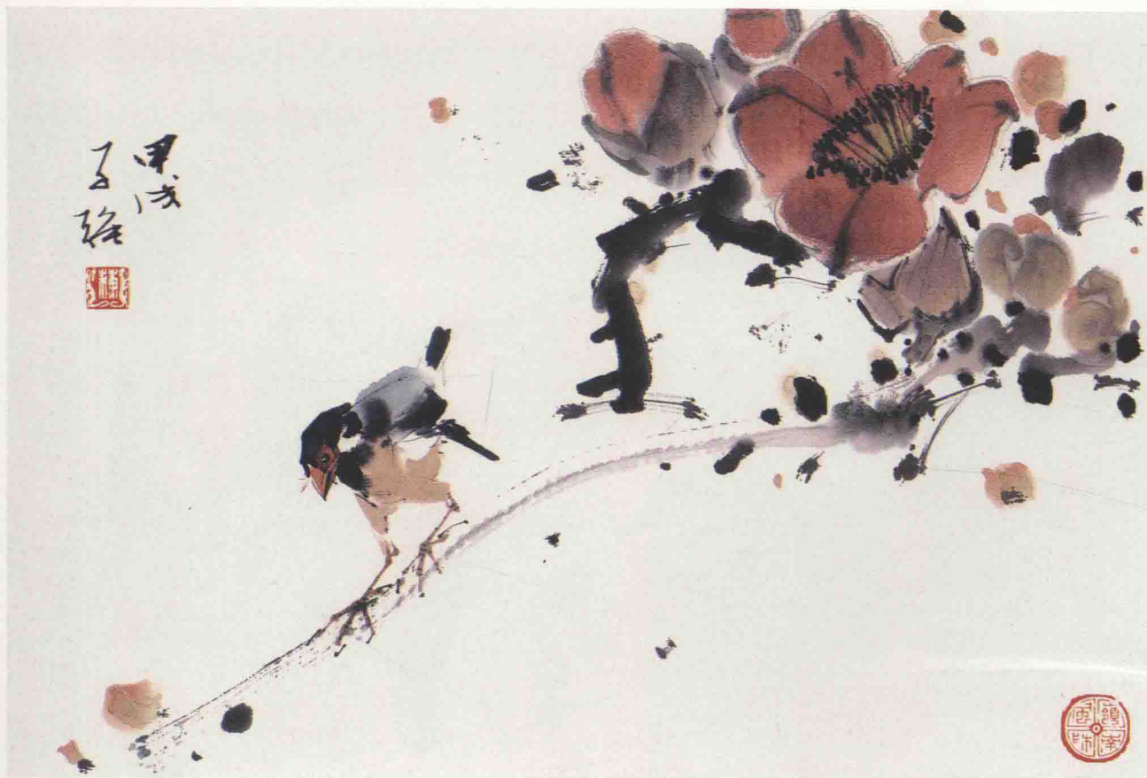
风暖木棉红 50 × 34cm