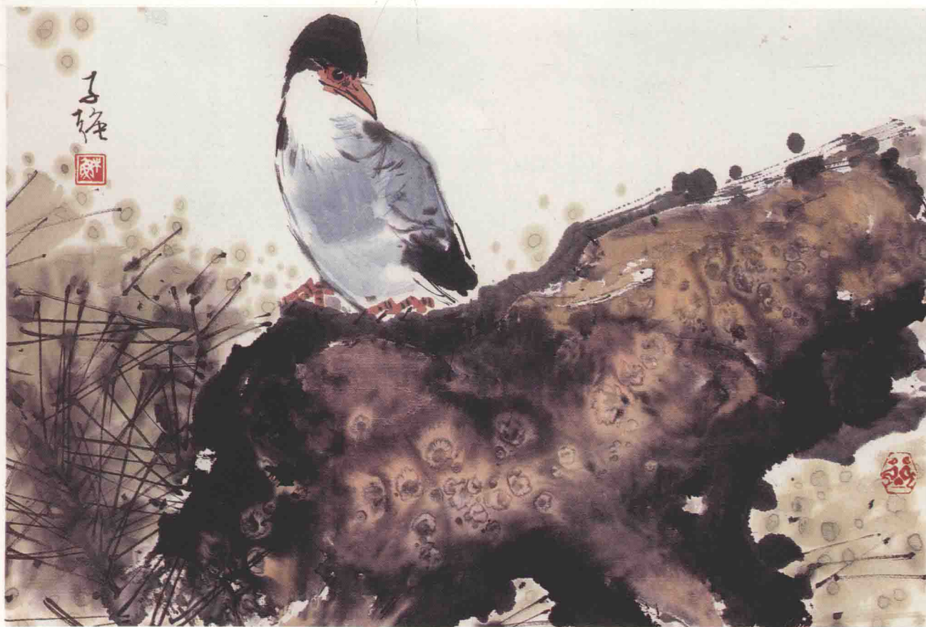
树古招名禽 50 × 34cm