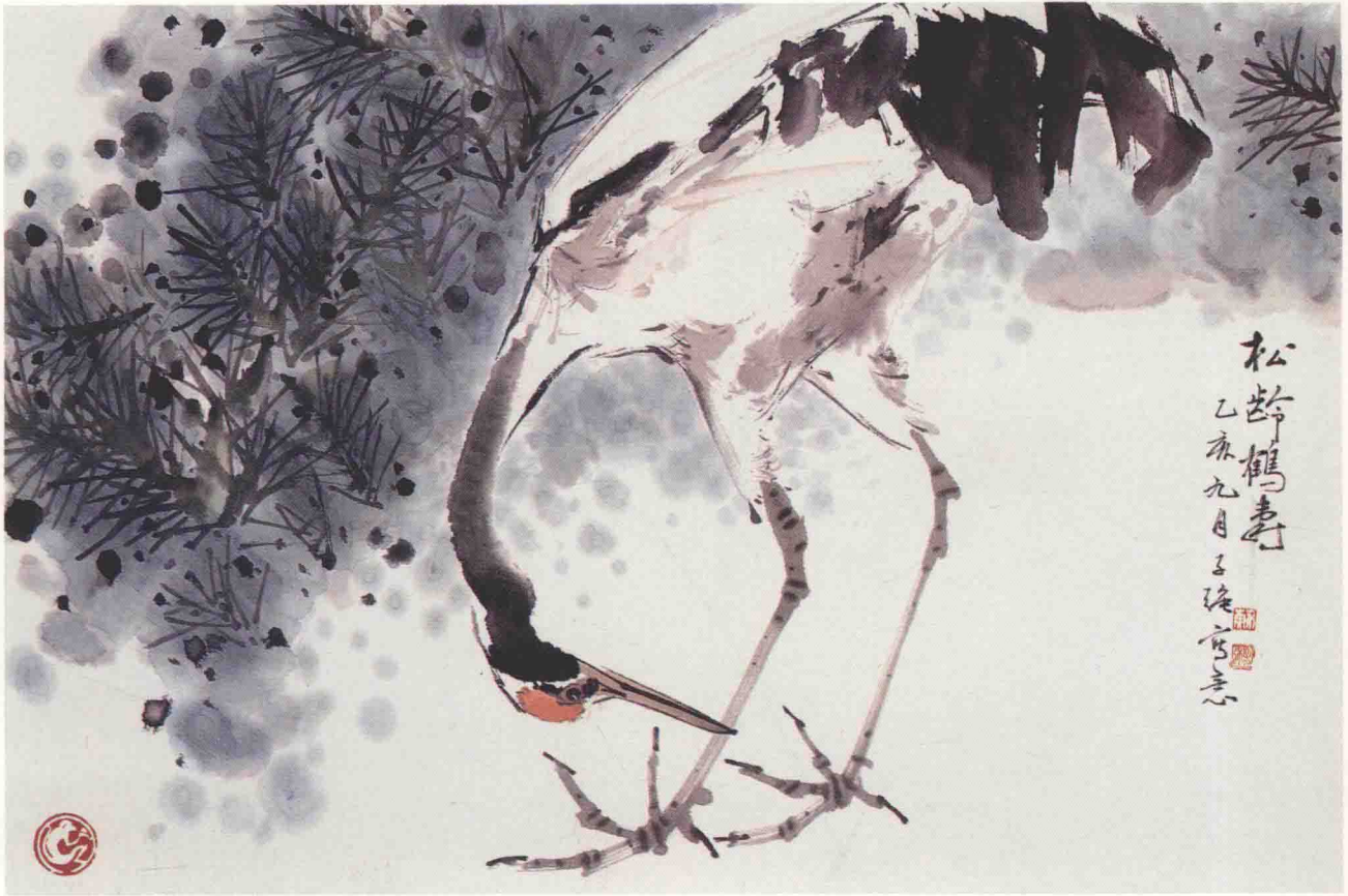
鹤寿满千年 50 × 34cm