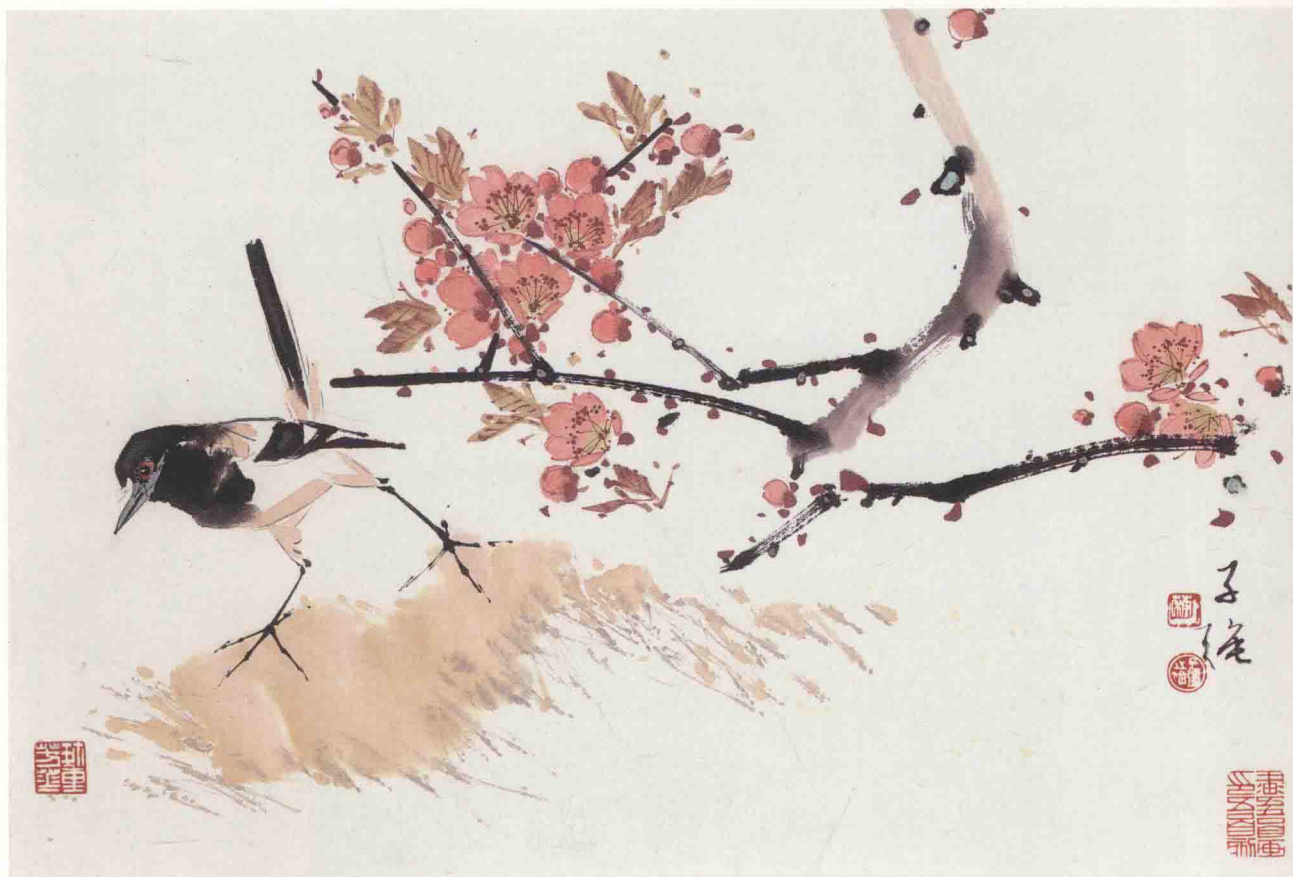
春色满乾坤 50 × 34cm