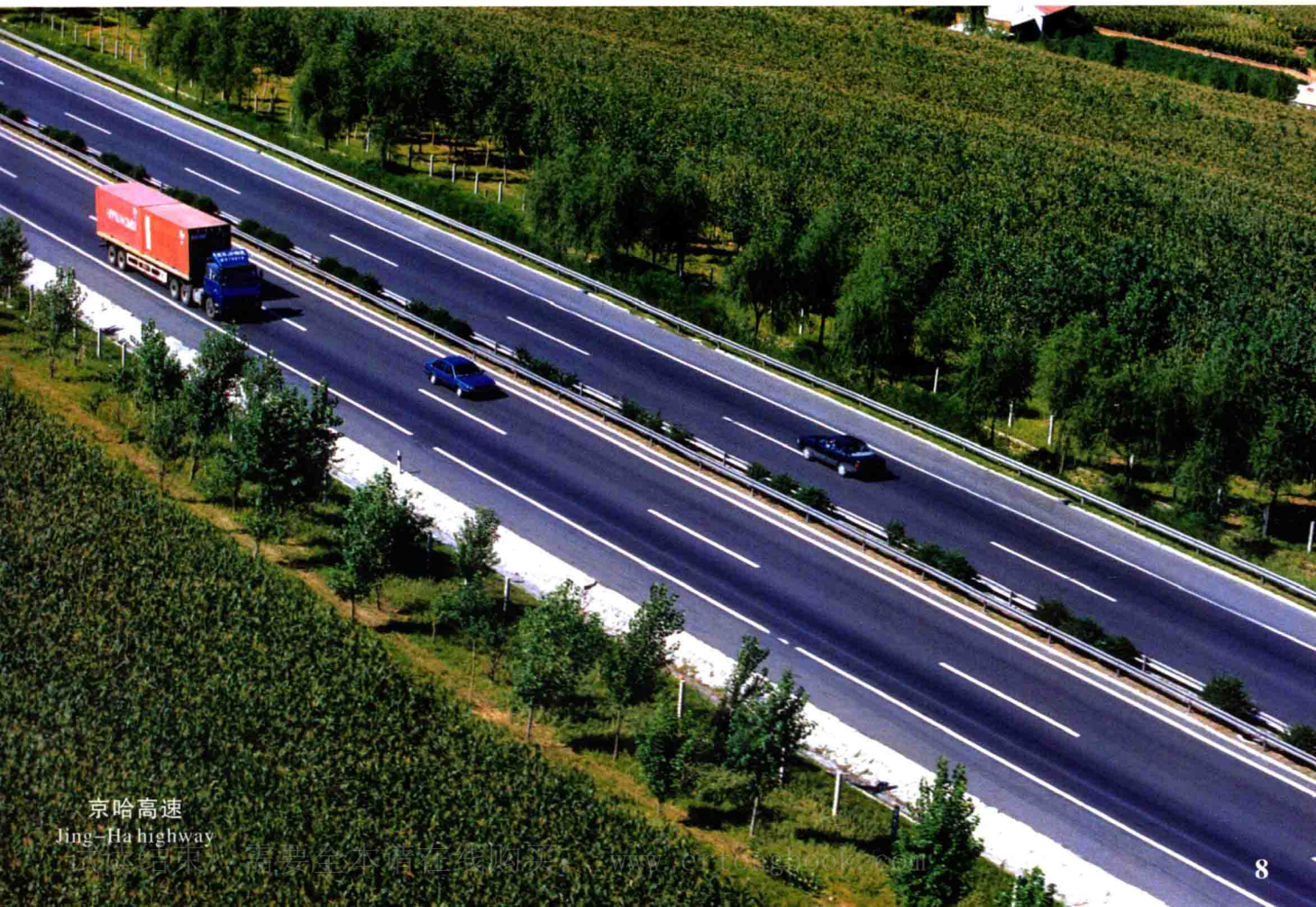
京哈高速 Jing-Ha highway

The advantage of the geographical position of City Siping is remarkable. It situates at the crossing of three provinces, Liaoning, Jilin and Inner Mongolia. For its special position, it may well be termed the South Gate of Jilin Province, the Northeast important hub of communications. Harbin--Dalian, Siping--Meihekou, Ping--Ji railways converge here. Beijing-Harbin and Changchun--Yingkou highway and Beijing-Harbin, JiXi, Shen--Ming and Siping--Hunchun four national roads run through the city.