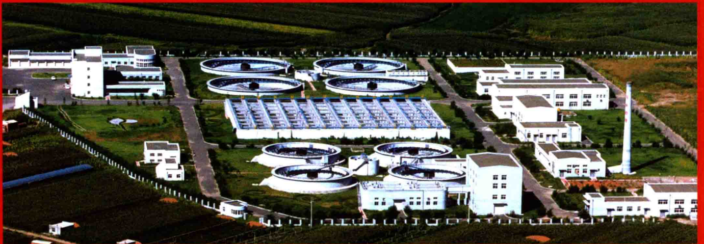
污水处理厂 Sewage Works

Completing infrastructure, high-quality service function. The infrastructure taking traffic, communication, energy, water supply, heating, sewage disposal, etc. as focal point of Siping is perfecting day by day, the cultural undertakings such as broadcast, TV, wired (figure) TV, etc. are growing vigorously. The producing ability of the power plant of Siping reaches 1,400,000 kilowatts, and every day's water supply ability in the urban area is up to 200,000 cubic meters, and purifies 90,000 tons of sewages by day, and its heating ability is 7 million square meters. Programme-controlled digital network covers the whole area, and communication undertaking is developing rapidly. The direct dialing service is also offered with more than 160 countries and districts at present, with which have offered the good hardware environment for the development of Siping.