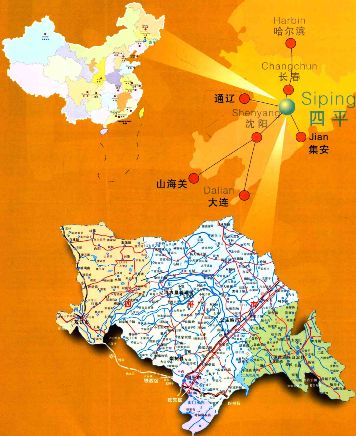
Map of SiPing City in Jilin Province