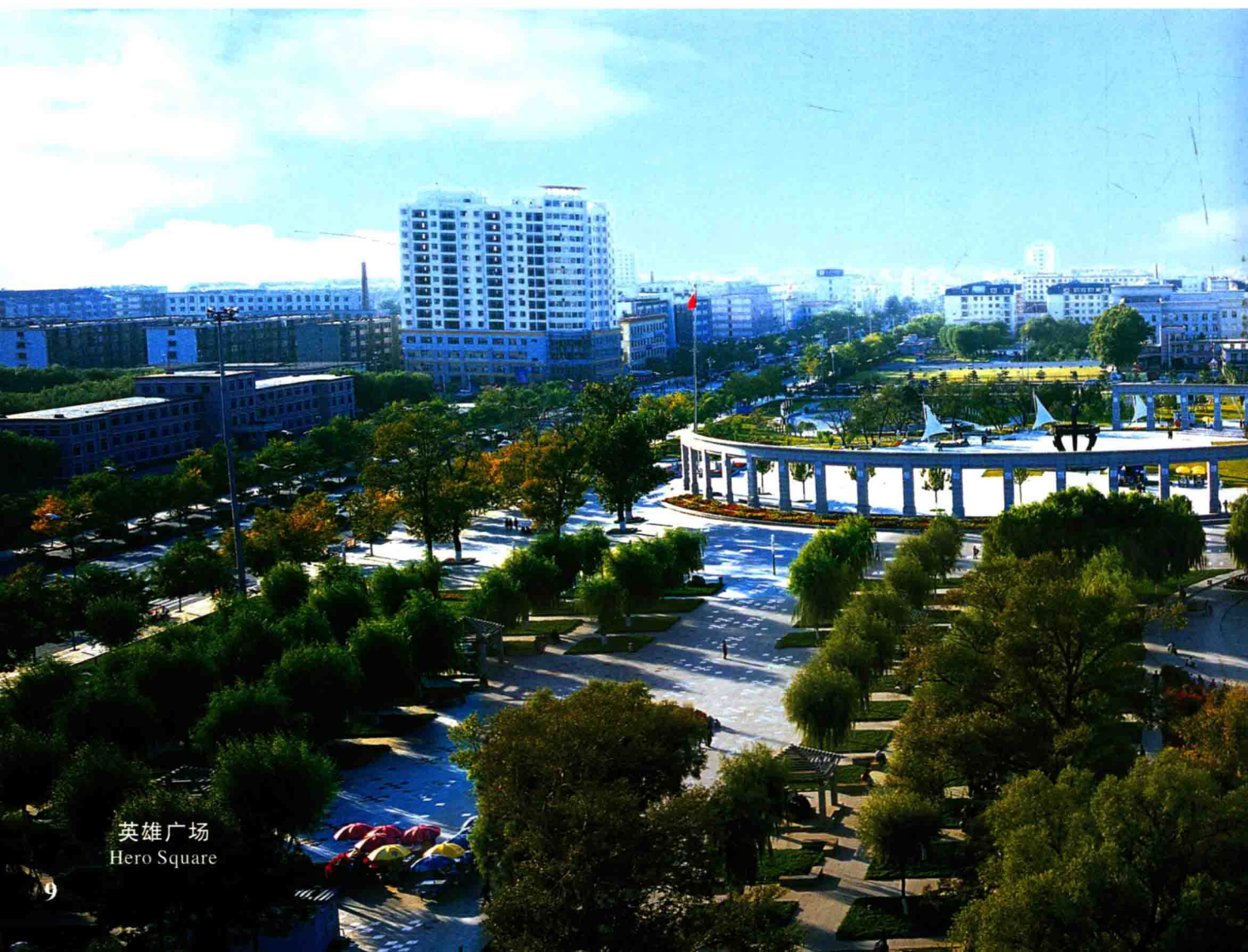
英雄广场 Hero Square

四平的历史悠久，远在殷、周时代就有人类在这里生活繁衍。经过历史的变迁和战争的洗礼，特别是改革开放的建设，使四平成为充满现代化气息、美丽、整洁、适合于人类居住的新型工业城市。