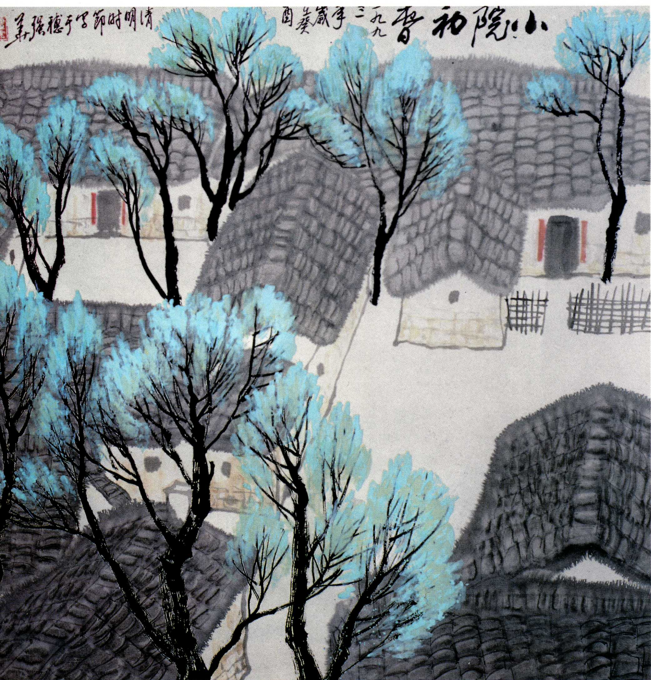
小院初春 Early Spring in a Small Courtyard