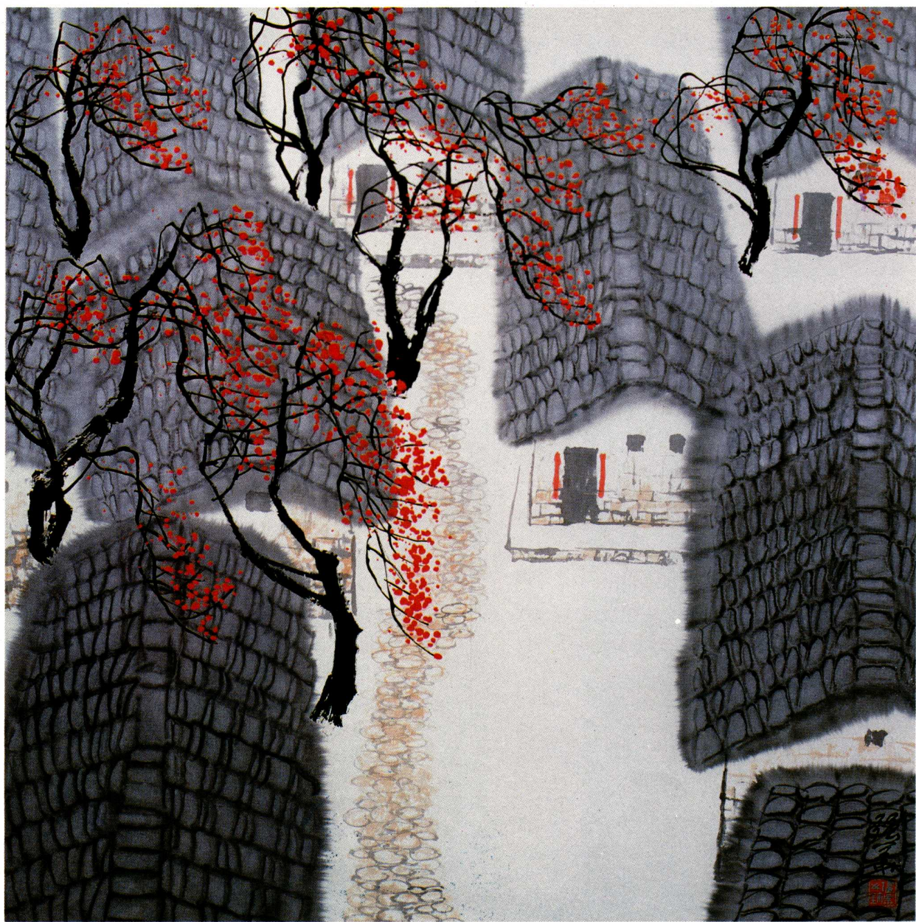
片片紅葉掩村居 Red Autumnal Leaves