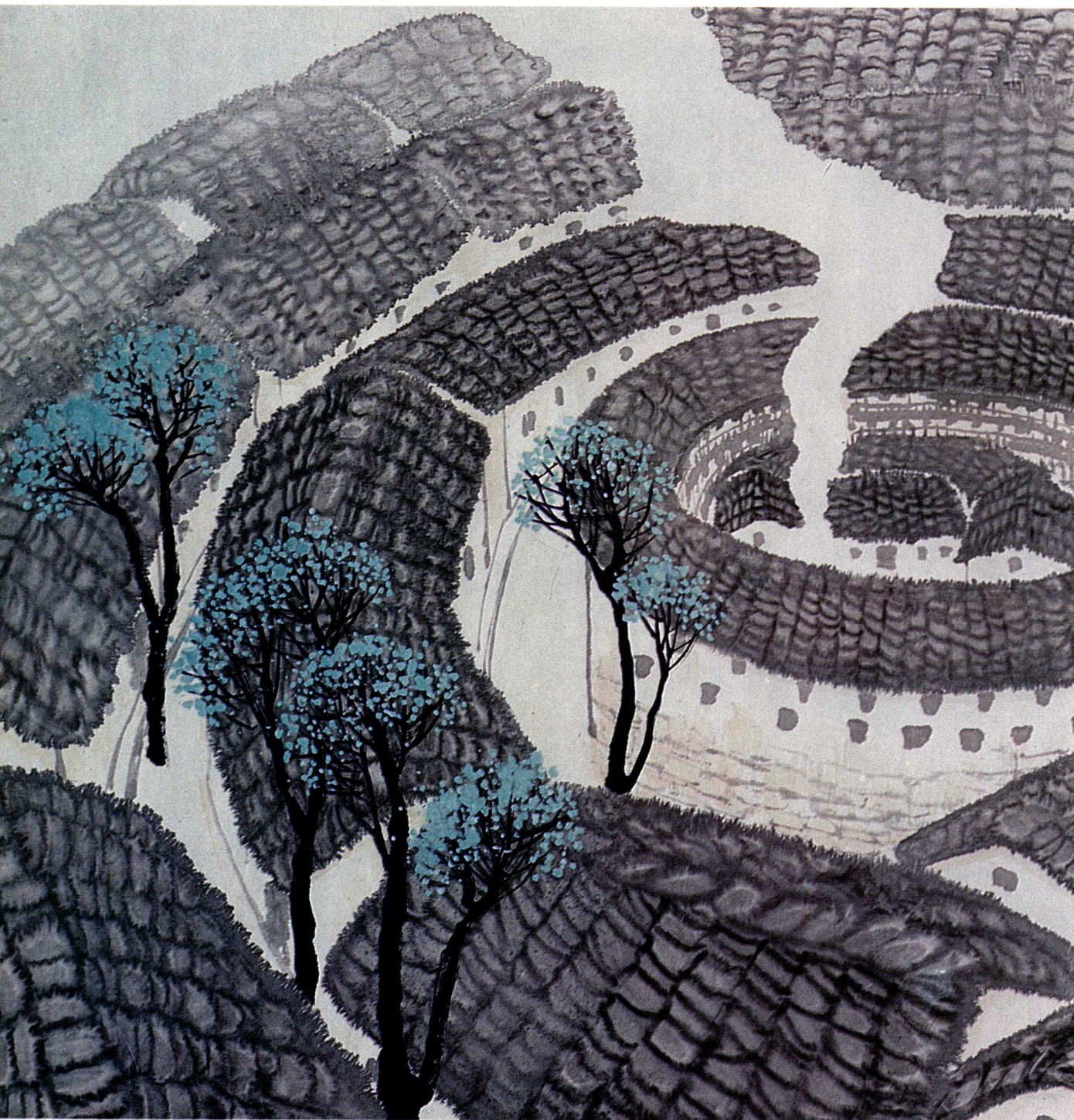
炊烟繚繞客家村 A Village of the Hakkas