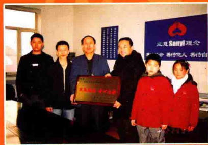
吉林三意环保锅炉有限公司多年来一直支持孤儿教育事业。 Jilin San Yi Environmental Protection Co.Ltd has been sponsor-ing the orphan education for years.