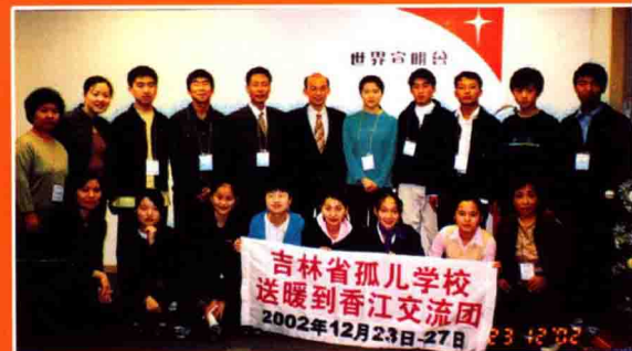
世界宣明会带孤儿孩子赴香港交流 World vision international brought orphans to Hongkong for exchanges .