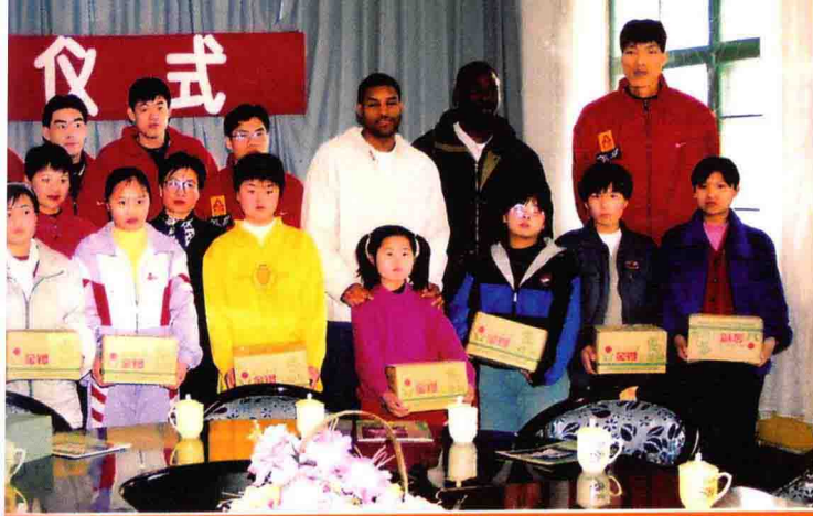
吉林东北虎俱乐部的领导、球员经常来吉林省孤儿学校看望孤儿 Leaders and basketballers of Northeast Tiger Club often visited the orphans.