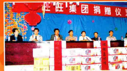
旺旺集团向吉林省孤儿学校捐赠食品。 Wangwang Group donated food to the Orphan School.