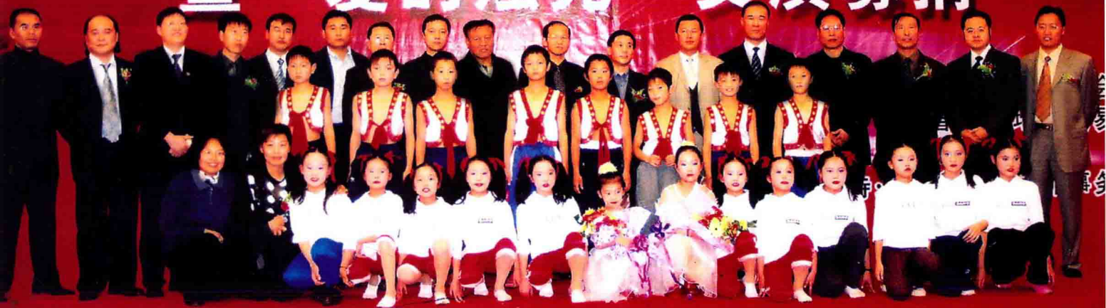
Orphan Group give people benefit performance and make a donations