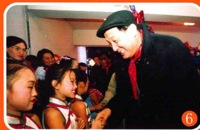
(图1) 1989年9月28日, 时任国家民政部副部长, 现任中共中央政治局委员张德江(左三)来吉林省孤儿学校视察。 On 9.28,1989, the now VIP of Political Bureau of the Central Committee of the Communist Party of China, then Vice Minister of the Civil Affairs Department, Zhang Dejiang(left3) visited our school. (图2) 2003年7月4日, 全国人大常委会副委员长顾秀莲(中)来吉林省孤儿学校视察。 The leader of the standing committee of the National people congresses Gu Xiulian (middle) visited the Orphan School of Jilin Province. (图3) 1995年, 时任国家计委副主任, 现任全国政协副主席郝建秀来吉林省孤儿学校视察。 In 1995, the now Vice Chairman of CPPCC, the then Vice Director of State Planning Commission of China, Hao Jianxiu visited our school. (图4) 2003年12月31日, 吉林省委书记王云坤(左一)来吉林省孤儿学校视察。 Wang YunKun,(left 1)Secretary of Jilin Provincial CPC Committee,visited the Orphan School on 31 Dec, 2003. (图5) 2005年1月31日, 吉林省省长王珉(右二)来吉林省孤儿学校视察。 Wang Min(Right 2),Governor of Jilin Provincial Government,visited the Orphan School of Jilin Province. (图6) 2002年春节, 时任吉林省省长洪虎来吉林省孤儿学校视察。 Hong Hu,Governor of Jilin provincial Government ,visited the Orphan School of Jilin Province.