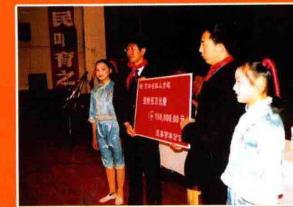
完美公司来吉林省孤儿学校慰问并向学校捐款。 Perfect Company visited and donated to School.