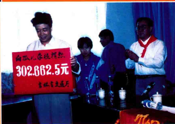
吉林省交通厅为吉林省孤儿学校捐款 The Department of traffic of Jilin Province delivered donations to the Orphan School .