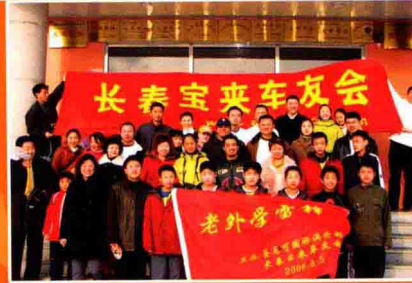
宝来车友会来吉林省孤儿学校慰问孤儿。 The Association of Bora Car Fans Club visited the orphans.