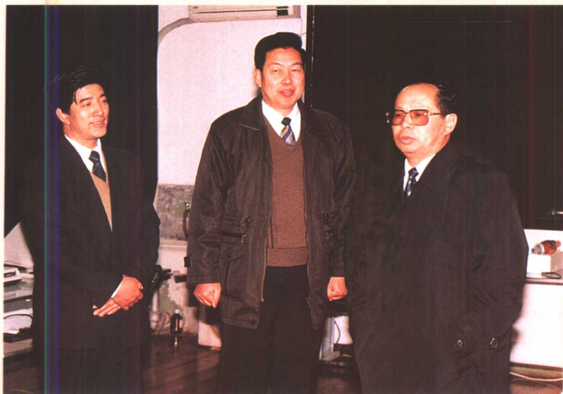
交通部长黄镇东(右一)视察学校 Huang Zhendong (first from right), Minister of Communications, inspecting SMU