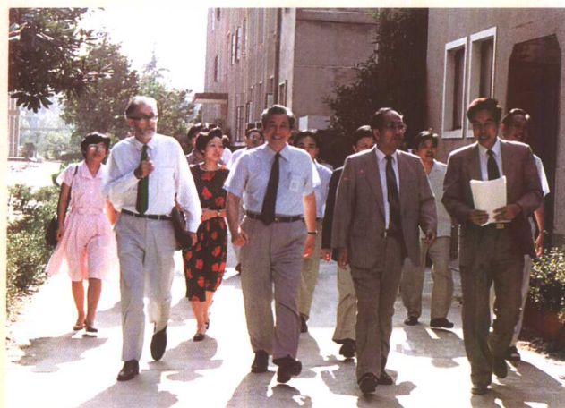
国务院新闻办公室主任、原上海市副市长赵启正(右二)视察学校 Zhao Qizheng (second from right), Director of the Information Office of the State Council & former Vice-Mayor of Shanghai, inspecting SMU