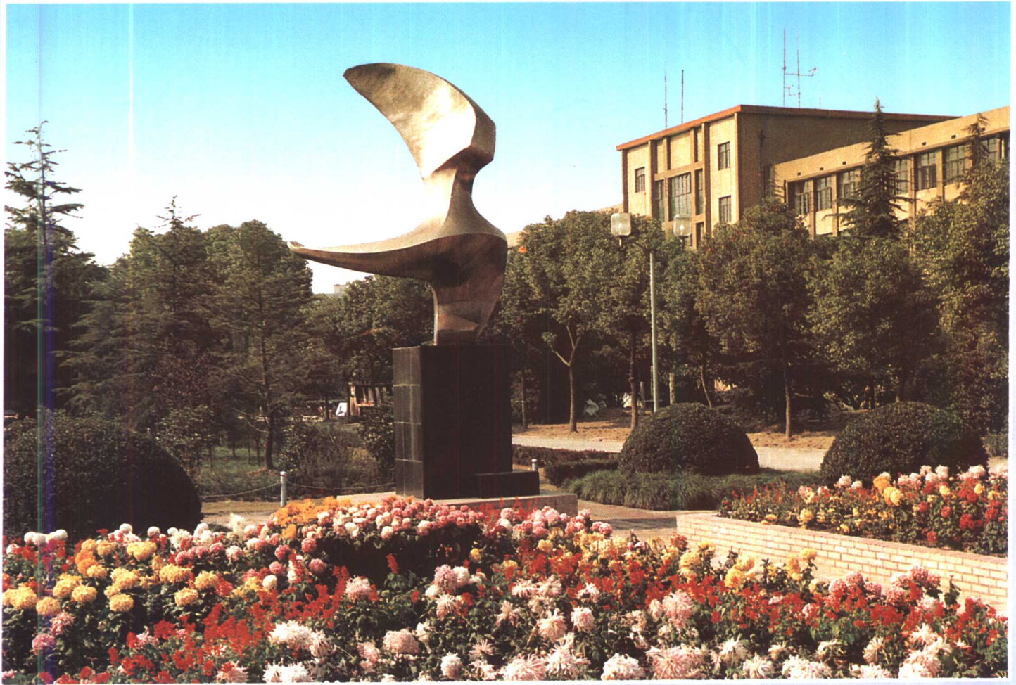
校 园 Campus