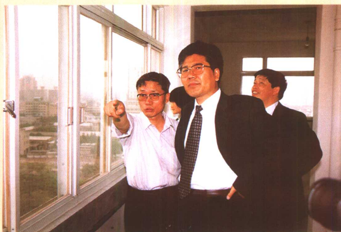
交通部副部长张春贤(右一)视察学校“安居工程” Zhang Chunxian (first from right), Vice-Minister of Communications, inspecting accommodations for both staff & workers of SMU