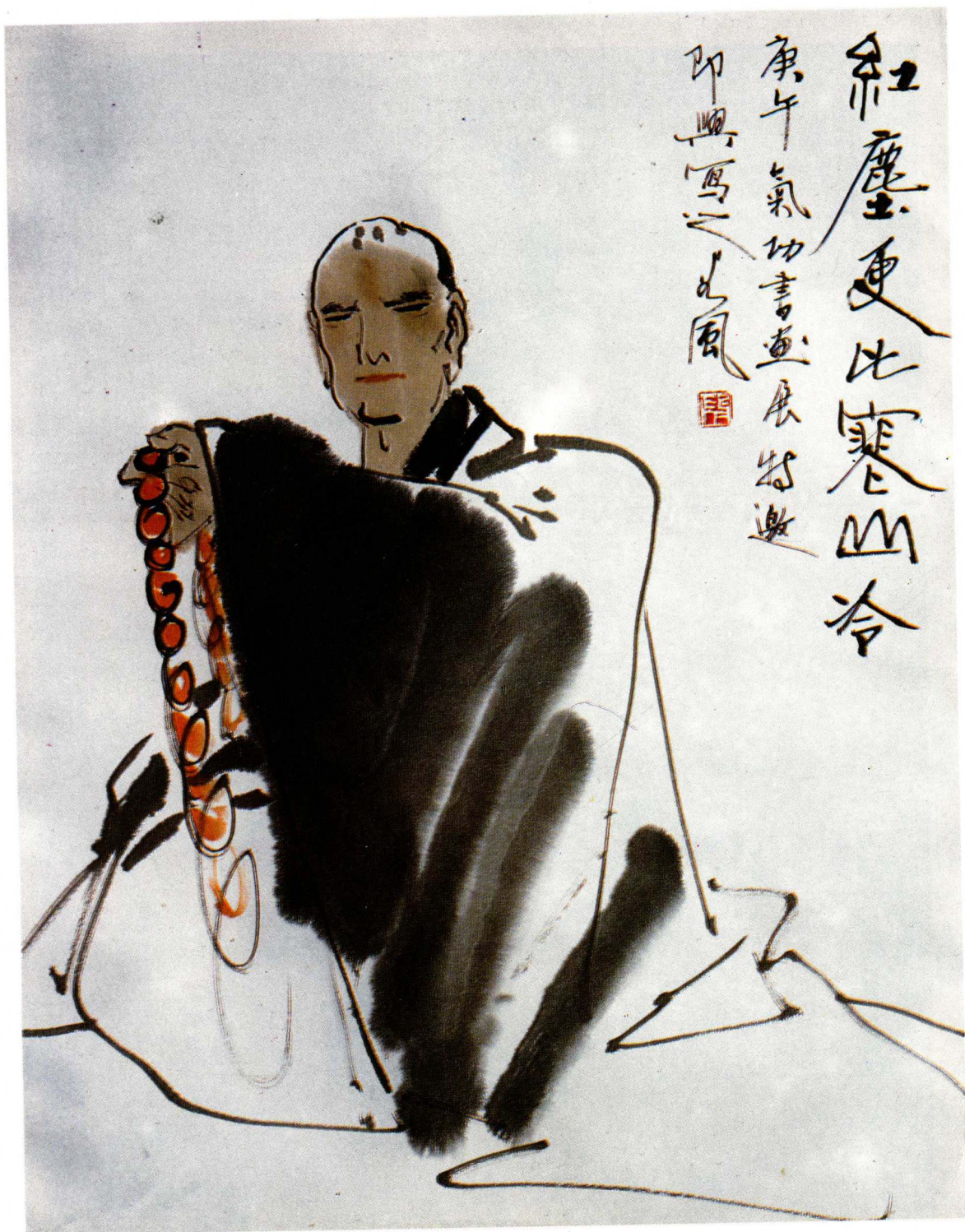
禪 坐 (66×52cm)