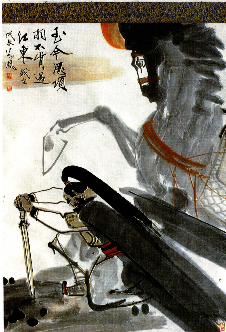
頂羽 (150×75cm) Xiang Yu