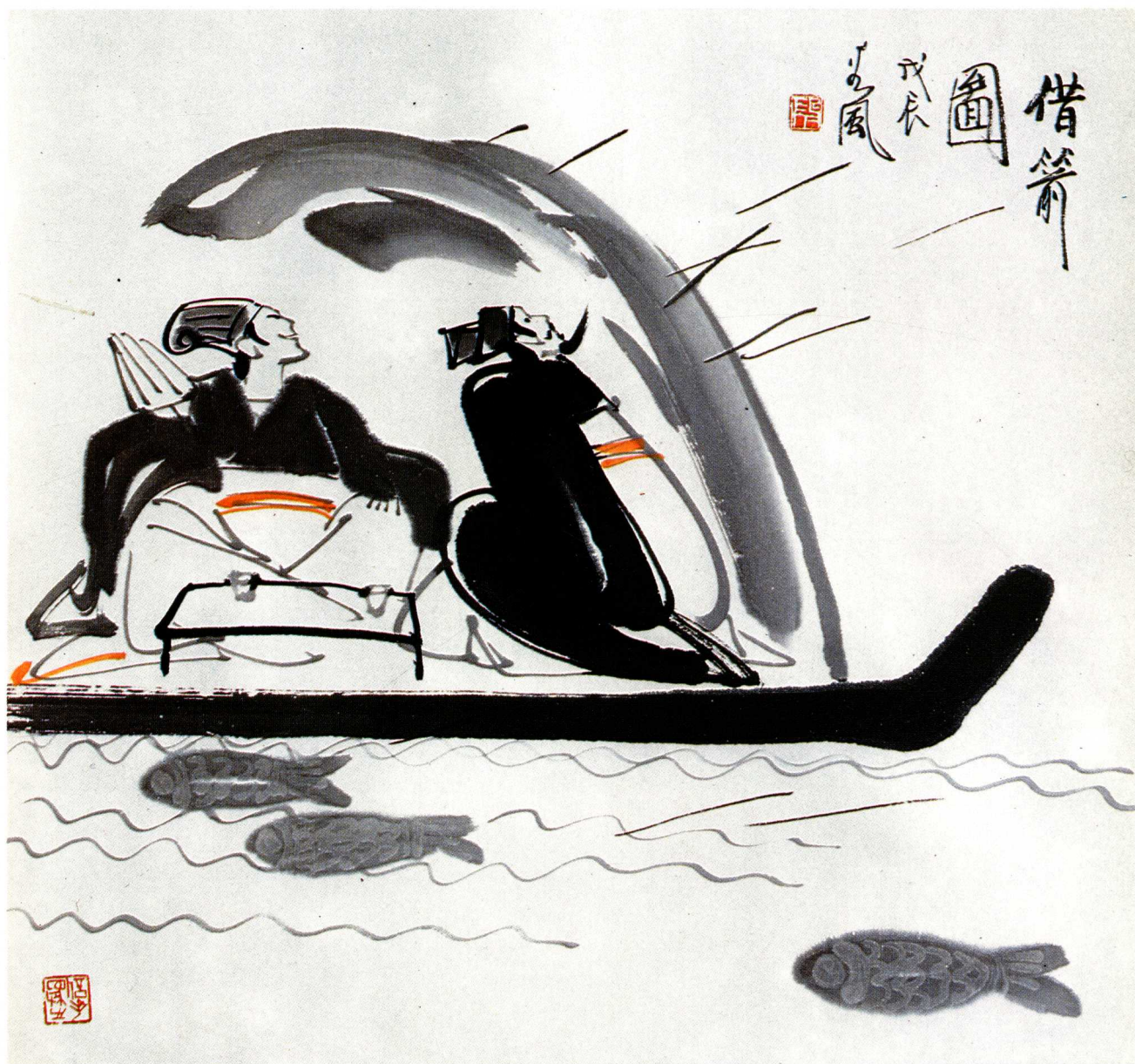
借箭圖 (60×55cm) Borrowing Arrows