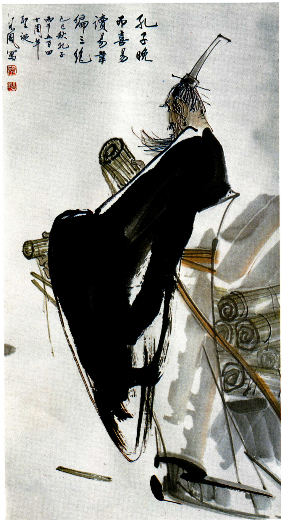
韋編三絕 (100×55cm) Intensive Reading