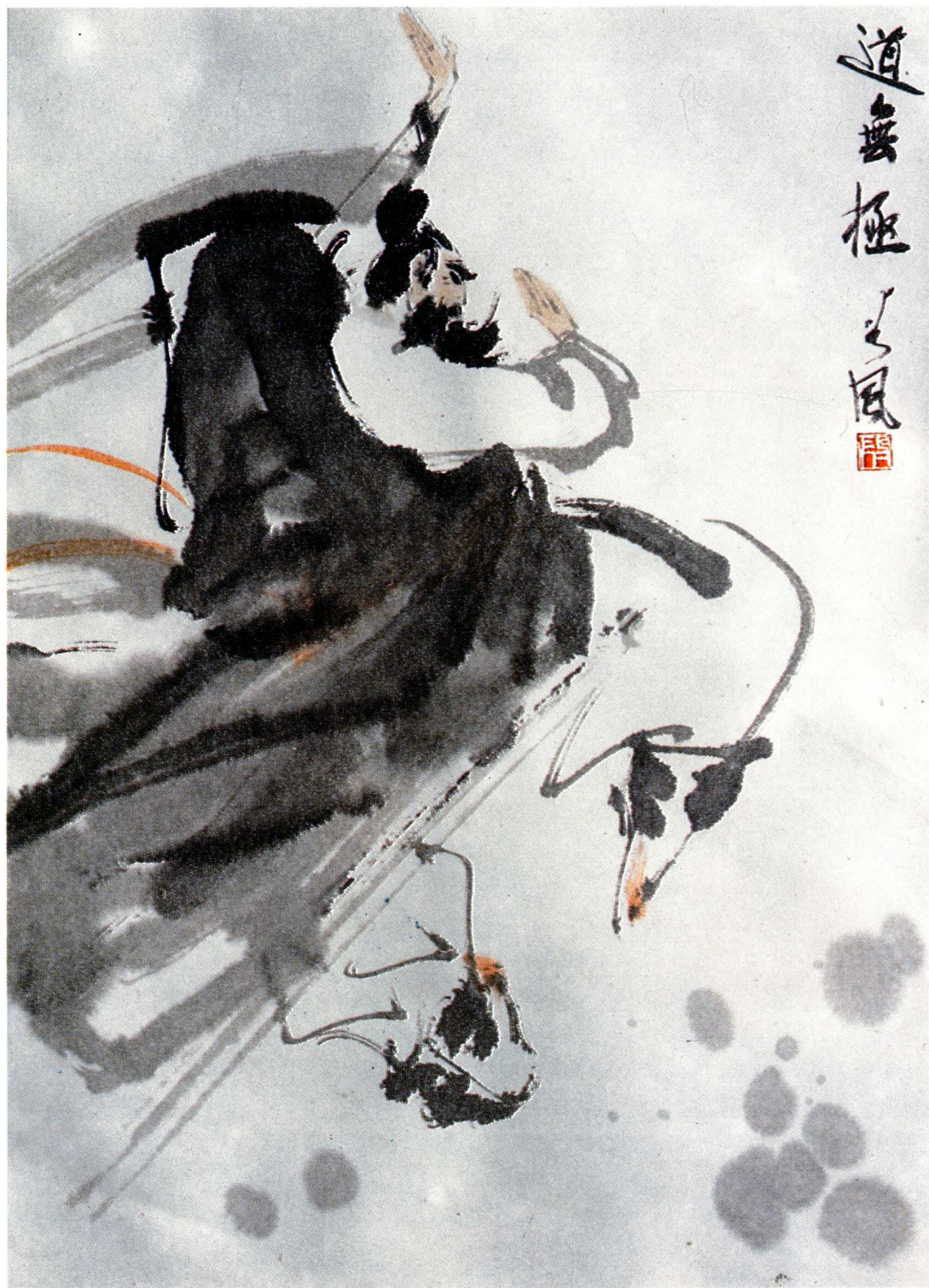
道無極 (70×46cm) Unlimitedness