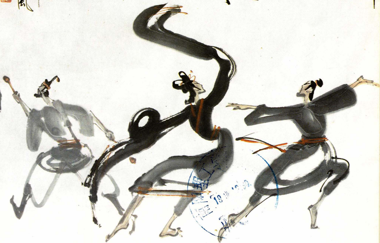
漢 舞 (100×68cm)