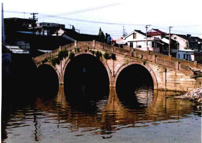
横河七星桥 Qi Xing Bridge