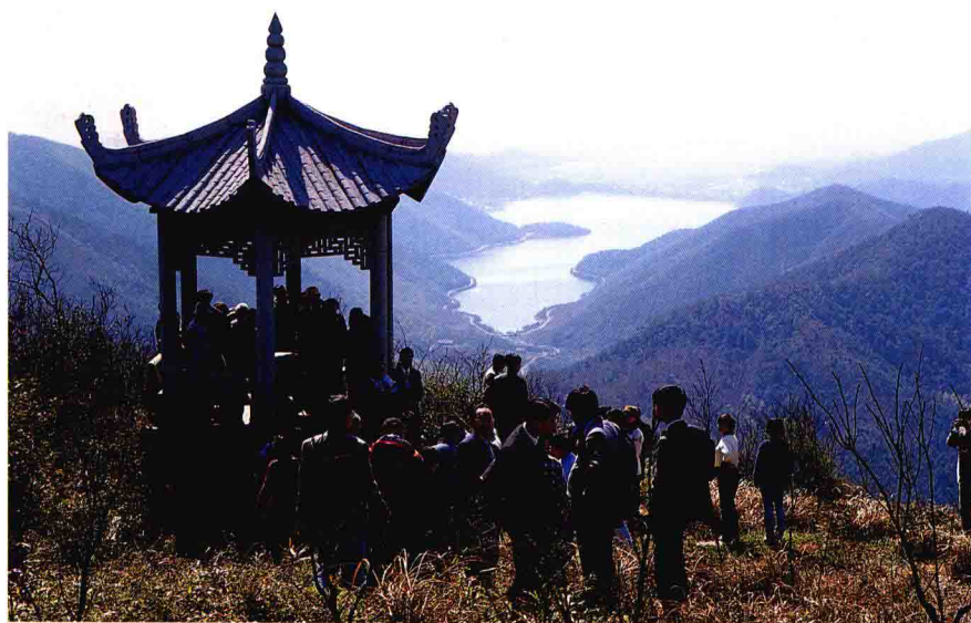
秦代徐福成功东渡启航地——达蓬山 Dapeng Mountain where Xu fu started his east voyage to Japan in the Qin Dynasty