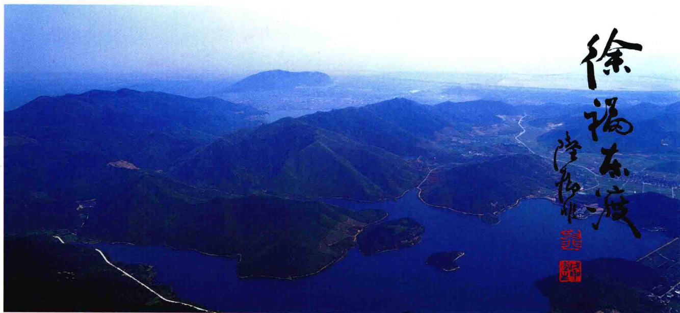
巍巍达蓬山 Great Dapeng Mountain