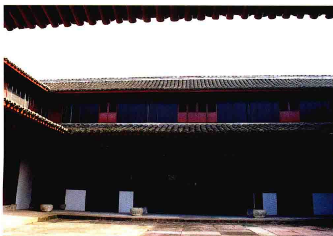
中共浙东区党委旧址 Former Residence of the CPC of East Zhejiang