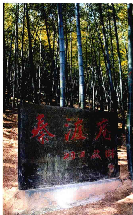
秦渡庵遗址 Qindu Temple Relics