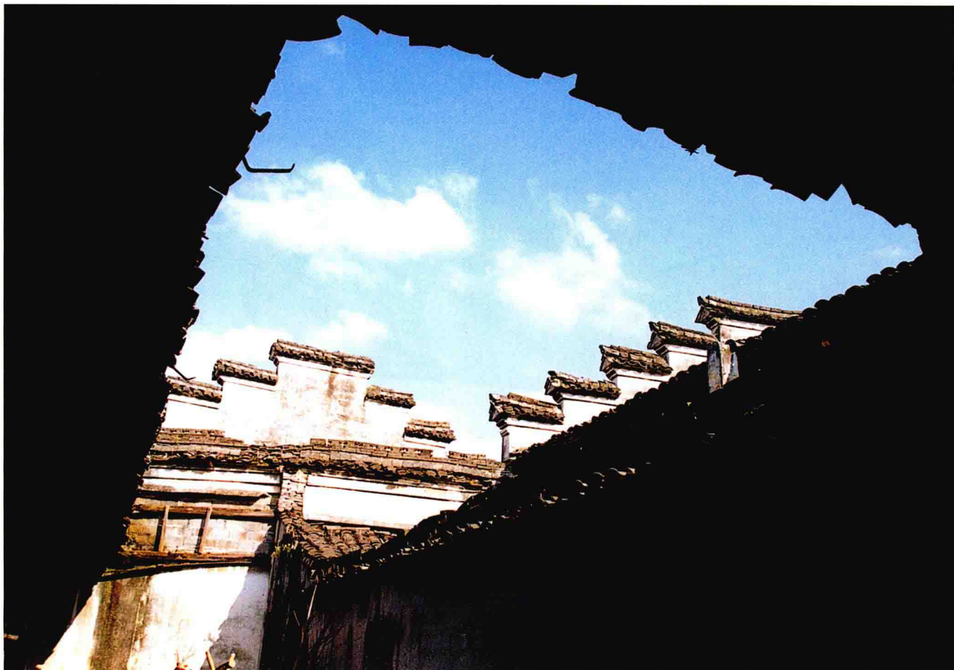
古镇鸣鹤 Minghe the ancient town