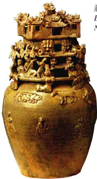
越窑青瓷堆塑罐（西晋） Exquisite celadonware of the Western Jin Dynasty