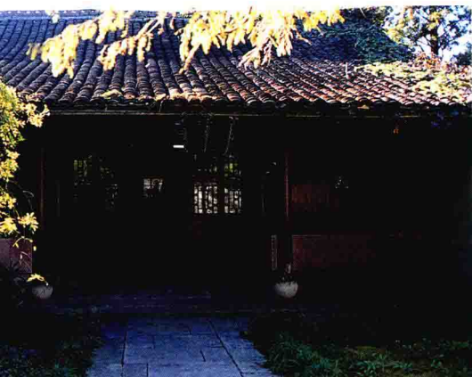
艺术大师陈之佛故居 Former residence of great master, Mr. Chen Zhifu.