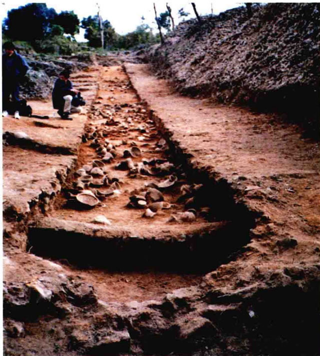
’98 全国十大考古新发现之一——寺龙口窑址 Si Long Kou kiln kelics—one of the 10 grand archaeological discoveries in China in 1998