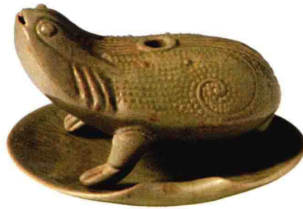
越窑青瓷三足蟾蜍水盂（北宋） Exquisite celadonware of the Northern Song Dynasty