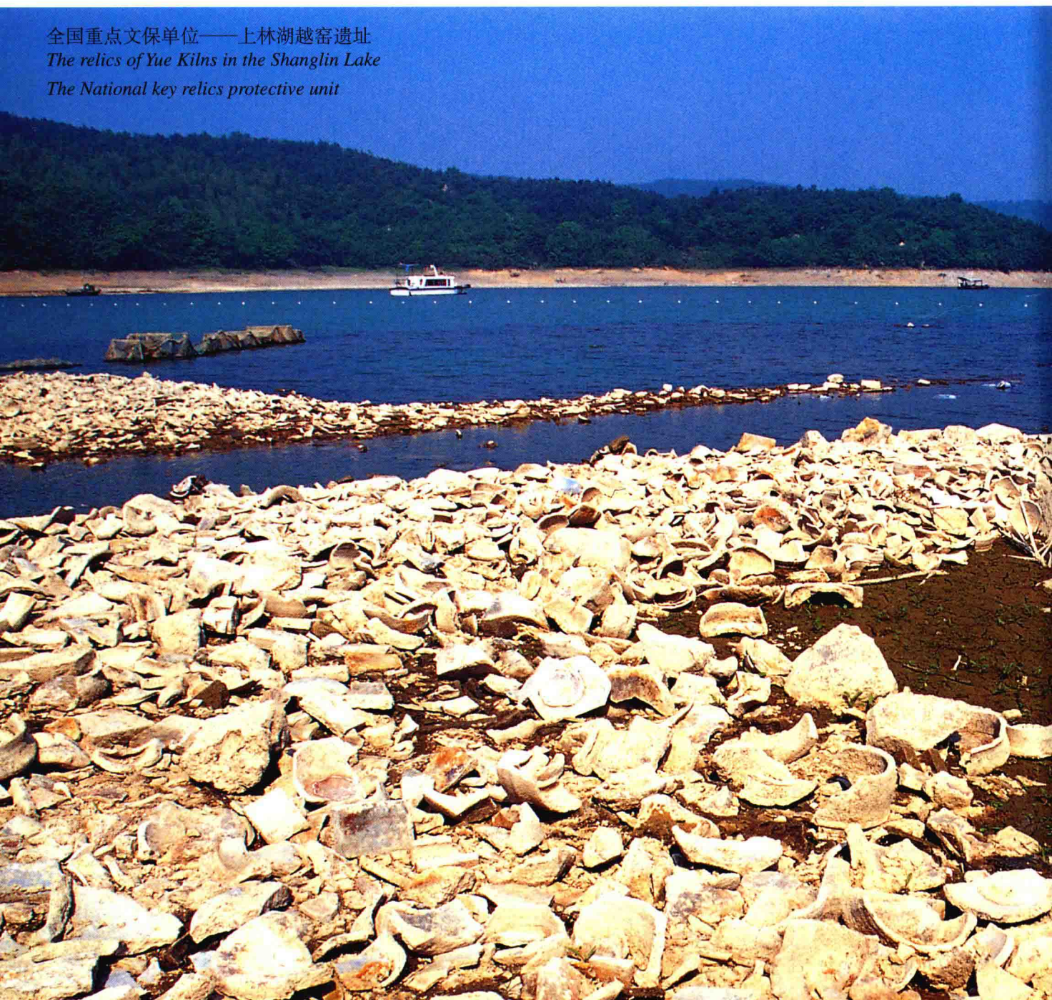
全国重点文保单位——上林湖越窑遗址 The relics of Yue Kilns in the Shanglin Lake The National key relics protective unit

Cixi is endowed with beautiful natural scenery and abundant tourist resources. Many places of interest are