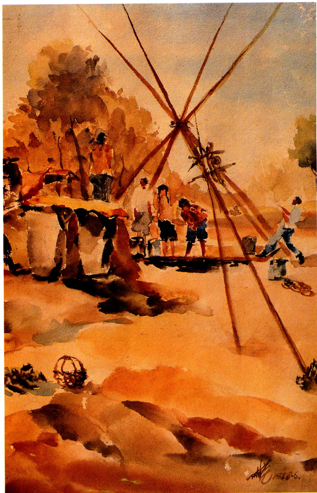
打井水 水彩 Drawing Water from a Well Watercolour