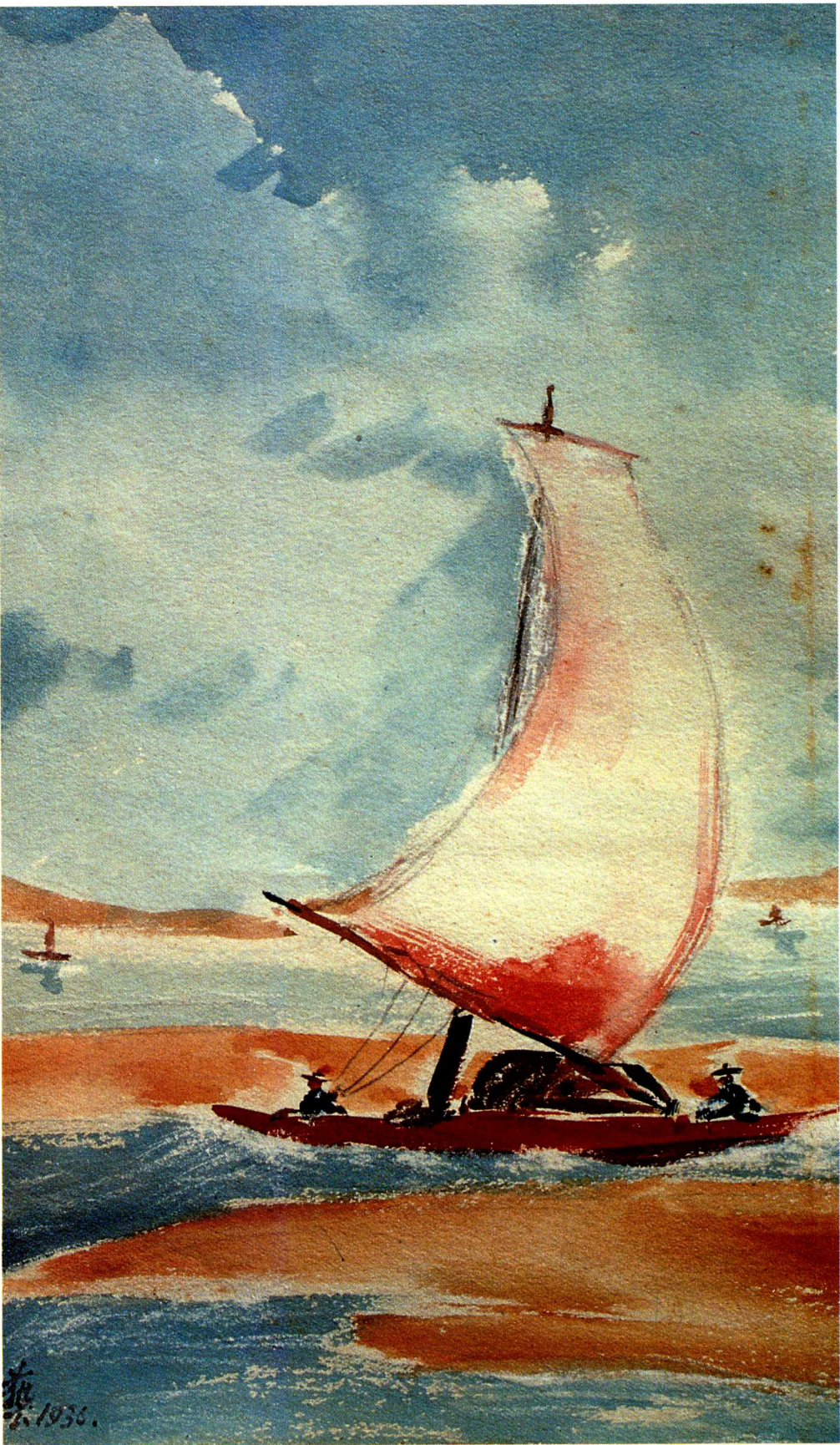
揚帆 水彩 Setting Sail Watercolour