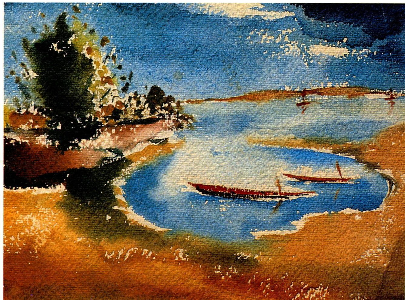
小舟 水彩 Boats Watercolour