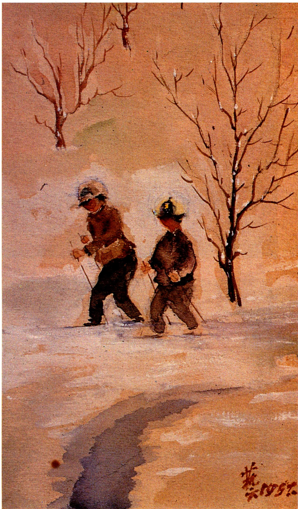
郊道 水彩 Road in the Suburbs Watercolour