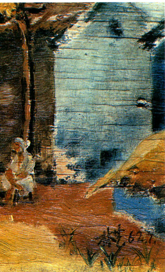
農家歌晌 油畫 Taking a Midday Rest