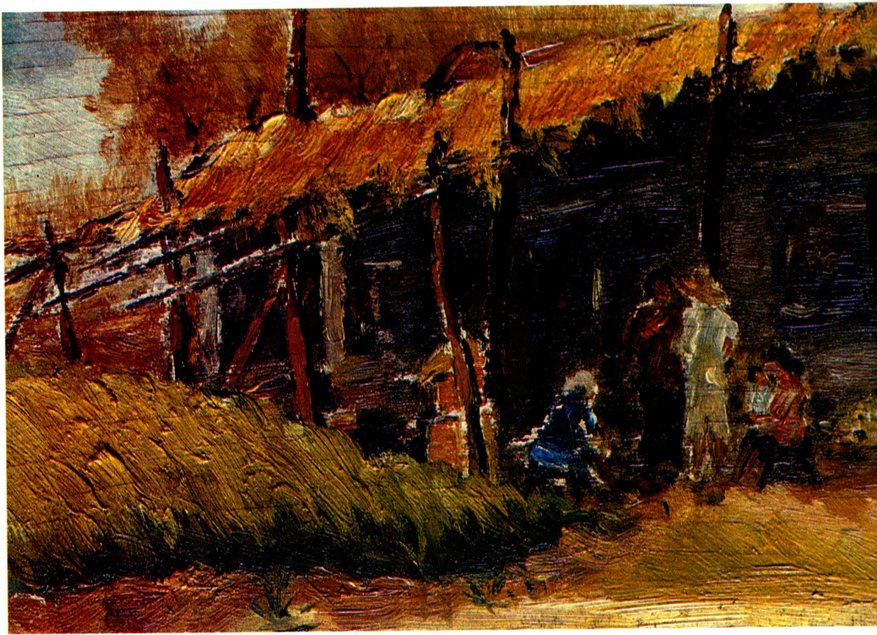
田野 水彩 Farmland Watercolour