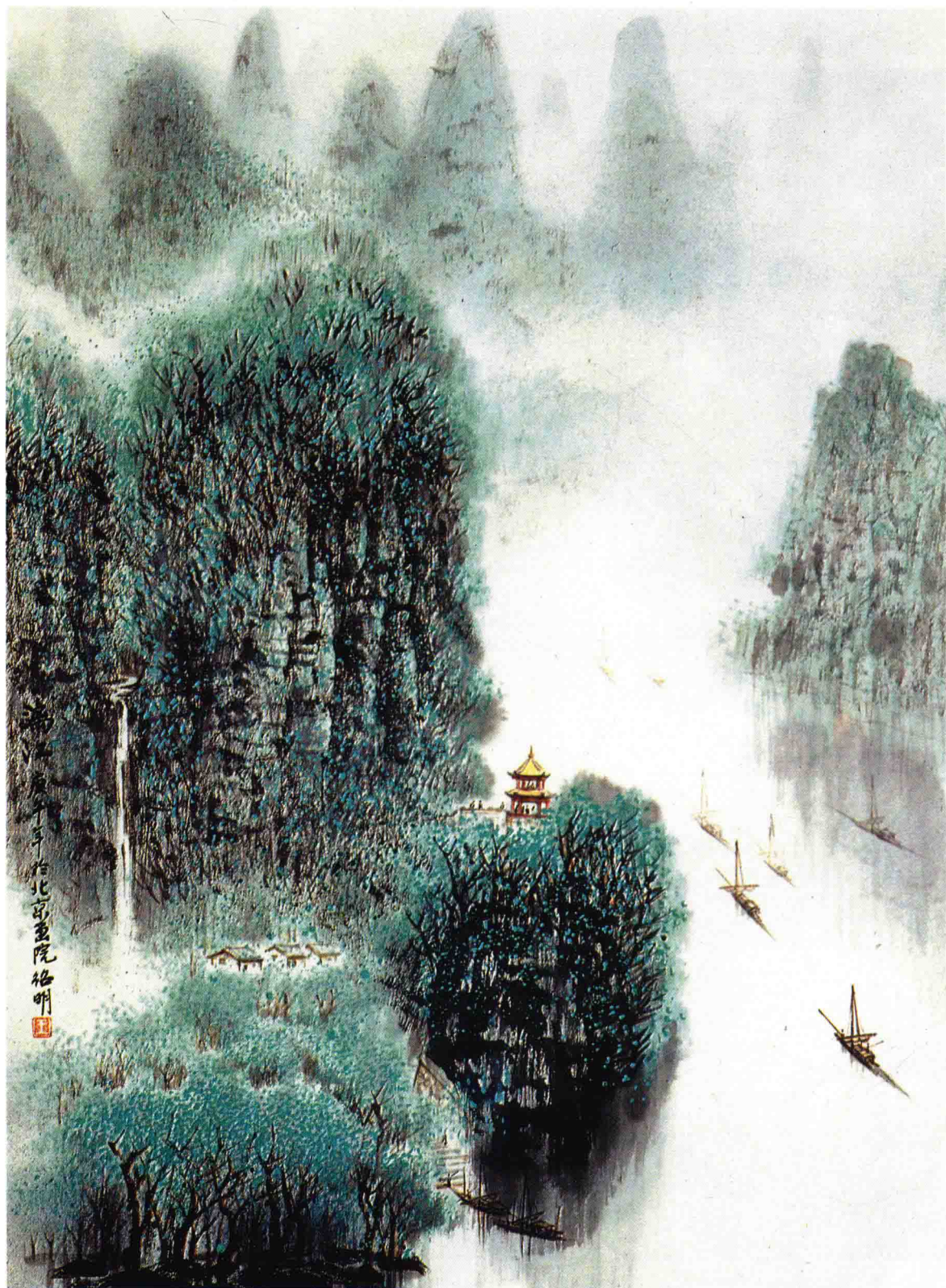
灕江晨曲 Morning Tune