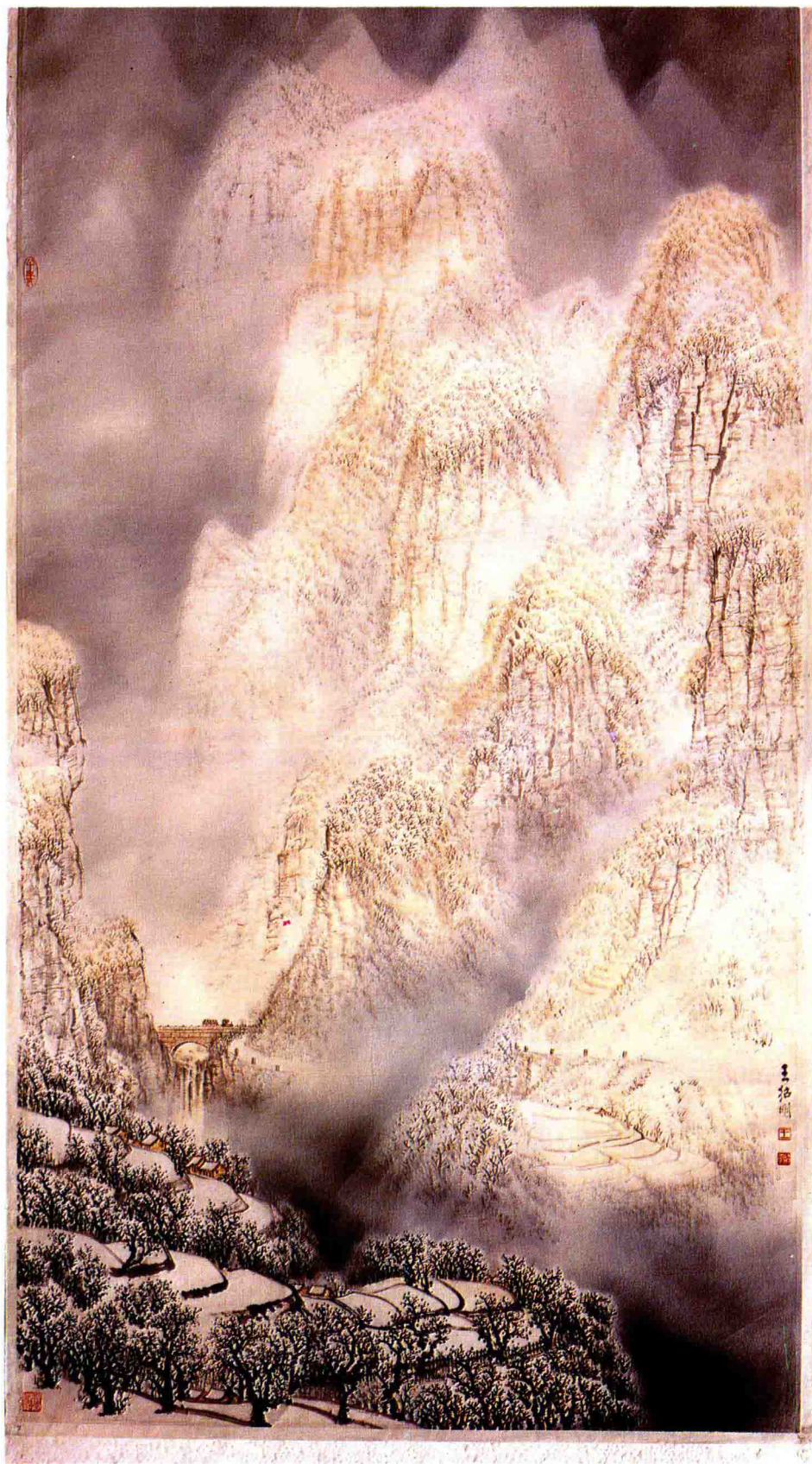
雪染山川 Mountains Covered with Snow