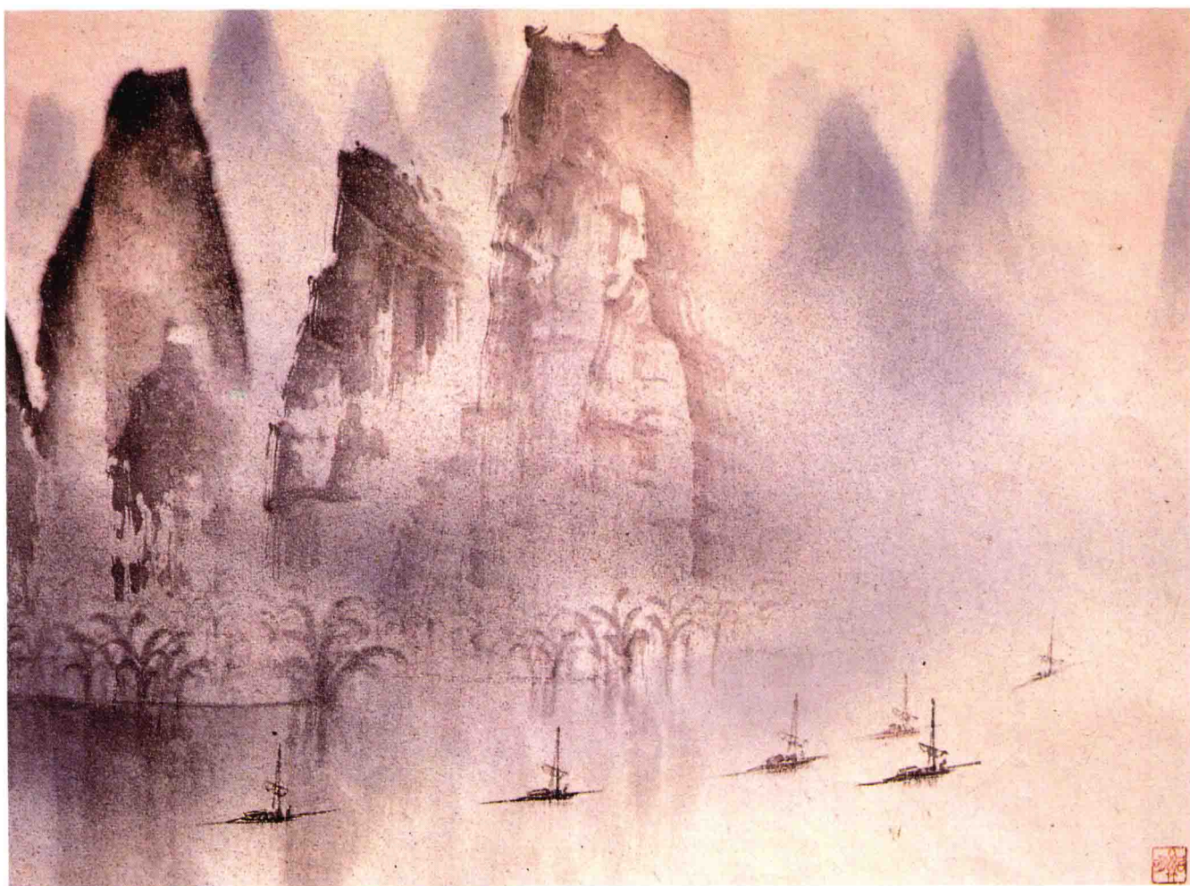
晨 霧 Morning Mist