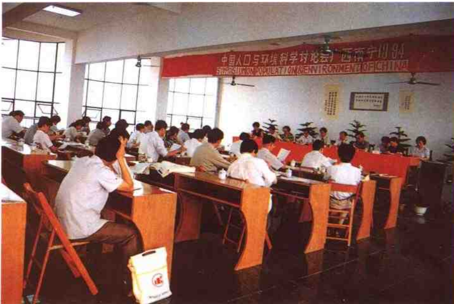
(2) The "Symposium on China Population and Environment" convened by the China Population and Environment Society, was held in the capital city of Guangxi Autonomous Region in May 19~21, 1994. This photo shows the venue of the Symposium.