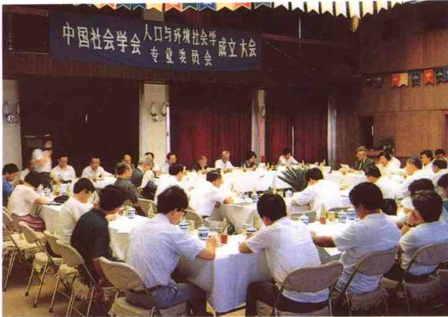
(1) The venue of the founding meeting of the China Population and Environment Society, China Sociological Association (July, 1992)