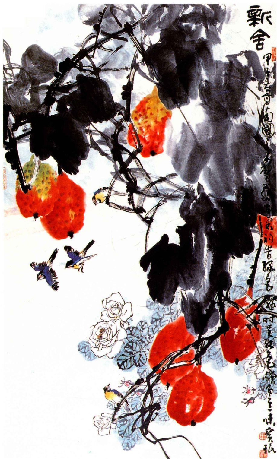
新 舍 New Home