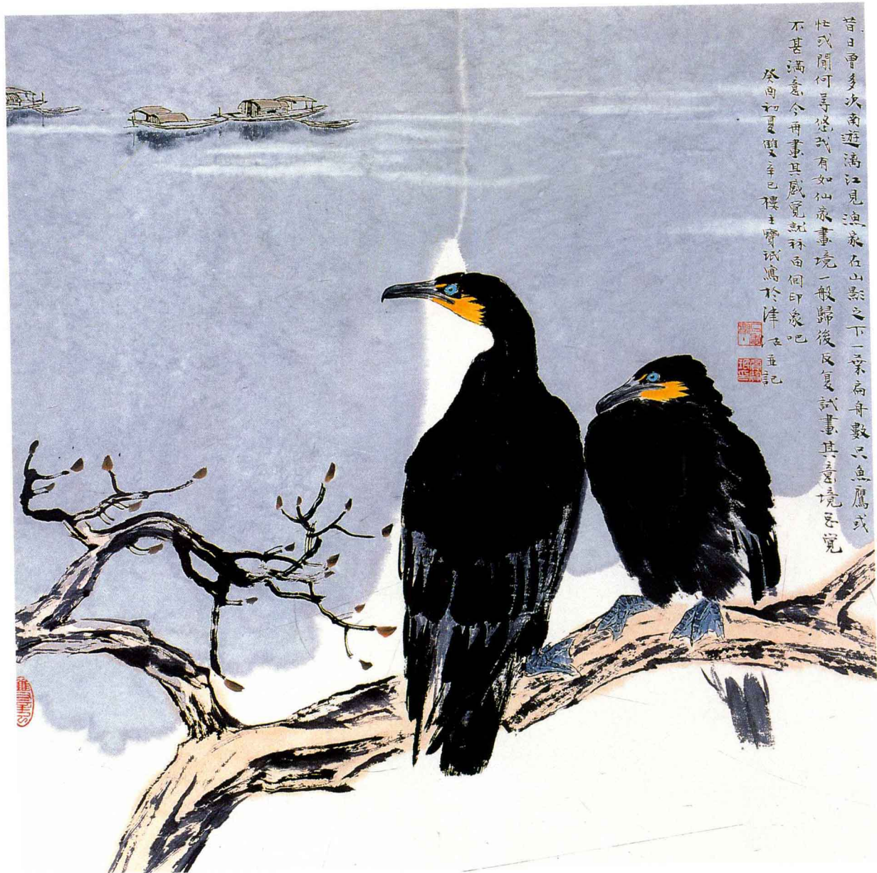
漁江魚歌 (69×69cm) 1993 年 Fisherman's Song