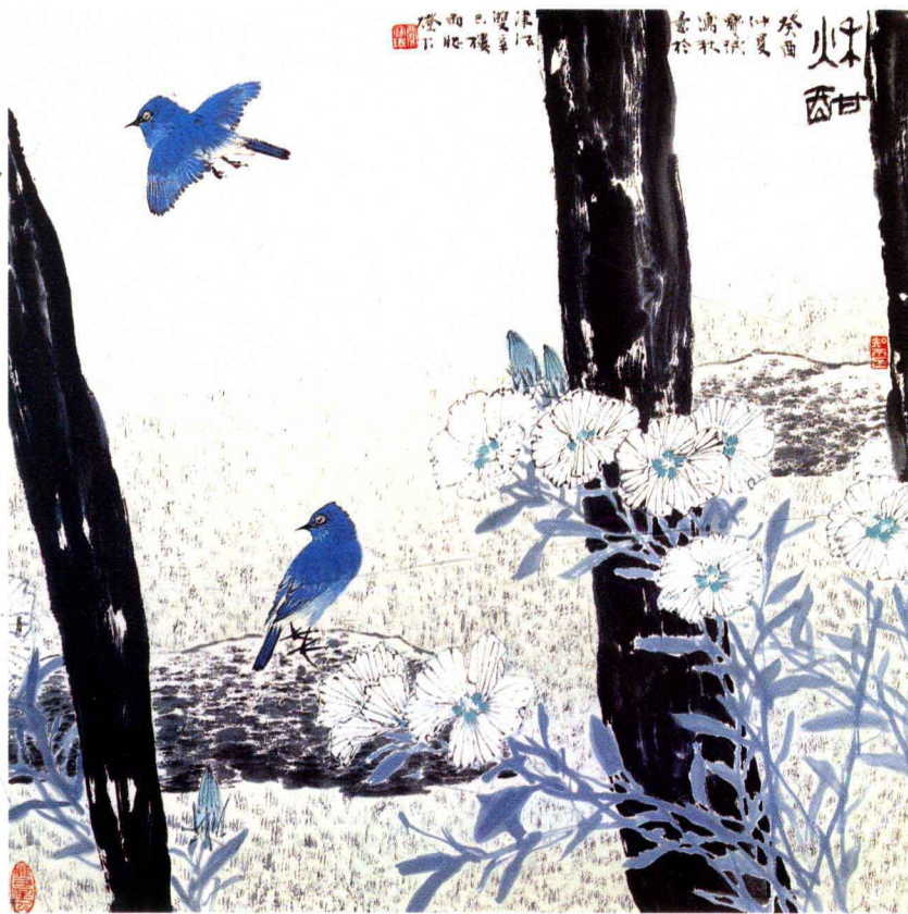
秋酣 (69×69cm) 1993 年 Late Autumn