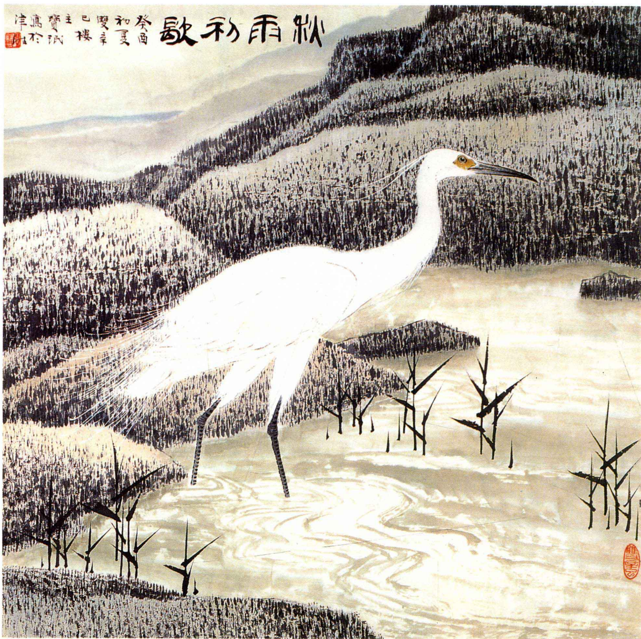
秋雨初歇 (71×71cm) 1993 年 Autumn Rain Stopping