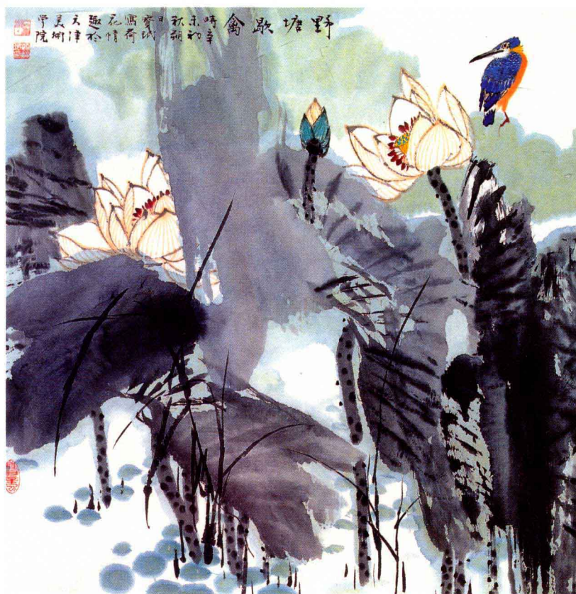
野塘歌禽 (69×69cm) 1991 年 Some Birds at a Pond