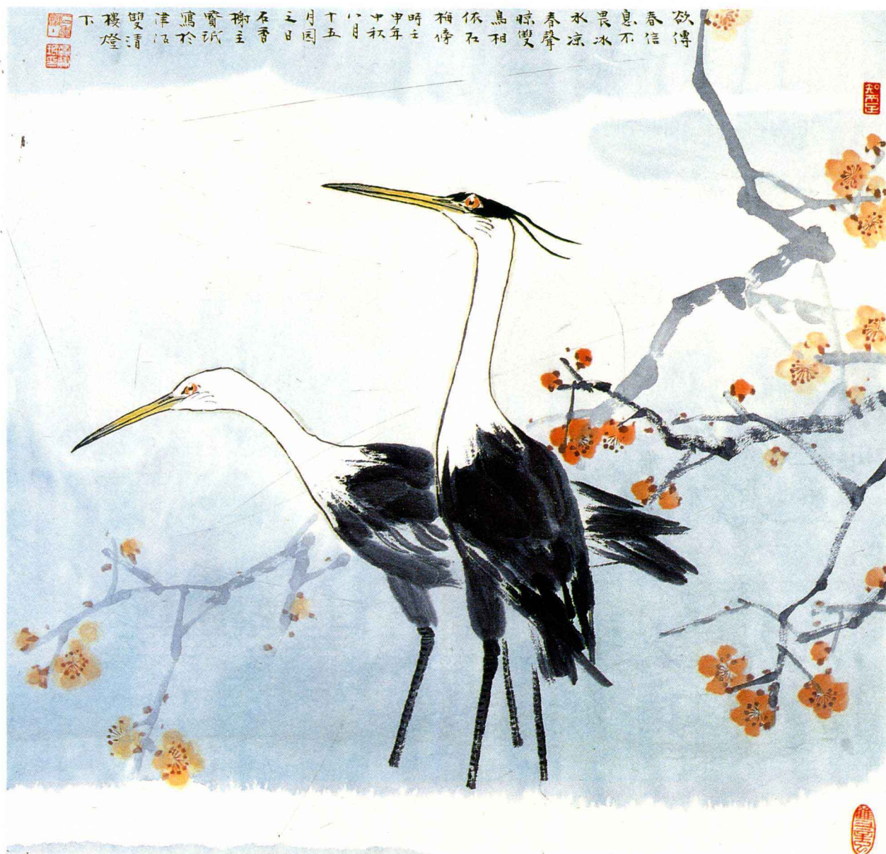
春 息 (69×69cm) 1992 年 The Spring Message