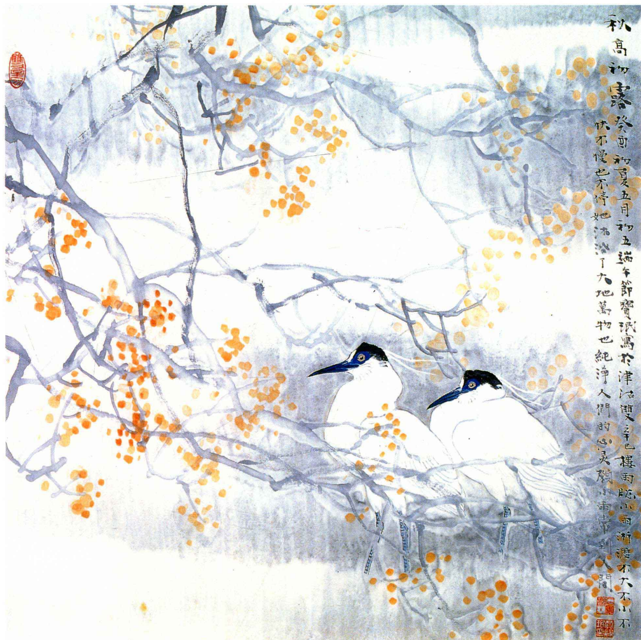
秋高初露 (69×69cm) 1993 年 The First Dew