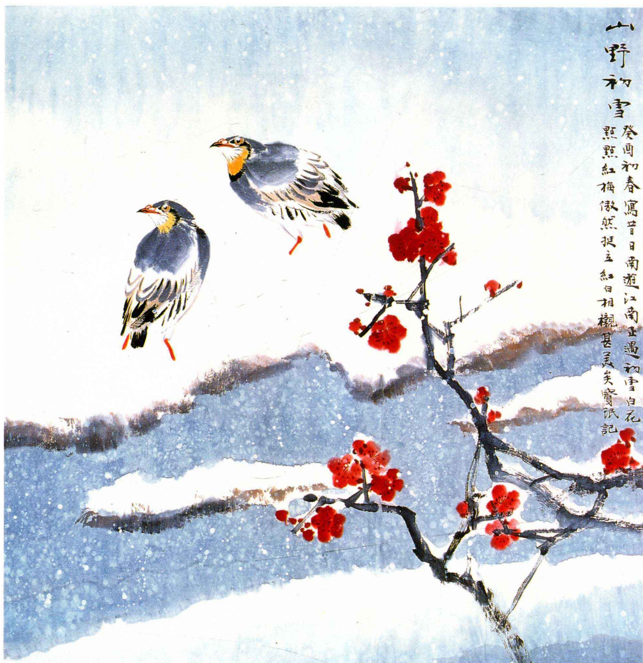
山村初雪 (69×69cm) 1993 年 The First Snow