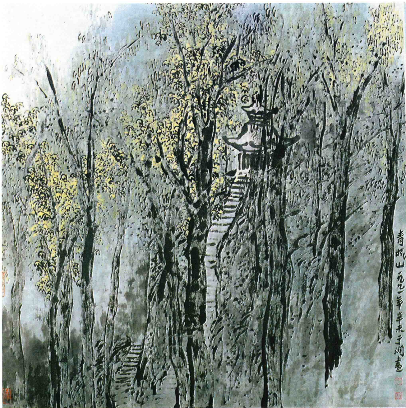
青城山 (673×682cm) 1991 年 Qingcheng Mountains