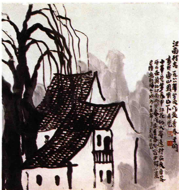
江南村舍 (646×660cm) 1988 年 Village House