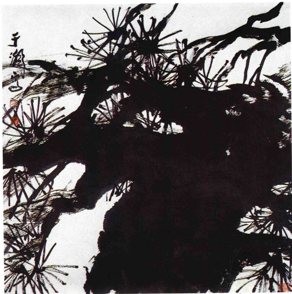
松 韵 (683×686cm) 1990 年 Pines