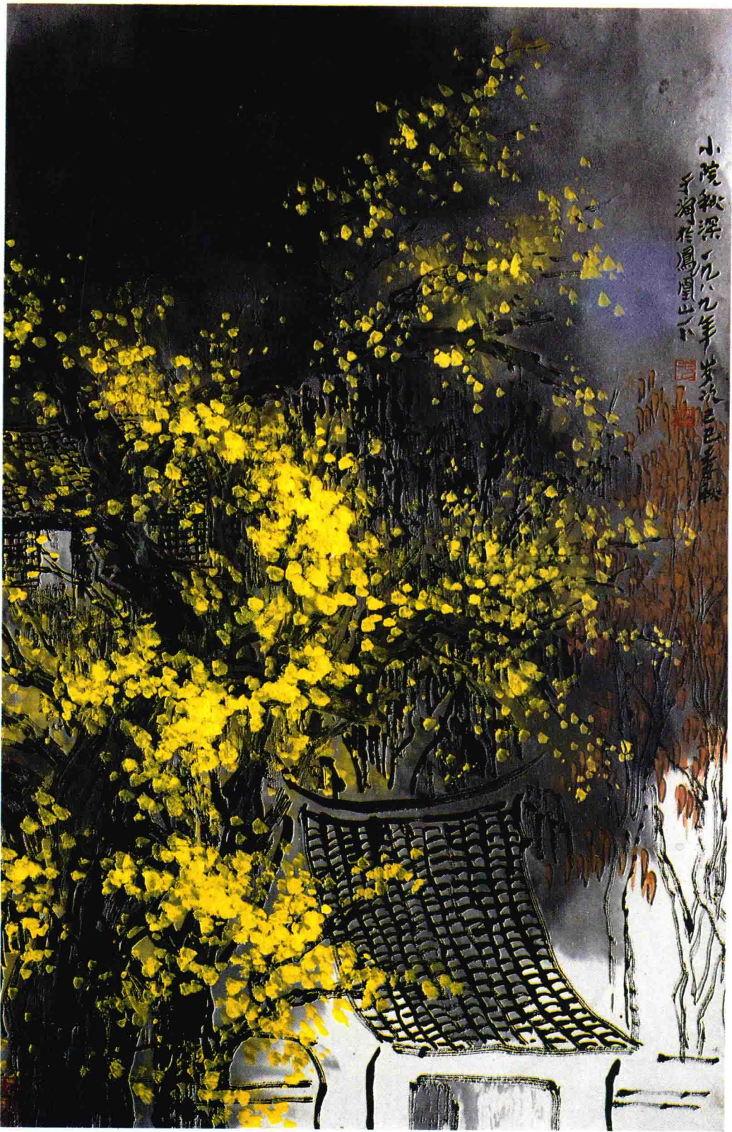
小院秋深 (450×675cm) 1989 年 Late Autumn in a Courtyard