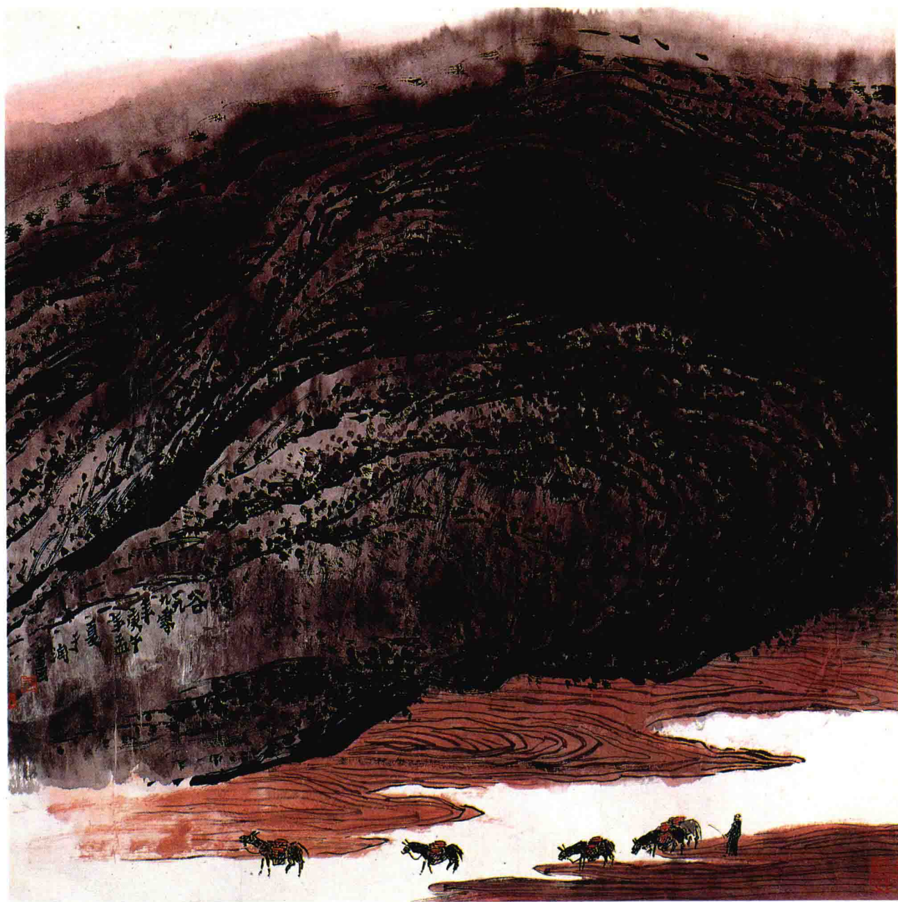
灤河谷 (685×680cm) 1990 年