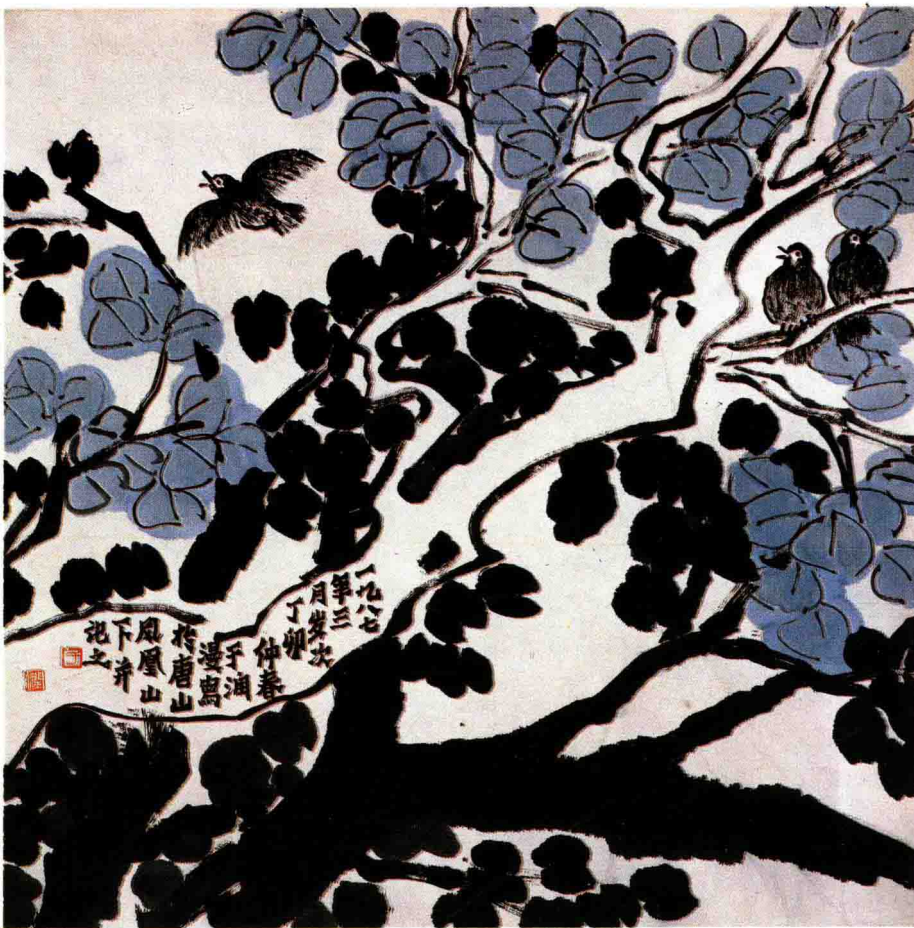
林蔭鳥語 (680×675cm) 1987 年 Bids Singing