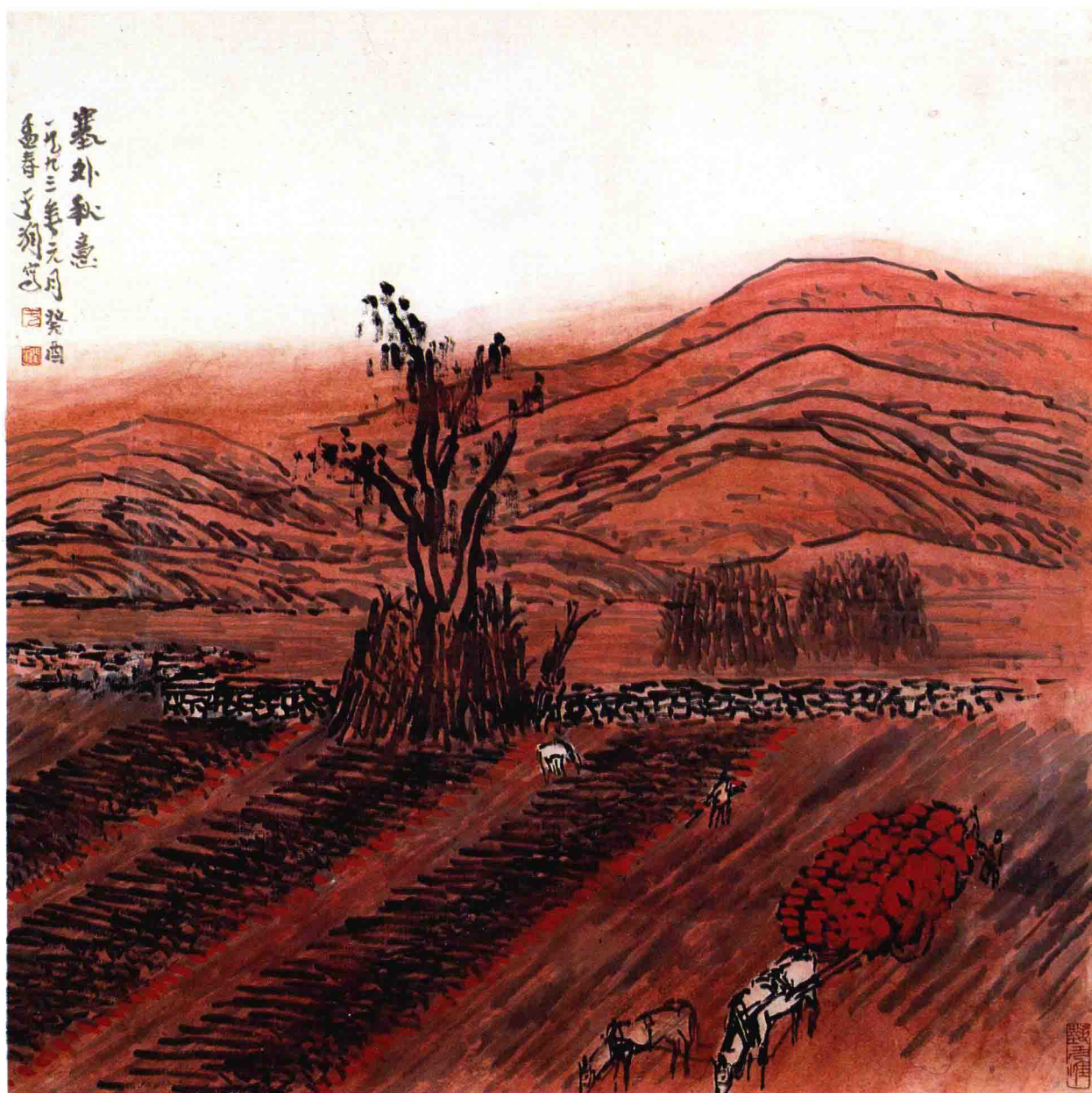
塞外秋意 (676×683cm) 1993 年 Autumn Beyond the Great Wall