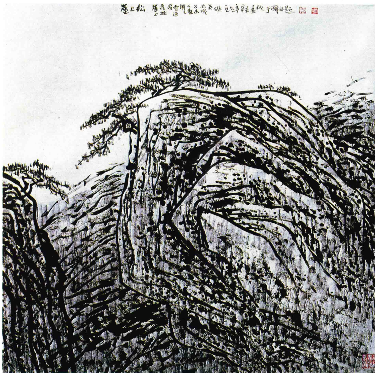
崖上松 (680×685cm) 1991 年