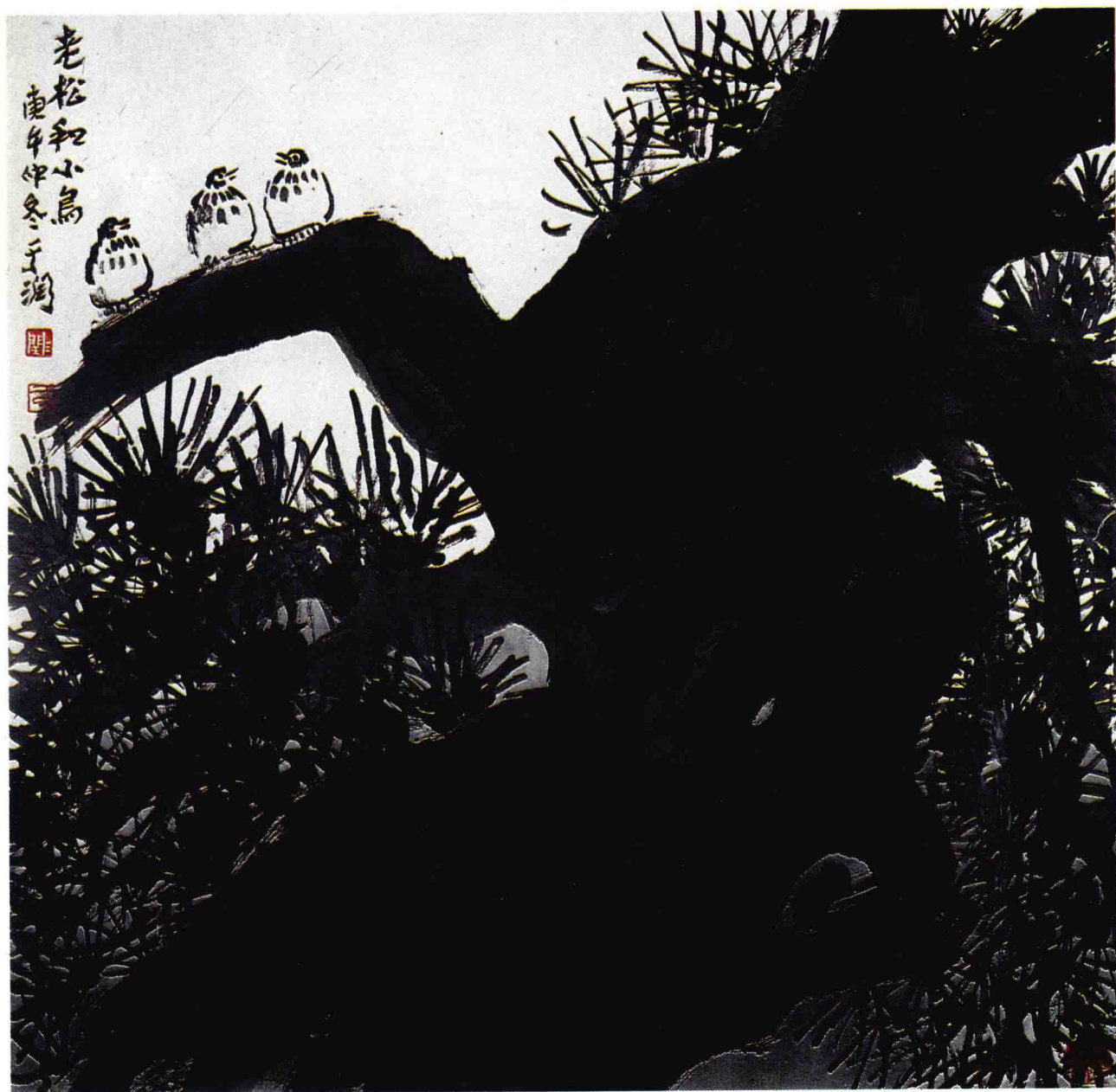
老松和小鳥 (685×690cm) 1990 年 Old Pine and Little Birds