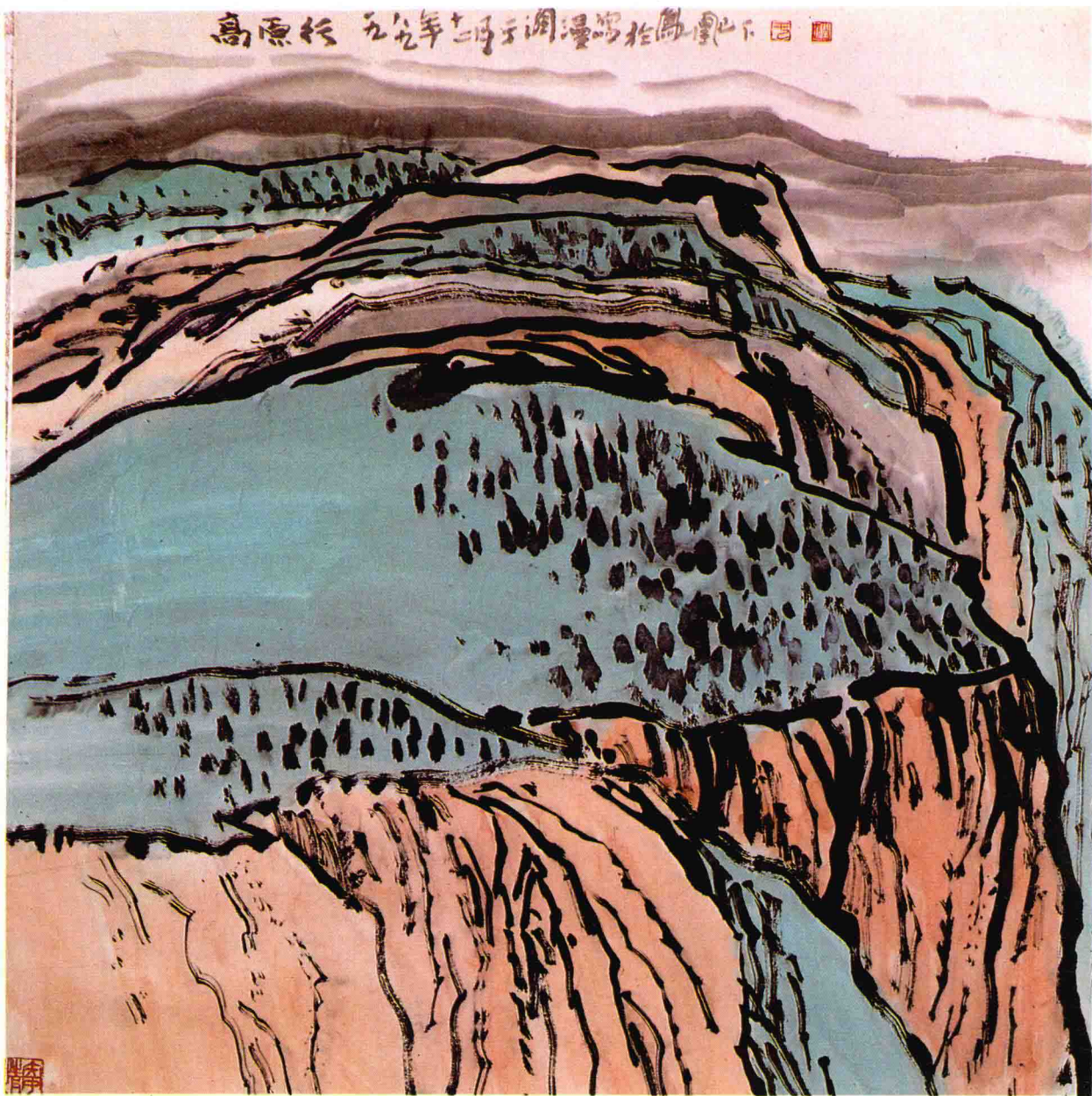
高原行 (670×675cm) 1989 年 Plateau Scenery