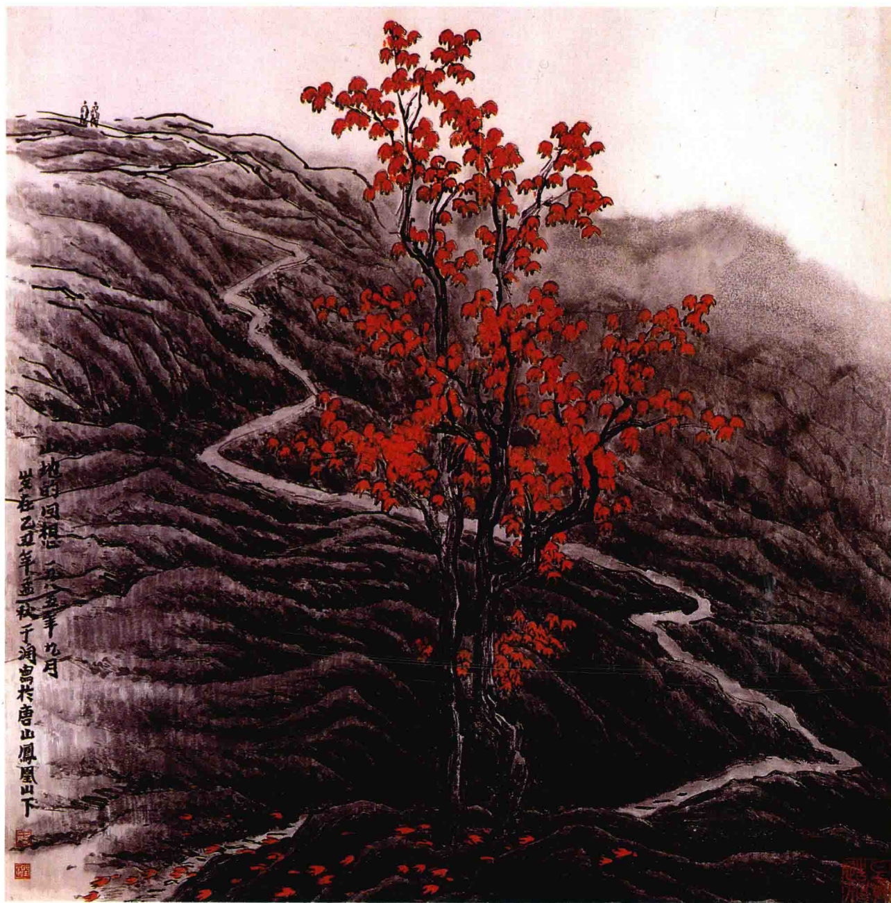
山地的回想 (677×699cm) 1985 年 A Recollection of the Mountains Region