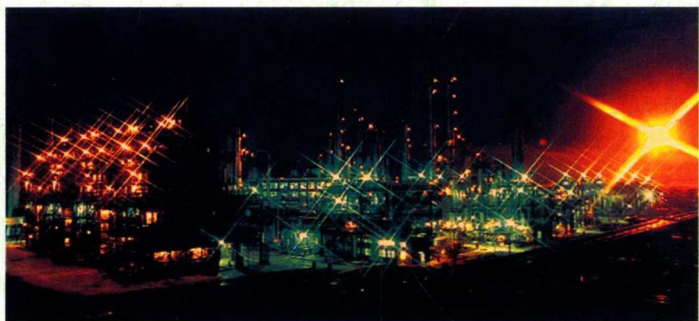
大庆乙烯化工厂夜景 A Night Scene of Daqing Ethylene Chemical Plant