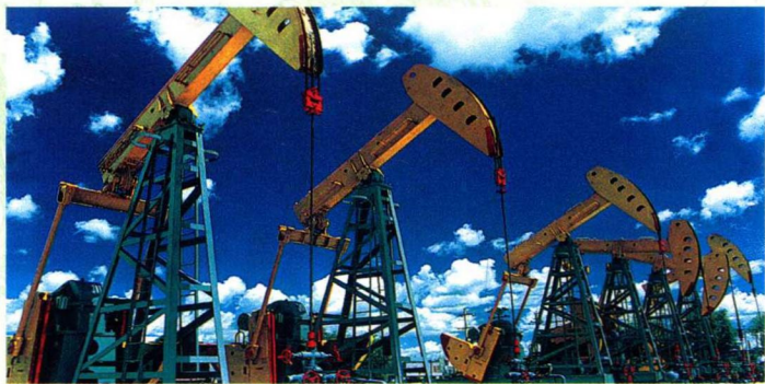
丛式井 A Cluster of Oil Wells