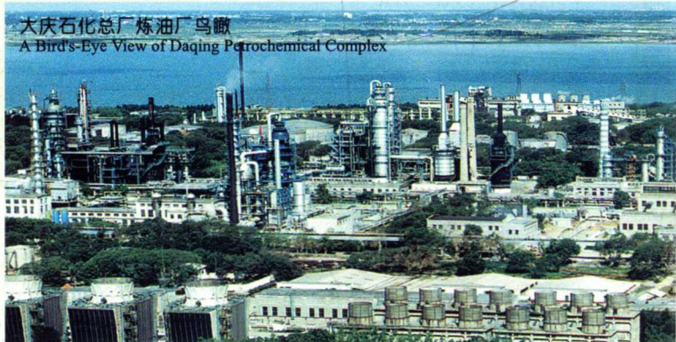
大庆石化总厂炼油厂鸟瞰 A Bird's-Eye View of Daqing Petrochemical Complex