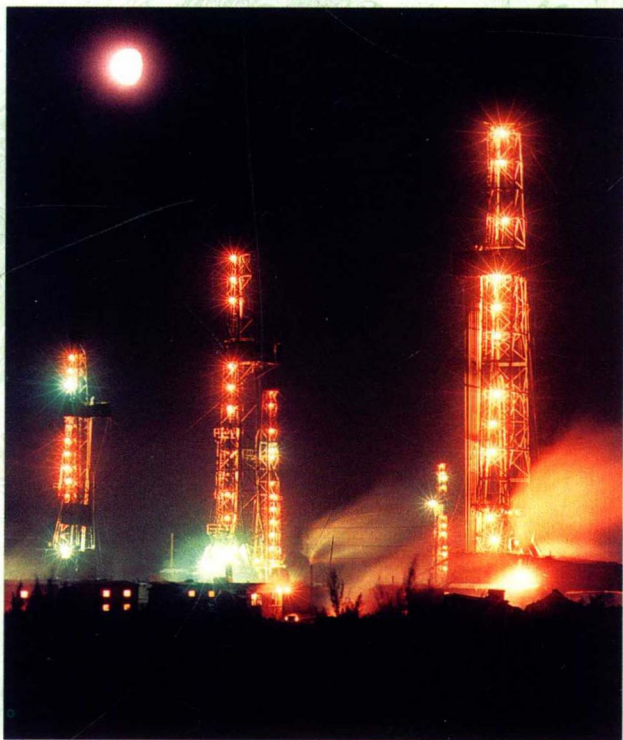
夜钻 Drilling at Night