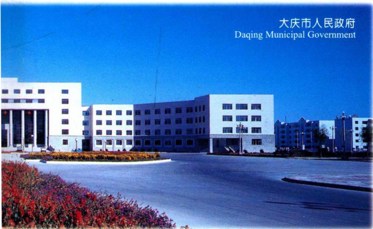
大庆市人民政府 Daqing Municipal Government

Today's Daqing is clean and tidy. It offers broad streets and