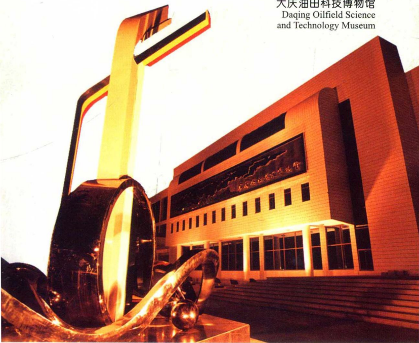
大庆油田科技博物馆 Daqing Oilfield Science and Technology Museum