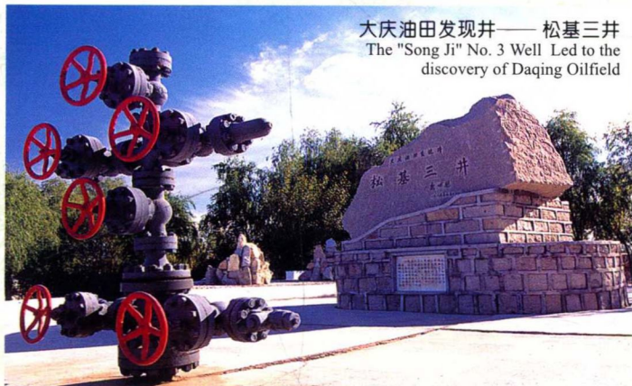
大庆油田发现井——松基三井 The "Song Ji" No. 3 Well Led to the discovery of Daqing Oilfield