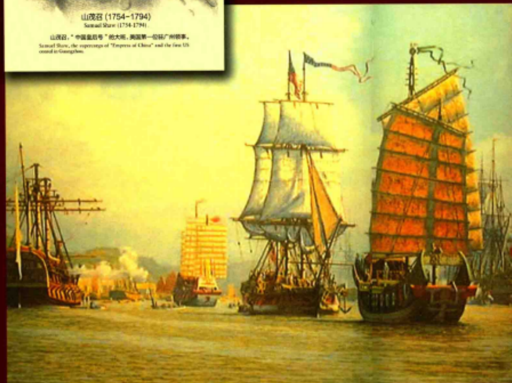
停泊在黄埔港的“中国皇后号” The "Empress of China" at Hongqiao Port

山茂召,“中国皇后号”的大副,美国第一位驻广州领事。 Samuel Shaw, the supercargo of "Empress of China" and the first US consul in Guangzhou.