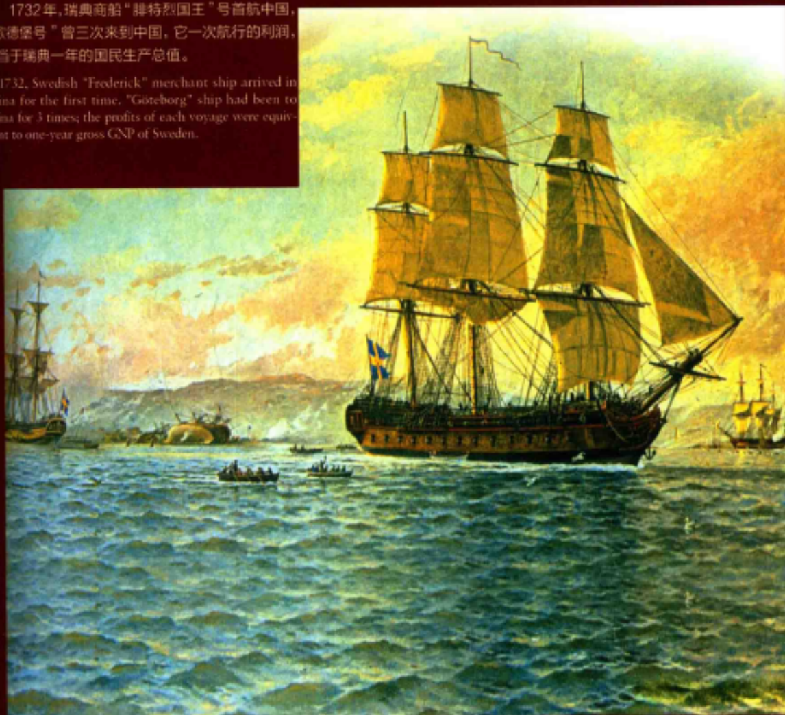
行驶中的瑞典商船“歌德堡号” "Göteborg" - a Swedish merchant ship

In 1732, Swedish "Frederick" merchant ship arrived in China for the first time. "Göteborg" ship had been to China for 3 times; the profits of each voyage were equivalent to one-year gross GNP of Sweden.