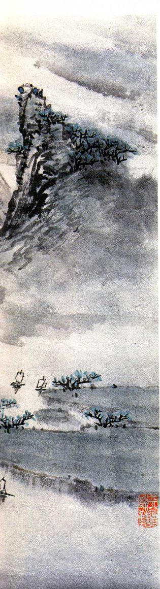
青山積翠 Green Hills