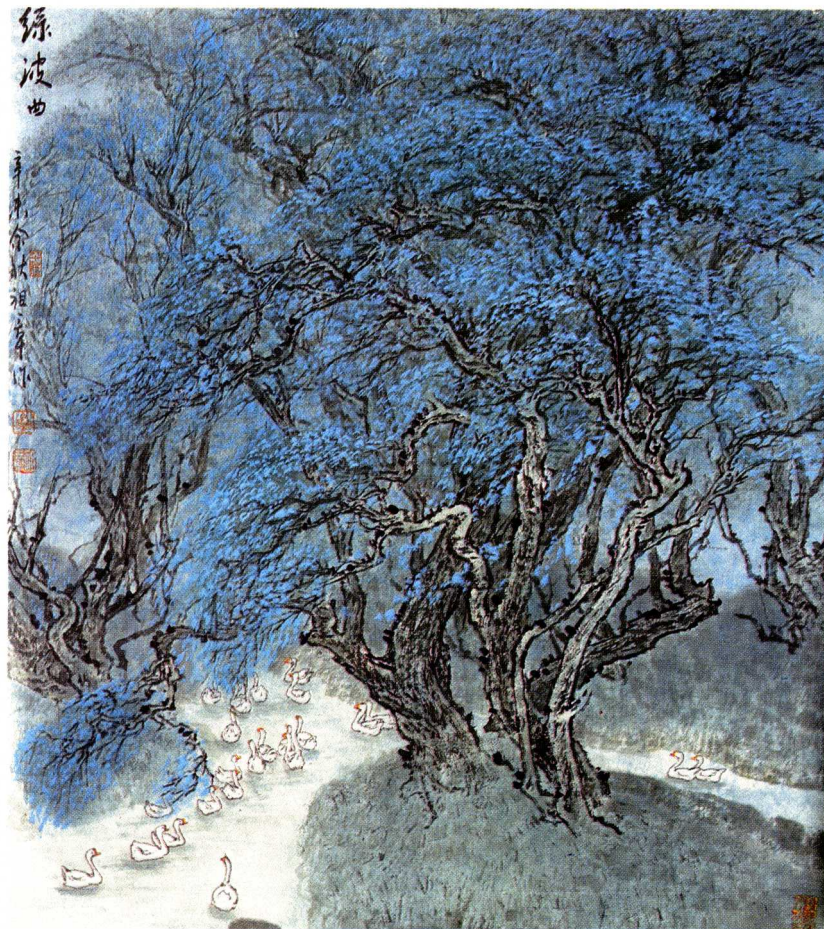
綠波曲 Green Waves