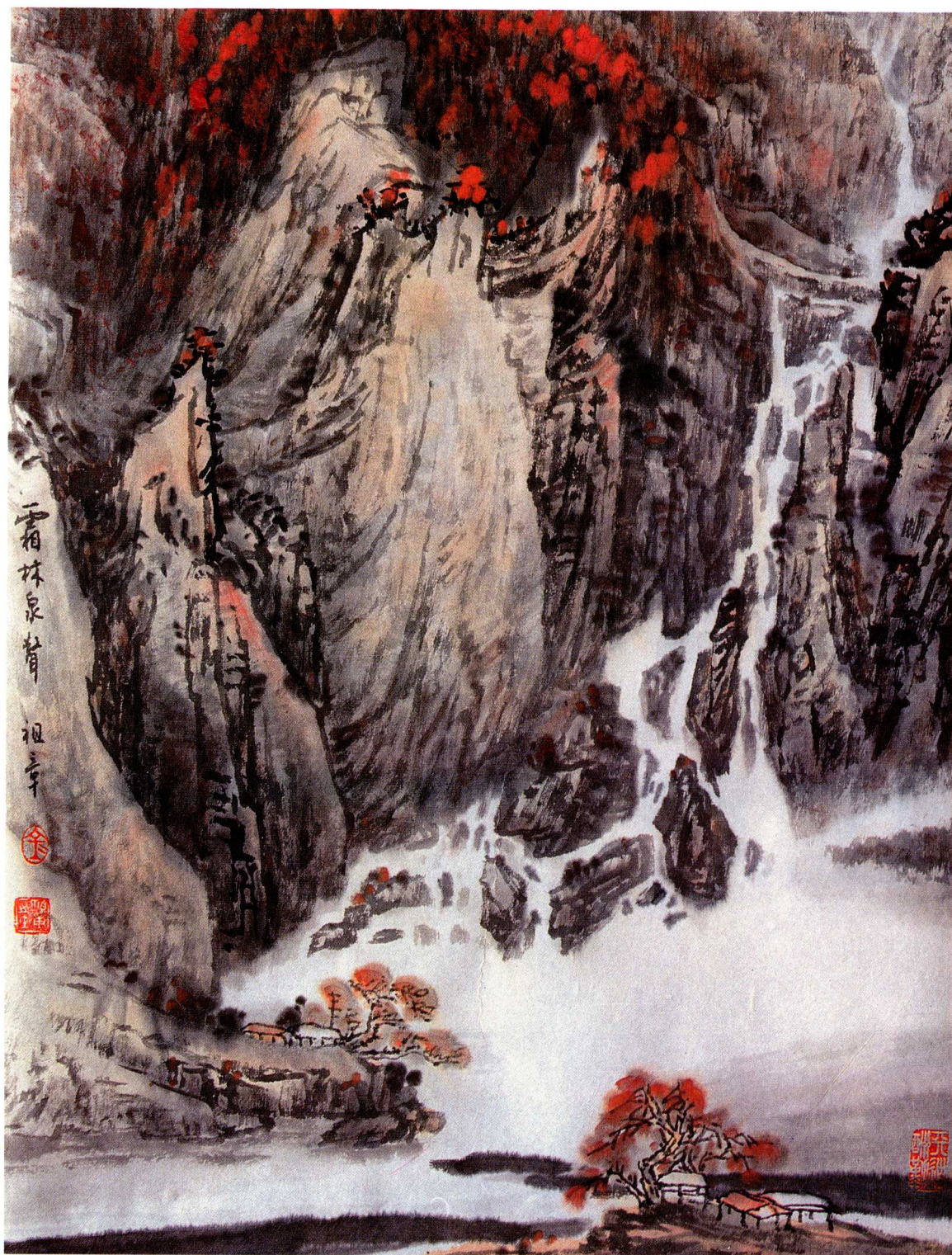
霜林泉聲 Sound of a Spring