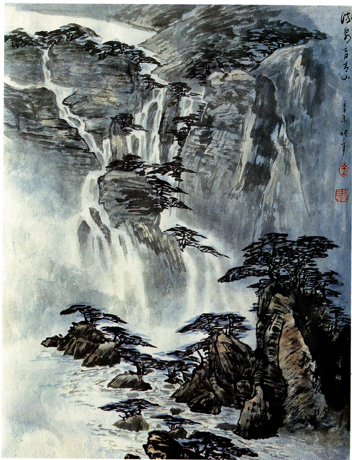
流泉育青山 A Flowing Spring