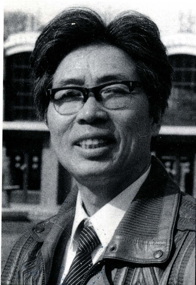
畫家像 Jin Zuzhang