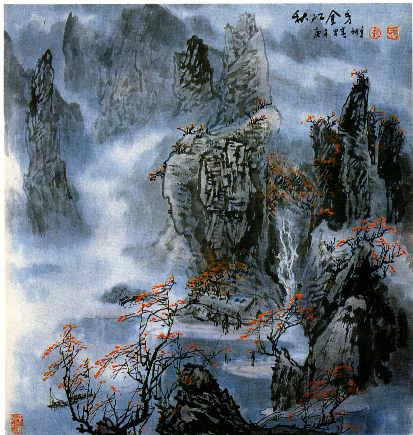
秋江金秀 Autumn Rivers