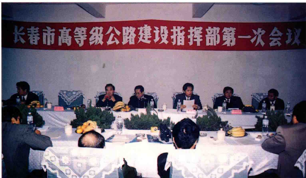
1994 年 10 月，長春市高等級公路建設指揮部正式成立，標志着長春市高等級公路建設進入一個新的歷史時期。