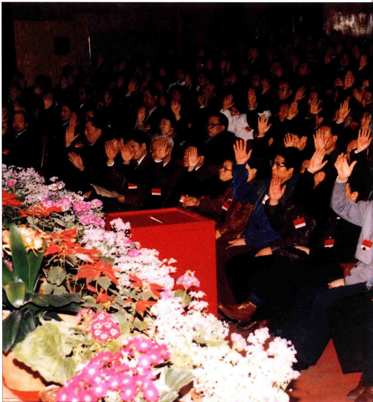
長春市十屆人大三次會議于 1995 年 2 月通過了《關於建設長春繞城高速公路的決議》。 The Resolution on the Construction of Changchun "Ring Road" Expressway Project was adopted on the Third Session of the Tenth Municipal People's Congress in February, 1995.