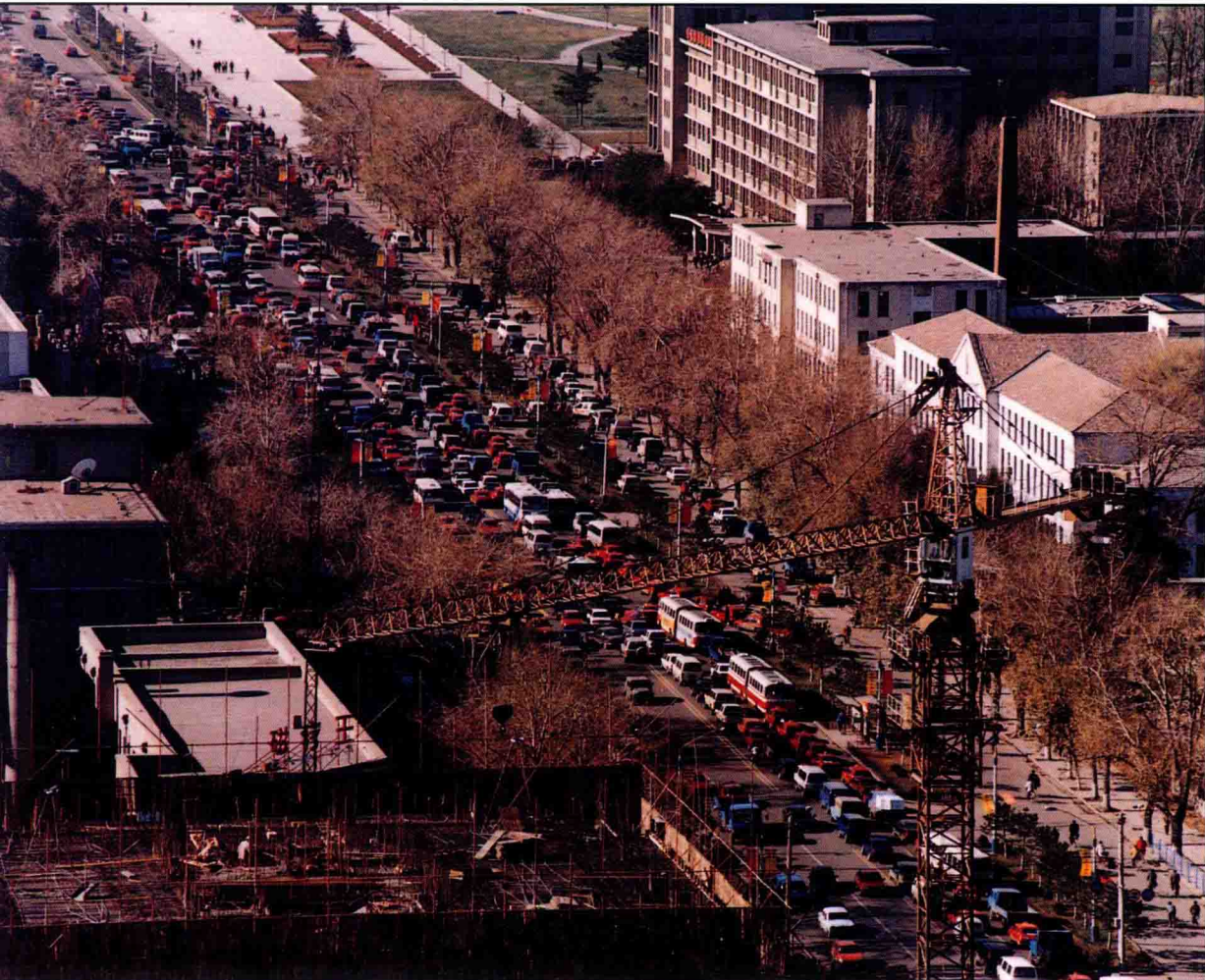
解放大路交通状况 The Existing Situation on Jiefang Avenue