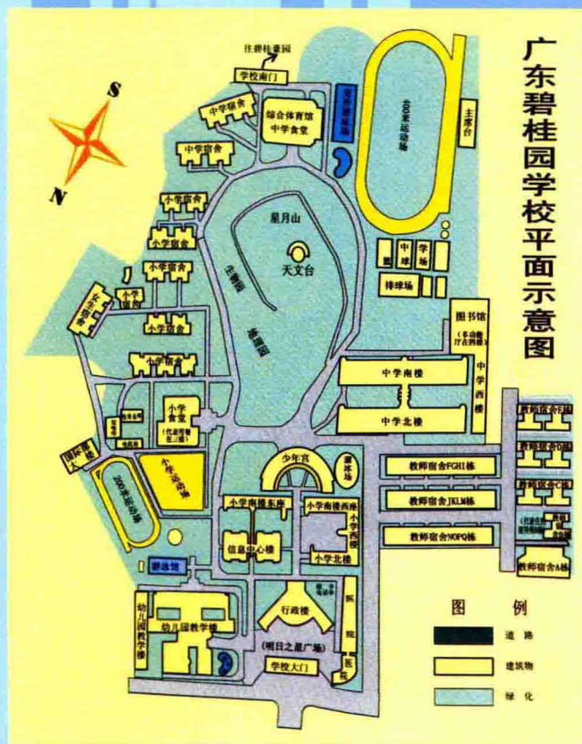
学校平面图 The School Ichography