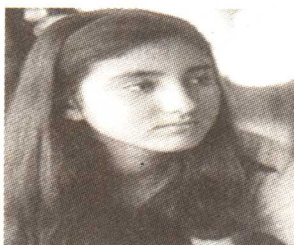
2) Oh, I failed in the exam!