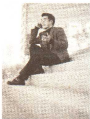
1) I want to ...

Make a similar series of dialogues with the functional sentences about the following situations.