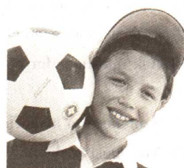
3) Host your ambition!