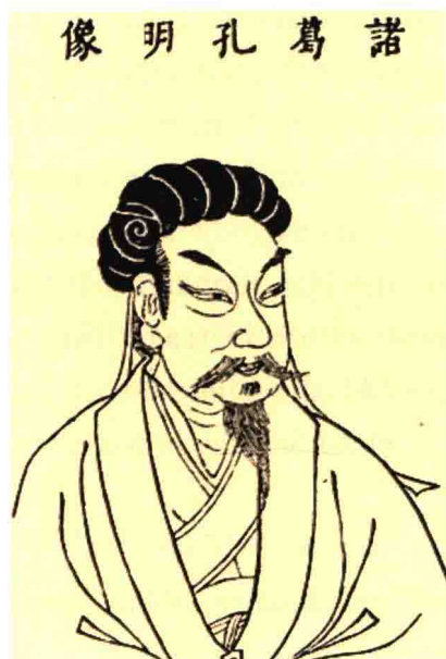
Portrait of Zhuge Liang (181-234)

feudal orthodoxy or benevolent governance, but singing the praises of the true talent. The novel is a passionate ode to feudal talent." (See "A Passionate ode to feudal talent," published in the third issue of the Journal of Anhui Normal University in 1981.)