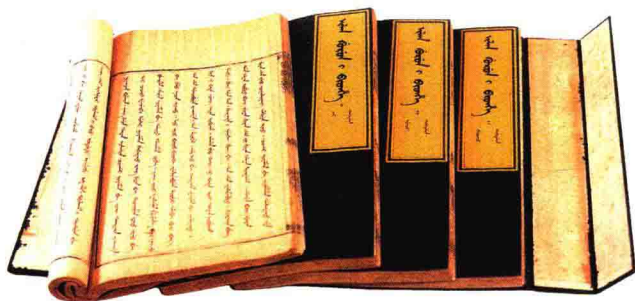
Romance of the Three Kingdoms , Manchu Version from the Reign of Shunzhi, Qing Dynasty

about the novel in recent years are presented below.