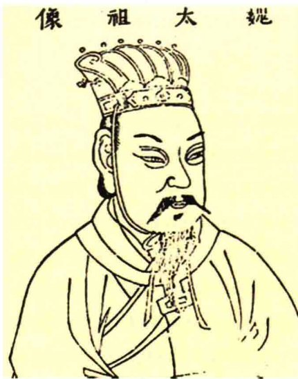
Portrait of Cao Cao (155-220)

5. Presenting a tragedy. Huang Jun held that Cao Cao was depicted as a prime example of self-interest typical of the exploiting class and a real-life symbol of feudal society, while Liu Bei appears as the author's embodiment of the idealized ethics of the feudal society. The sharp contrasts between