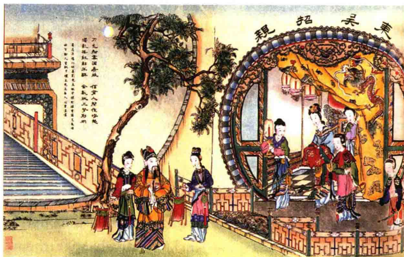
Yangliuqing New Year Wood-block Print: A False Marriage Staged by Eastern Wu