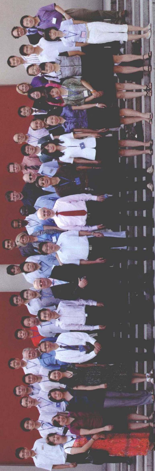
Participants of Inaugural Ningbo-Nottingham International Finance Forum Research Meeting 首届宁波·诺丁汉国际金融论坛学术讨论会参会代表合影