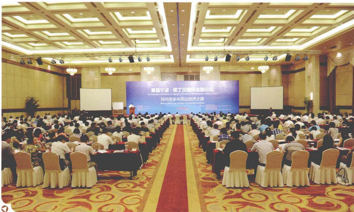
Plenary meeting of the Inaugural Conference of Ningbo-Nottingham International Finance Forum (International Conference Hall, Nanyuan Hotel, Ningbo) 首届宁波·诺丁汉国际金融论坛会场（宁波南苑饭店国际会议厅）