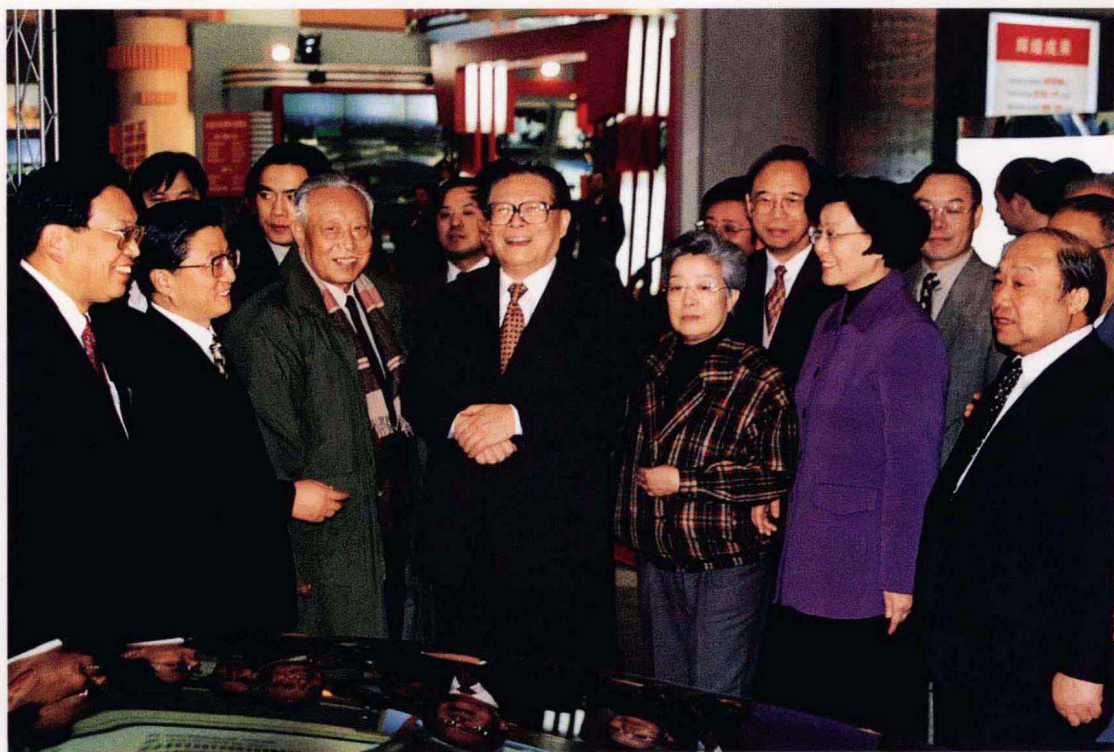
1998年12月1日，江泽民同志视察全国“改革开放20年以来利用外资成果展”上海展区 On Dec.1,1998, Jiang Zemin inspects the Shanghai pavilion at the "Exposition of China's Achievements in Absorbing Foreign Investment during the Two Decades of Reform and Opening"