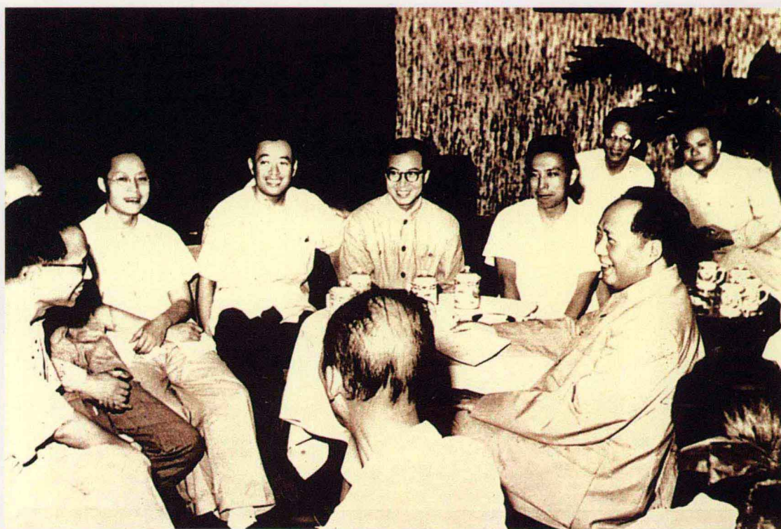
1957年，毛泽东同志在上海与工业、商业、贸易界人士座谈 In 1957, Mao Zedong with people from the local industrial, commercial and trade circles in Shanghai