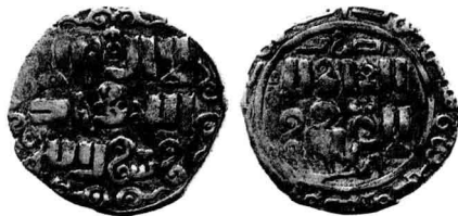
也迷里回曆 660 年金幣