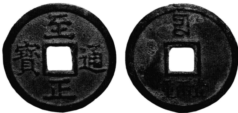
至正通寶 · 折十 · 楷書 · 背壹兩重