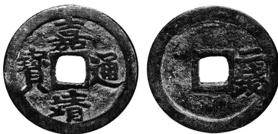
嘉靖通寶 · 折二 · 楷書 · 背二錢