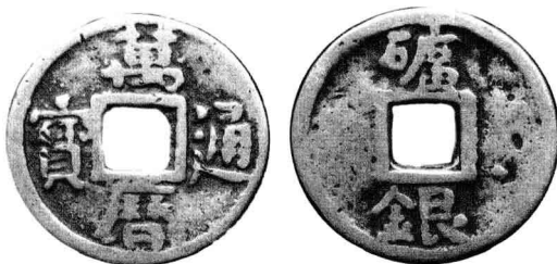
萬曆通寶 · 楷書 · 銀質 · 背礦銀