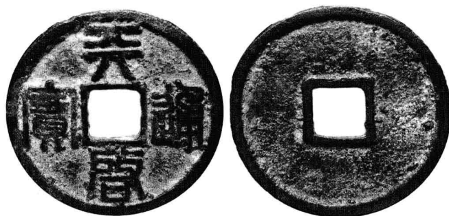
天啓通寶 · 折三 · 篆書