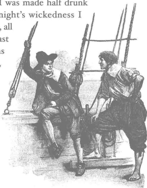
YOU'RE BUT A FRESH-WATER SAILOR.

I had slept well in the night, and was now no more sea-sick, but very cheerful, looking with wonder upon the sea that was so rough and terrible the day before, and could be so calm and so pleasant in so little a time after. And now, lest my good resolutions should continue, my companion, who had enticed me away, comes to me; "Well, Bob," says he, clapping me upon the shoulder, "how do you do after it? I warrant you were frightened, wer'n't you, last night, when it blew but a capful of wind?" "A capful d'you call it?" said I; "'twas a terrible storm." "A storm, you fool you," replies he; "do you call that a storm? why, it was nothing at all; give us but a good ship and sea-room, and we think nothing of such a squall of wind as that; but you're but a fresh-water sailor, Bob. Come, let us make a bowl of punch, and we'll forget all that; d'ye see what charming weather 'tis now?" To make short this sad part of my story, we went the way of all sailors; the punch was made and I was made half drunk with it: and in that one night's wickedness I drowned all my repentance, all my reflections upon my past conduct, all my resolutions for the future. In a word, as the sea was returned to its smoothness of surface and settled calmness by the abatement of that storm, so the hurry of my thoughts being over, my fears and apprehensions of being swallowed up by the sea being forgotten, and the current of my former desires returned, I