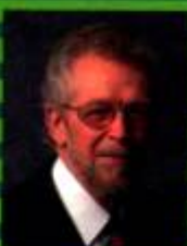
罗伊·金斯伯里 (Roy Kingsbury)

著名语言教学专家，曾任朗文出版公司全球教师培训师和语言教学方法顾问，亚历山大先生的夫人。她与亚历山大先生通力合作，协助出版了《新概念英语》(新版)、《朗文英语语法》、《朗文高级英语语法》等多部著作。近年来，她致力于研究语言教学中听说技能的发展。