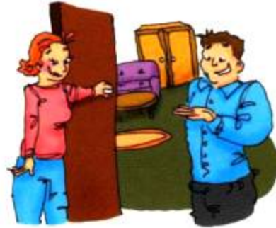
showed us their flat last week (yesterday)