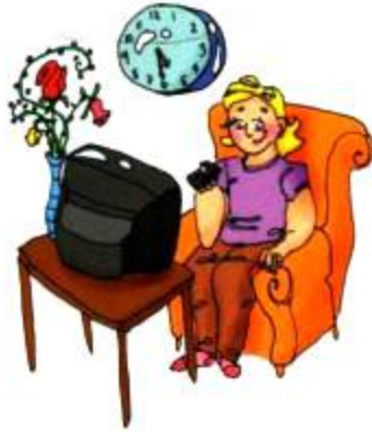
turned on the TV at teatime (at lunchtime)