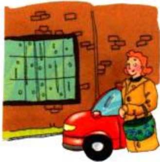
parked in the road yesterday (last week)