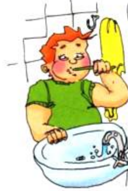
cleaned his teeth after breakfast (before breakfast)