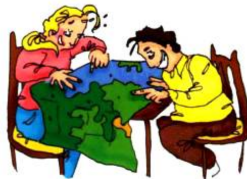
discussed the trip a year ago (last winter)