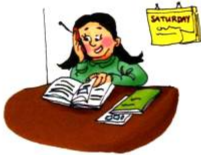
called her parents at the weekend (on Monday)