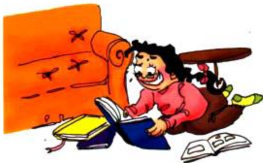
looked at her photo collection six weeks ago (six months ago)