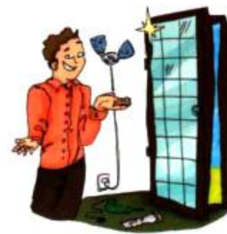
finished the job three weeks ago (last month)