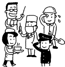
all walks of life