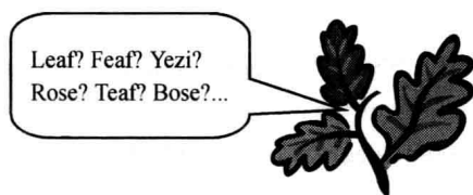
Fig. 1-1 Why do you call it “leaf”?

because you have got used to the arbitrariness and readily accept the convention.