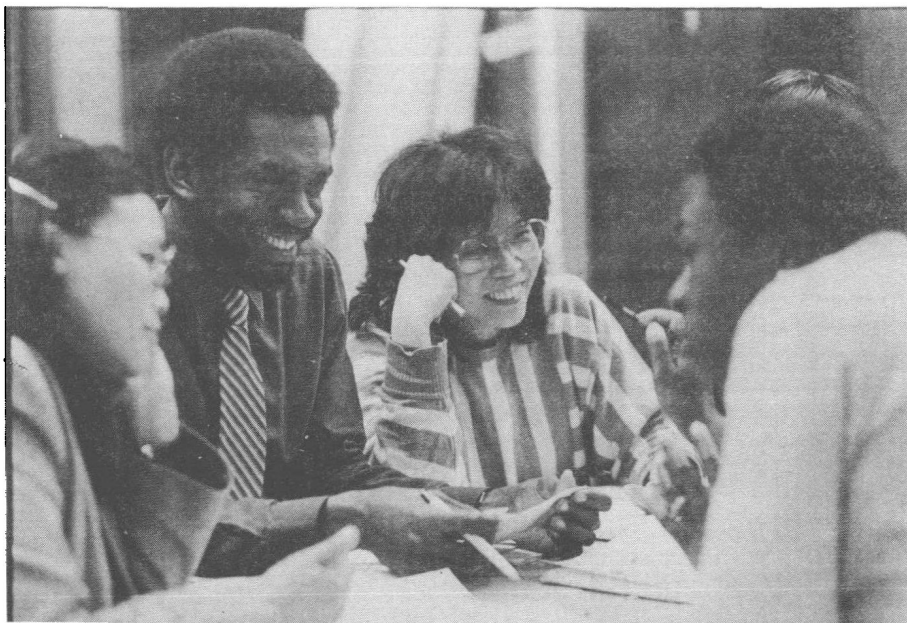
A BEd seminar

At most higher education institutions in Britain the academic year begins in September or October and is divided into three terms. There are however