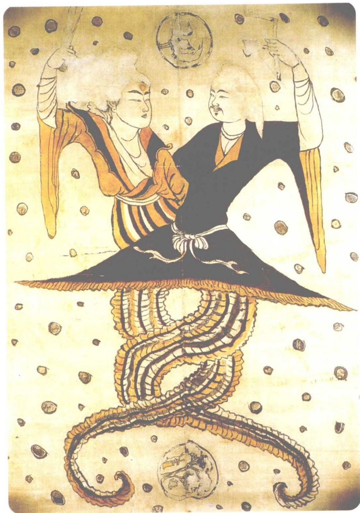
Fuxi and Nüwa (8th century), by anonymous. Nüwa is on the left, Fuxi is her brother, the circle at the top is the sun containing a three-footed bird, the smaller circles represent stars, the circle at the bottom is the moon containing a rabbit, cassia tree, and a toad. Unearthed at the Astana-Harahojo Ancient Cemetery in Turfan.