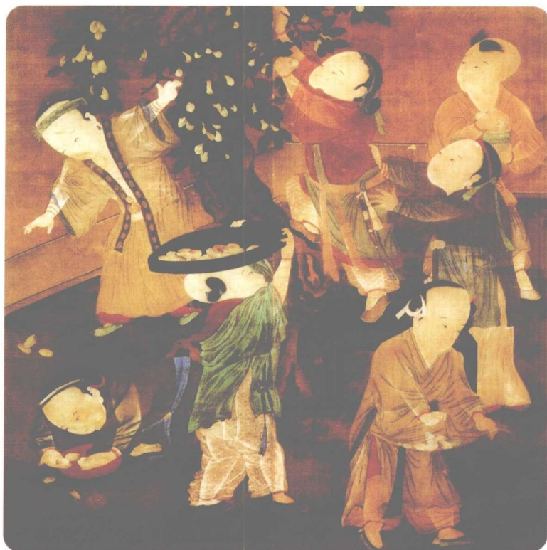
Assaulting the Jujube Tree , by an anonymous Chinese artist of the Song Dynasty (960-1279 AD)