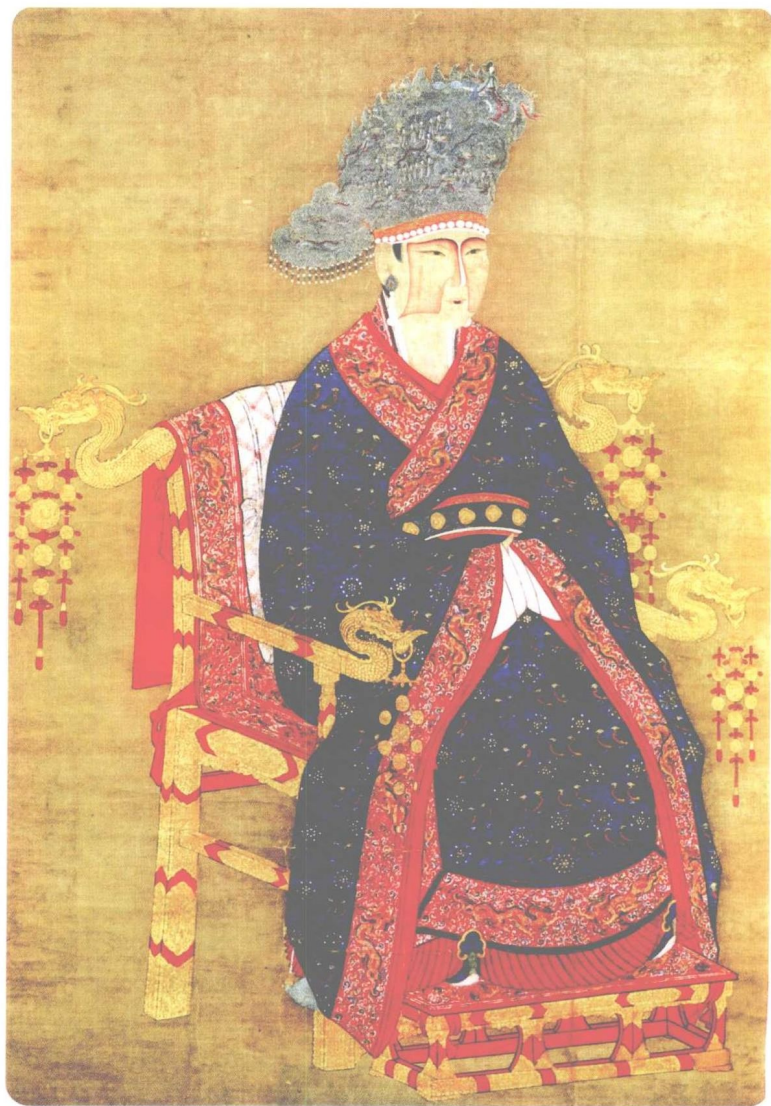
Empress of Zhenzong of Song (997-1022) by anonymous court painter