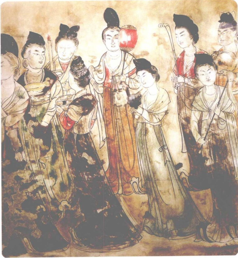
Tang court ladies (706 AD) by Anonymous, from the tomb of Princess Yongtai (Tang Dynasty) in the Qianling Mausoleum, near Xi'an in Shaanxi, China.