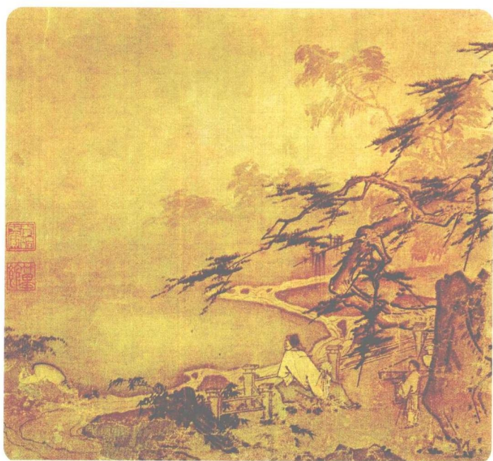
A landscape painting, by Ma Lin (Song Dynasty, 960-1279)