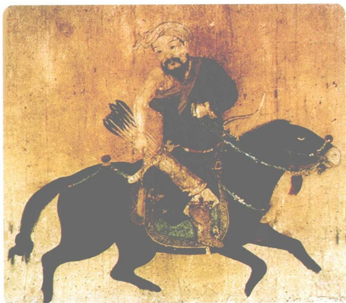
Mongol light cavalryman (15th to 16th century, Ming dynasty), by anonymous.