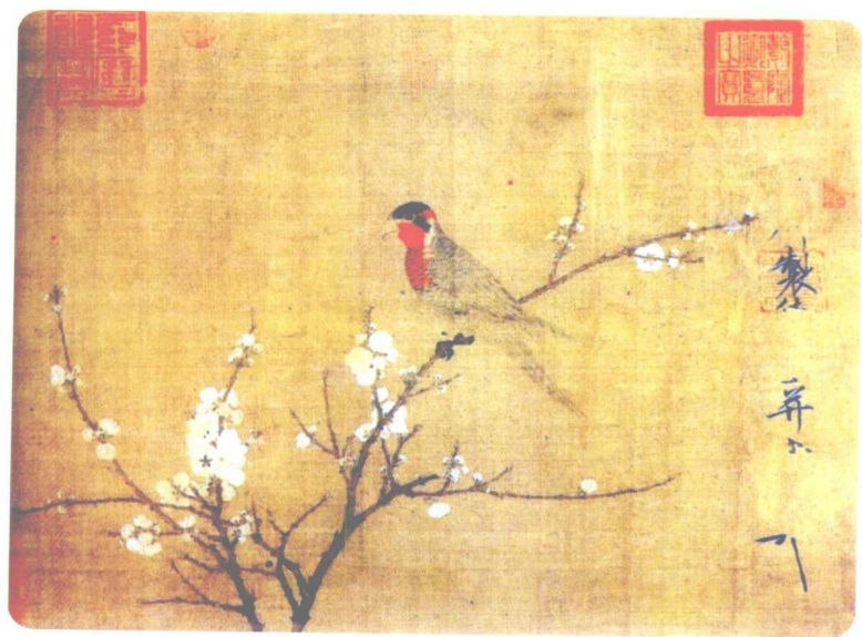
The Five Color Parakeet , a Chinese painting with ink and color on silk, attributed to Emperor Huizong of Song (1100-1125 AD), now located at the Museum of Fine Arts, Boston.