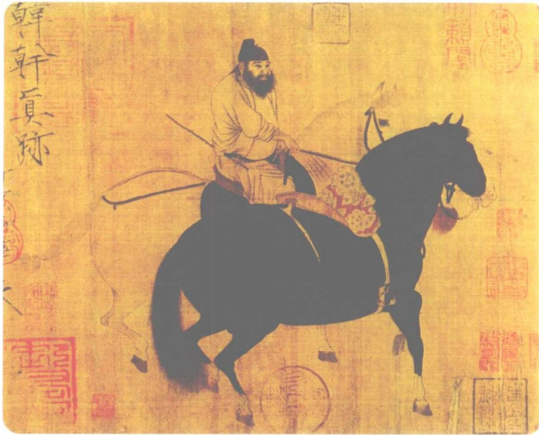
A Tang Dynasty painting of two prized horses and one rider (8th century) by Han Gan