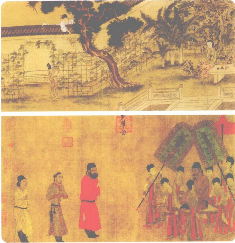
Scene from The Story of the Western Wing (ca. 1494-1552), traditionally attributed to Qiu Ying