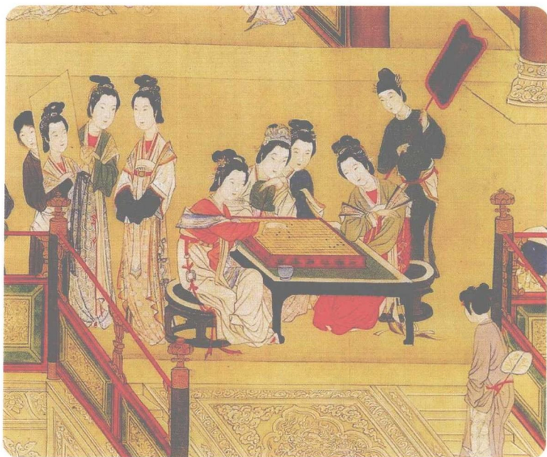
Go Players at the Imperial Court (16th century, Ming Dynasty), by Qiu Ying