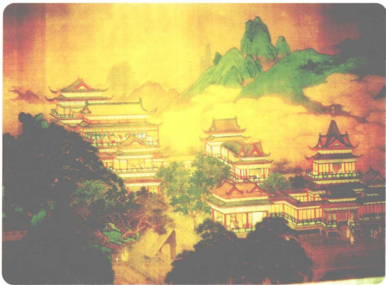
Peach Festival of the Queen Mother of the West , by an anonymous in the early 17th century (Ming Dynasty)