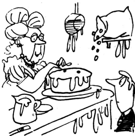
Aunt Mary's cakes are very good.