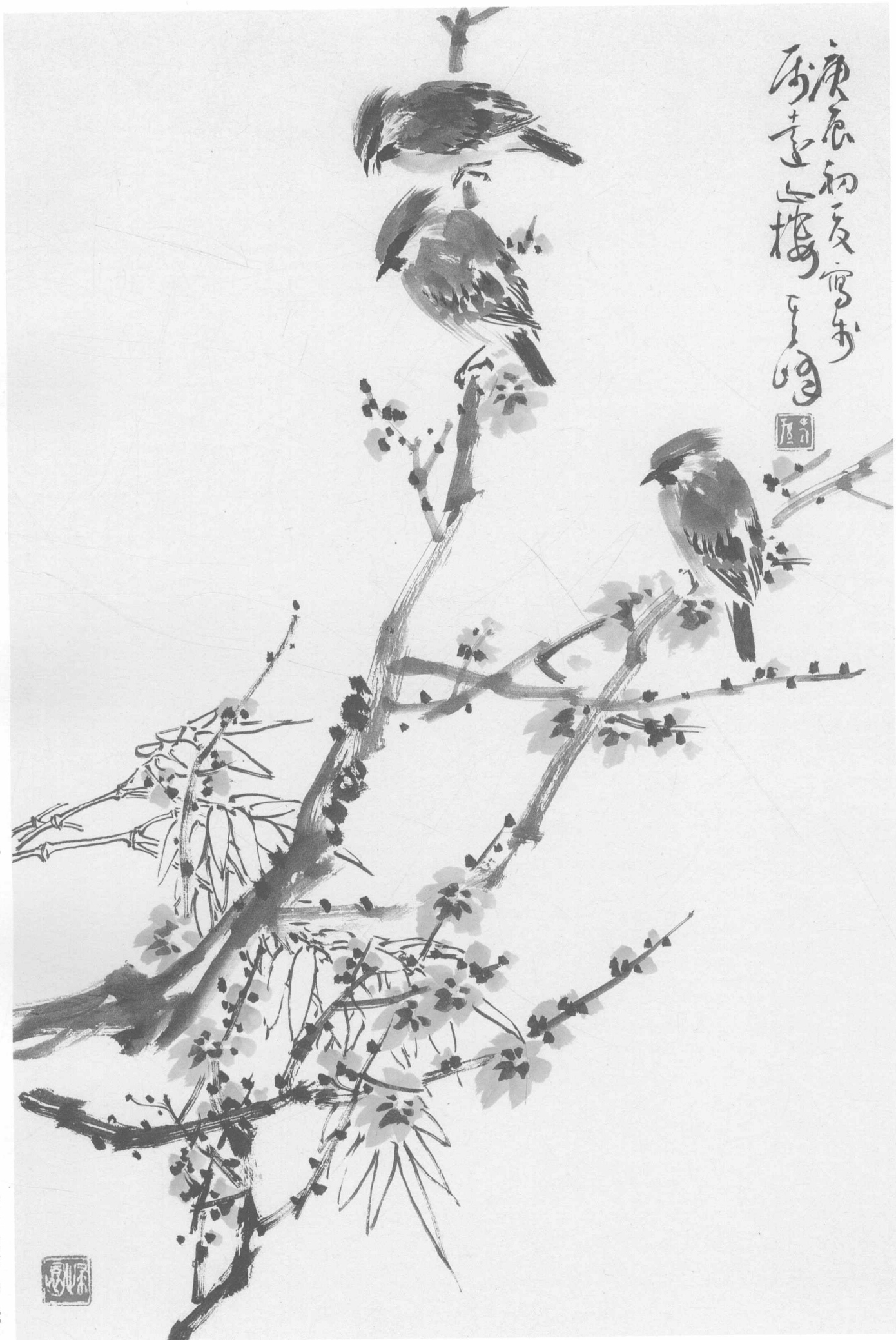
《太平腊梅》45 x 68cm