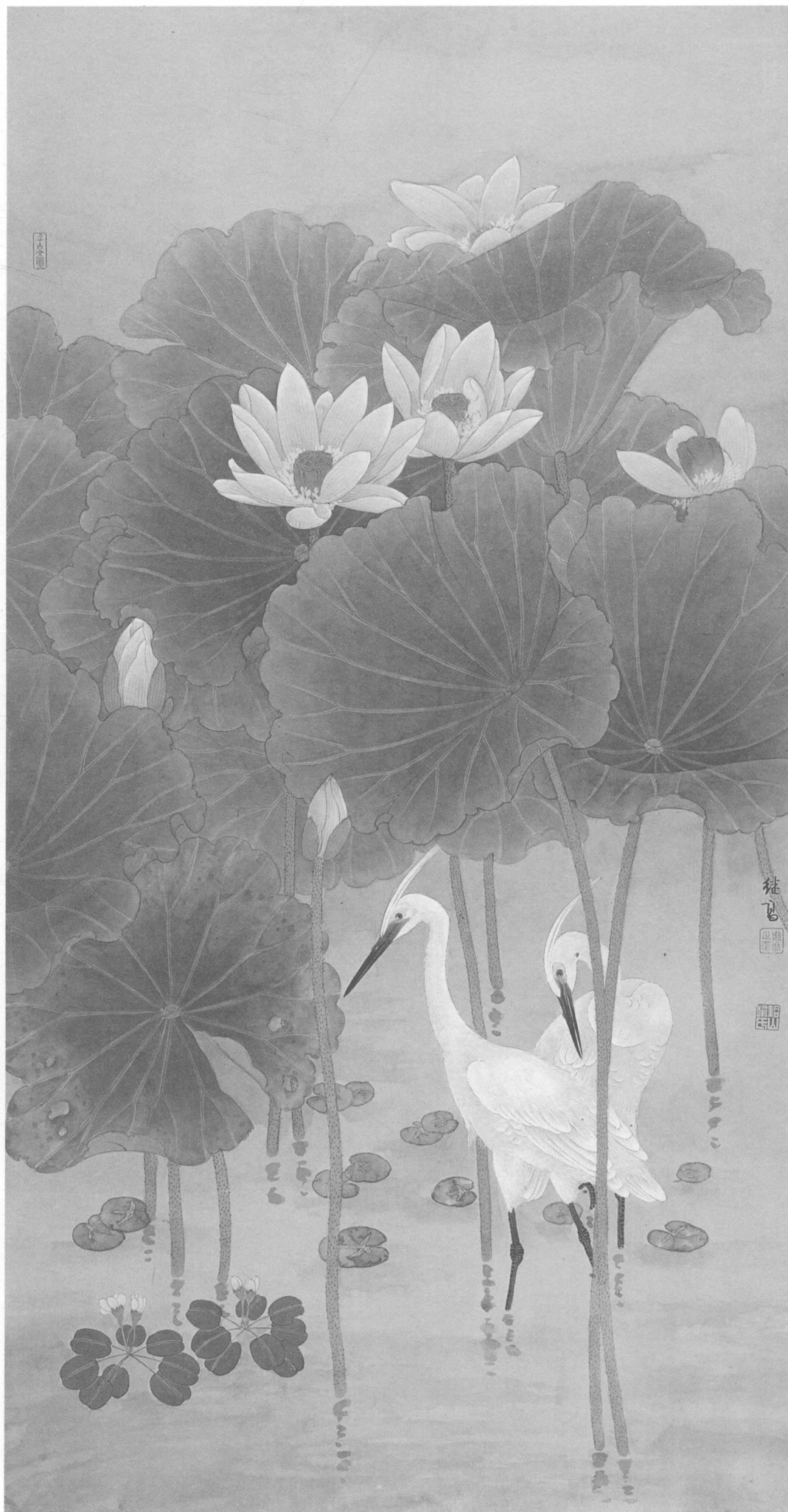
《秋荷白鹭》152 × 79cm