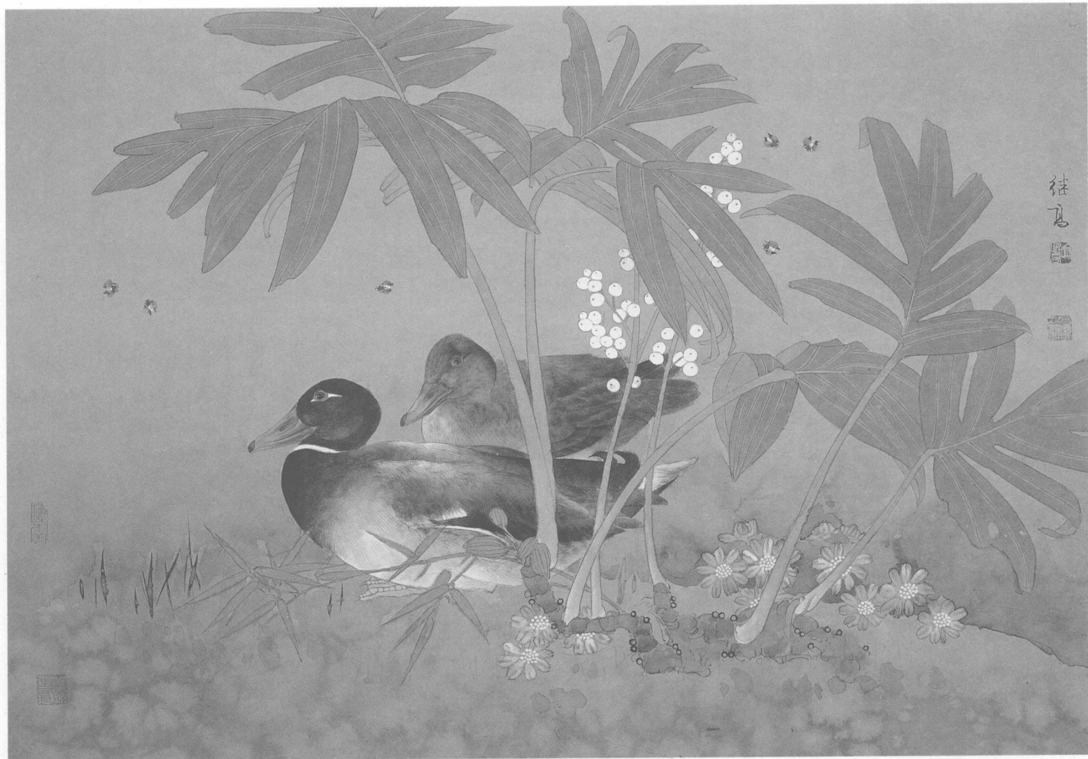
《秋池憩鸭》80 × 60cm