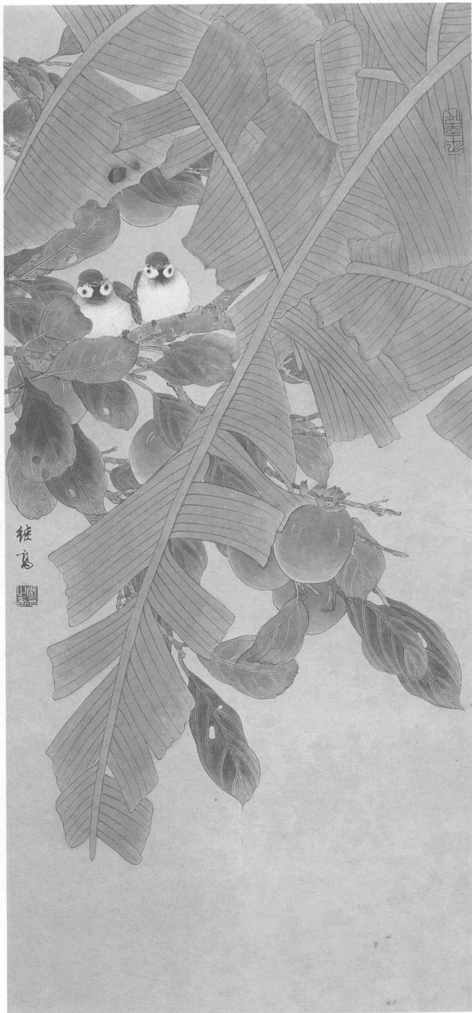
《蕉荫丹柿》84 × 39cm