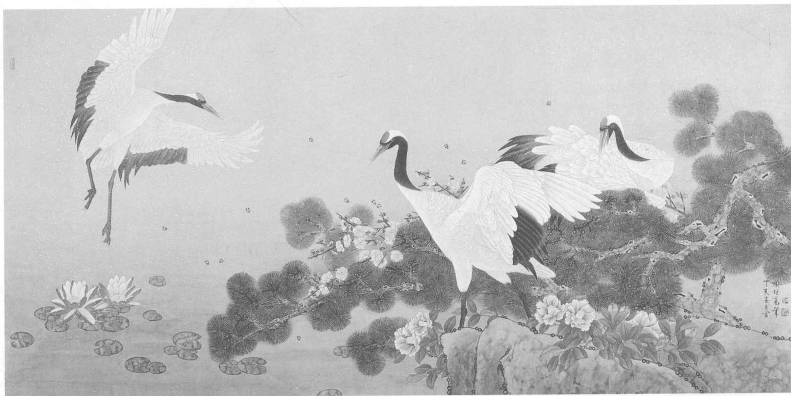
《白羽醉风》145 × 365cm