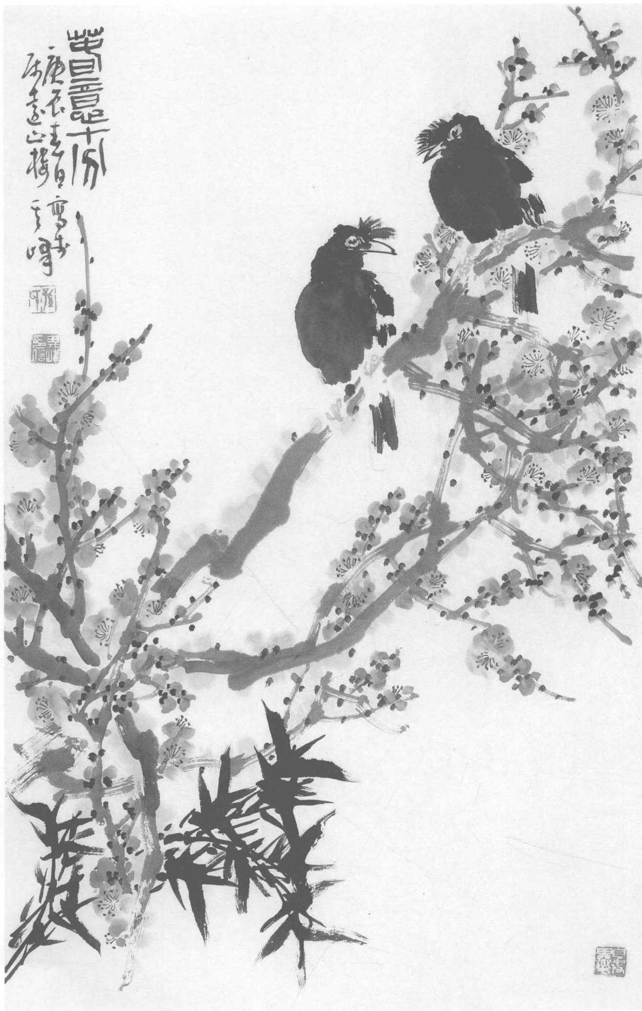
《春意十分》 45 x 68cm