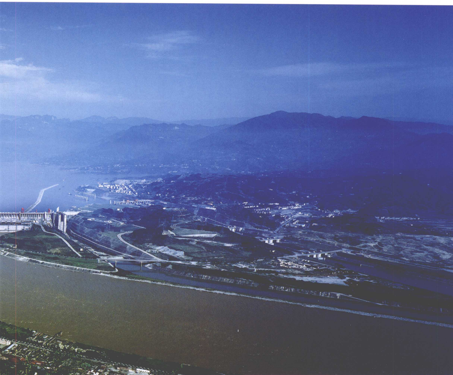
三峡工程全景 Panorama of the Three Gorges Project