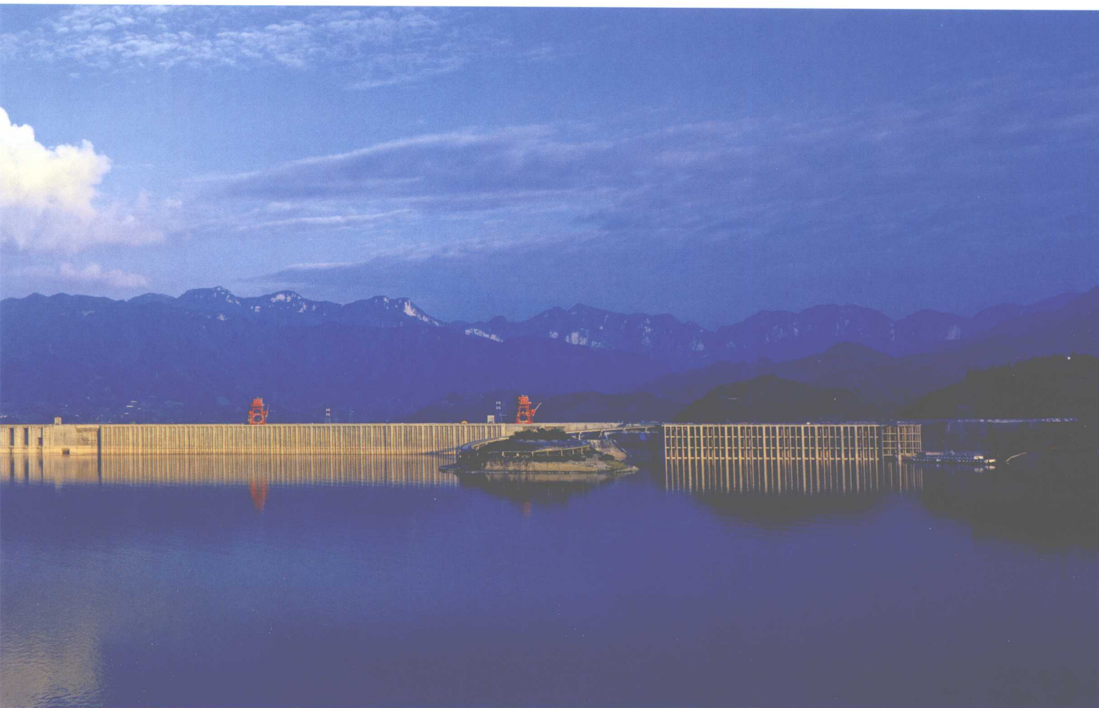
高峡出平湖 Mirror-like Lake in Deep Valleys