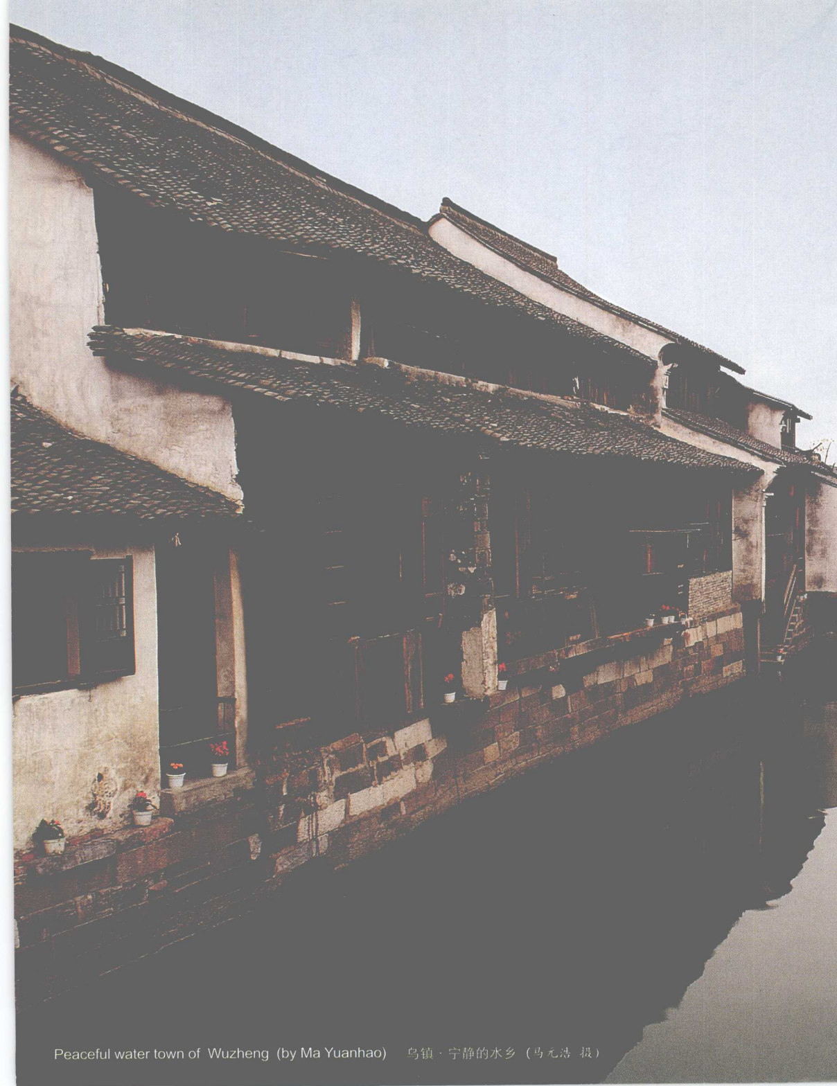
Peaceful water town of Wuzheng (by Ma Yuanhao) 乌镇·宁静的水乡 (马元浩 摄)