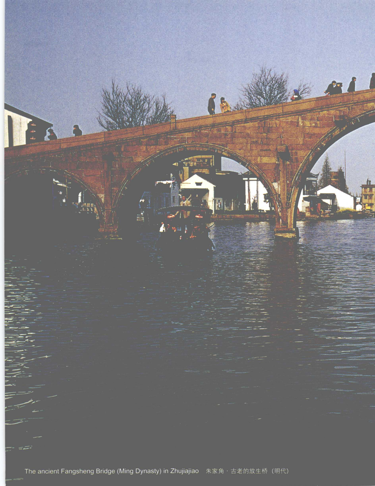
The ancient Fangsheng Bridge (Ming Dynasty) in Zhuji 朱家角 · 古老的放生桥 (明代)