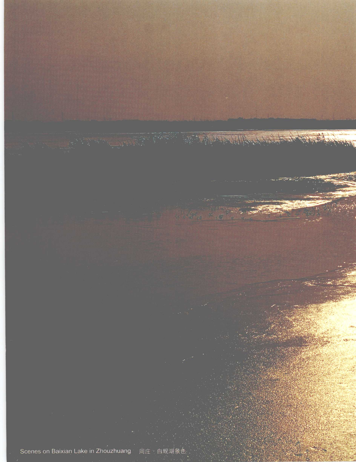
Scenes on Baixian Lake in Zhouzhuang 周庄·白蚬湖景色