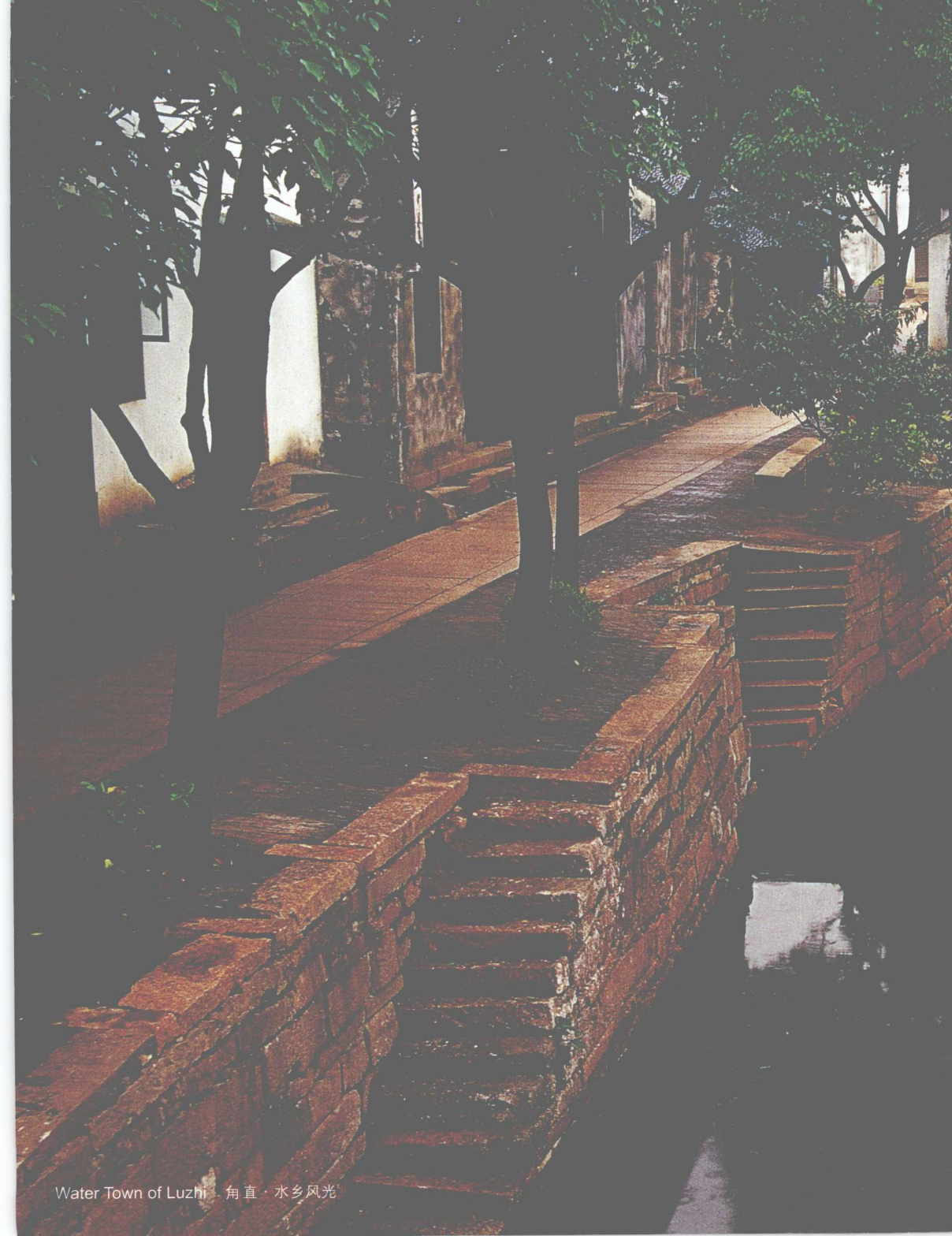
Water Town of Luzhi · 角直 · 水乡风光