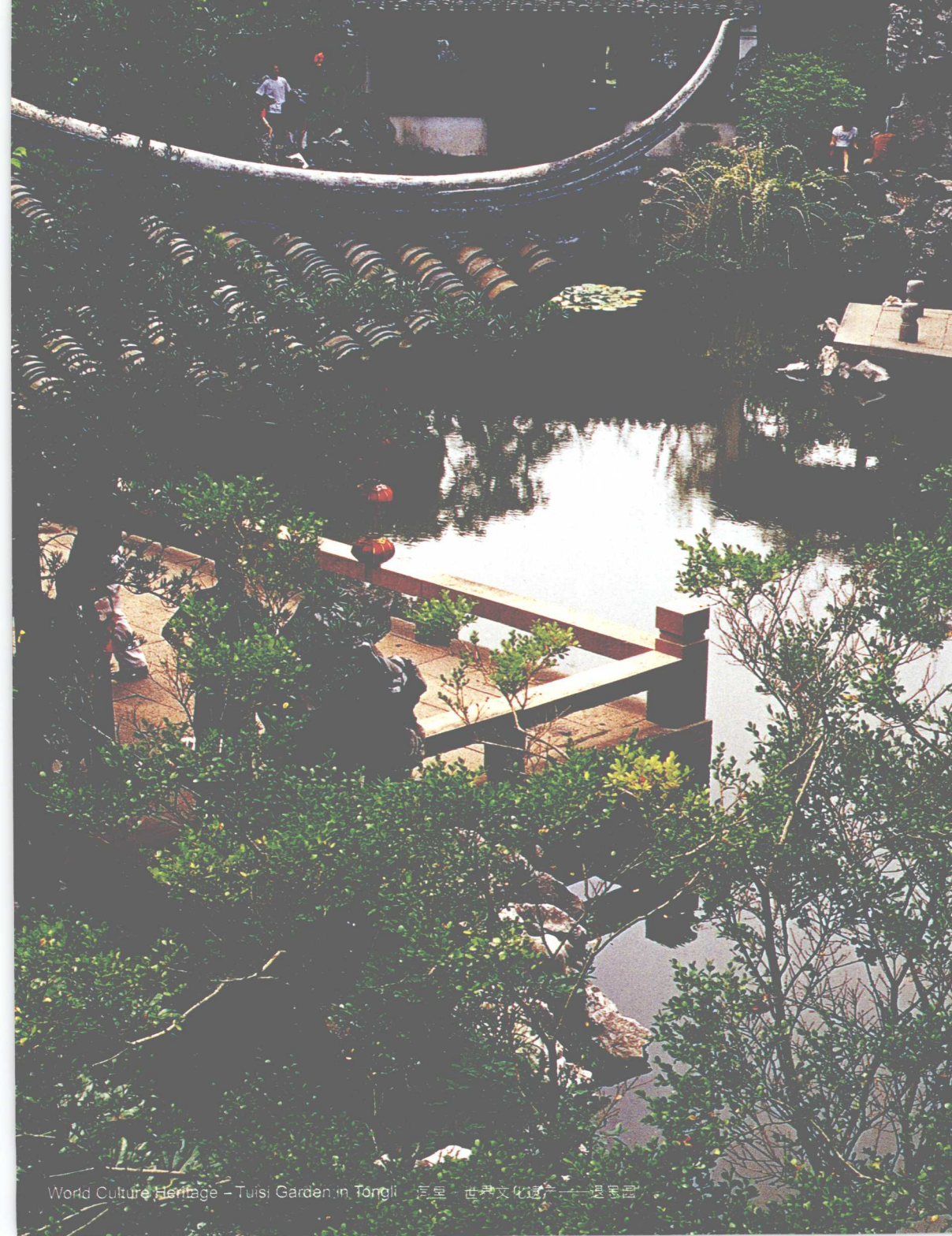
World Culture Heritage - Tuisi Garden in Tongli 同里 - 世界文化遺產 - 退思園