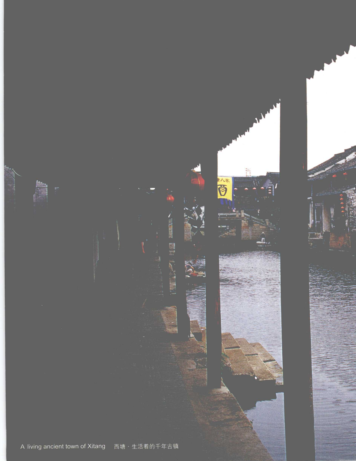
A living ancient town of Xitang 西塘 · 生活着的千年古镇