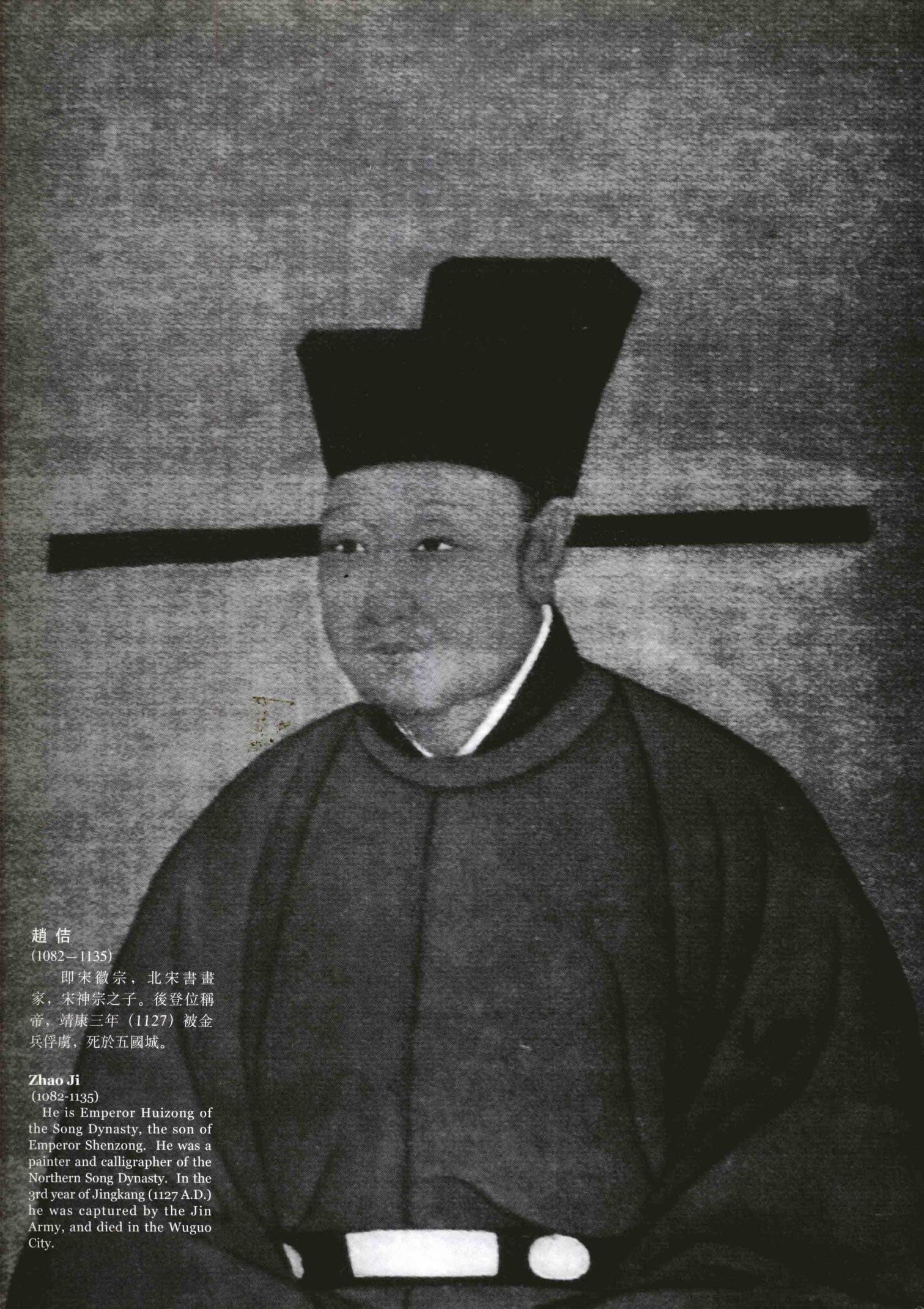
趙 佶 (1082—1135)

即宋徽宗，北宋書畫家，宋神宗之子。後登位稱帝，靖康三年（1127）被金兵俘虜，死於五國城。