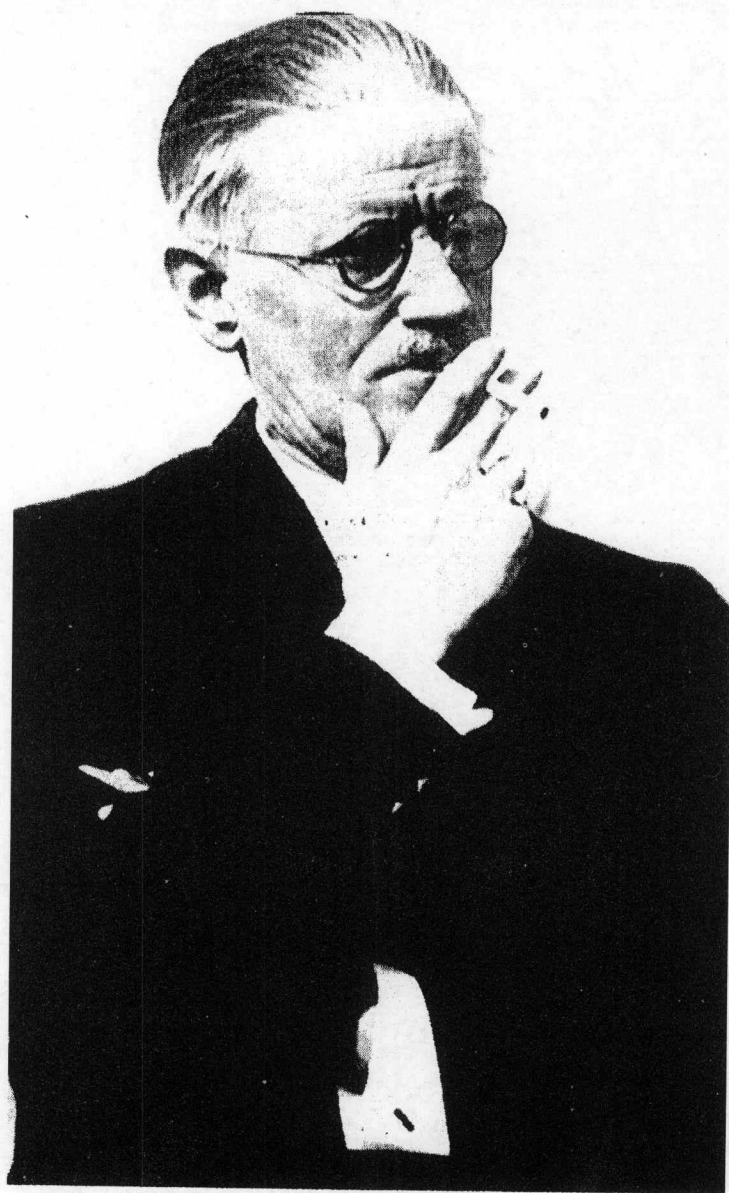
James Joyce in Zürich