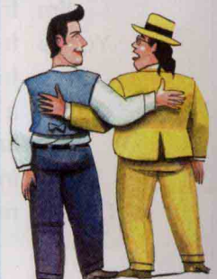
a pat on the back

Sources: A World of Difference Institute; www.brazilbrazil.com