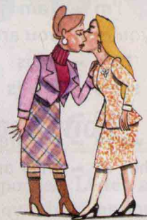
a kiss on the cheek